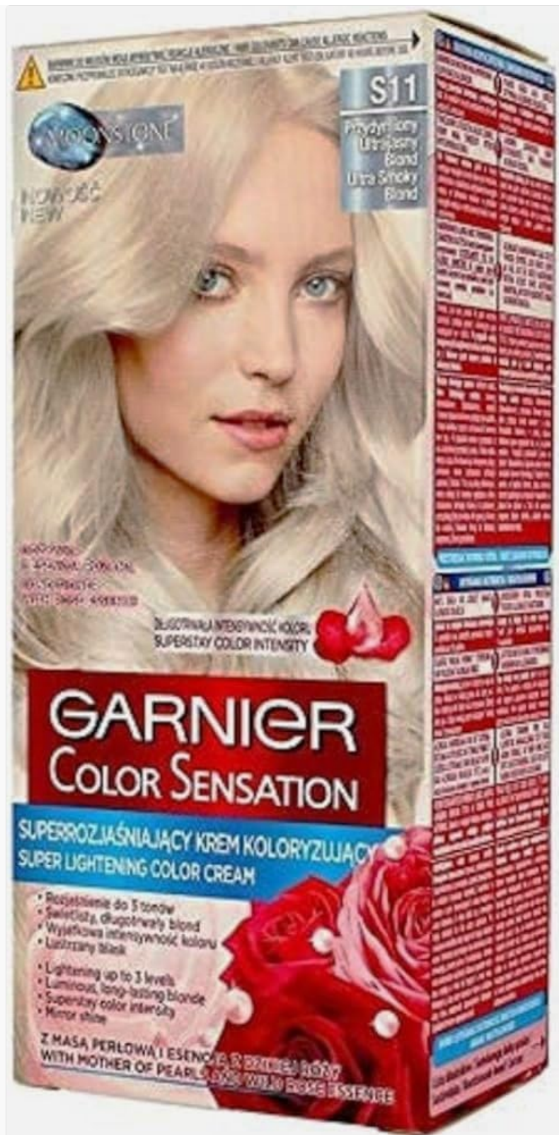
Image 3.1: Side view of the Garnier Color Sensation S11 Smoky Ultralight Blonde hair dye packaging. This view often contains detailed ingredient lists, warnings, and usage instructions in multiple languages.