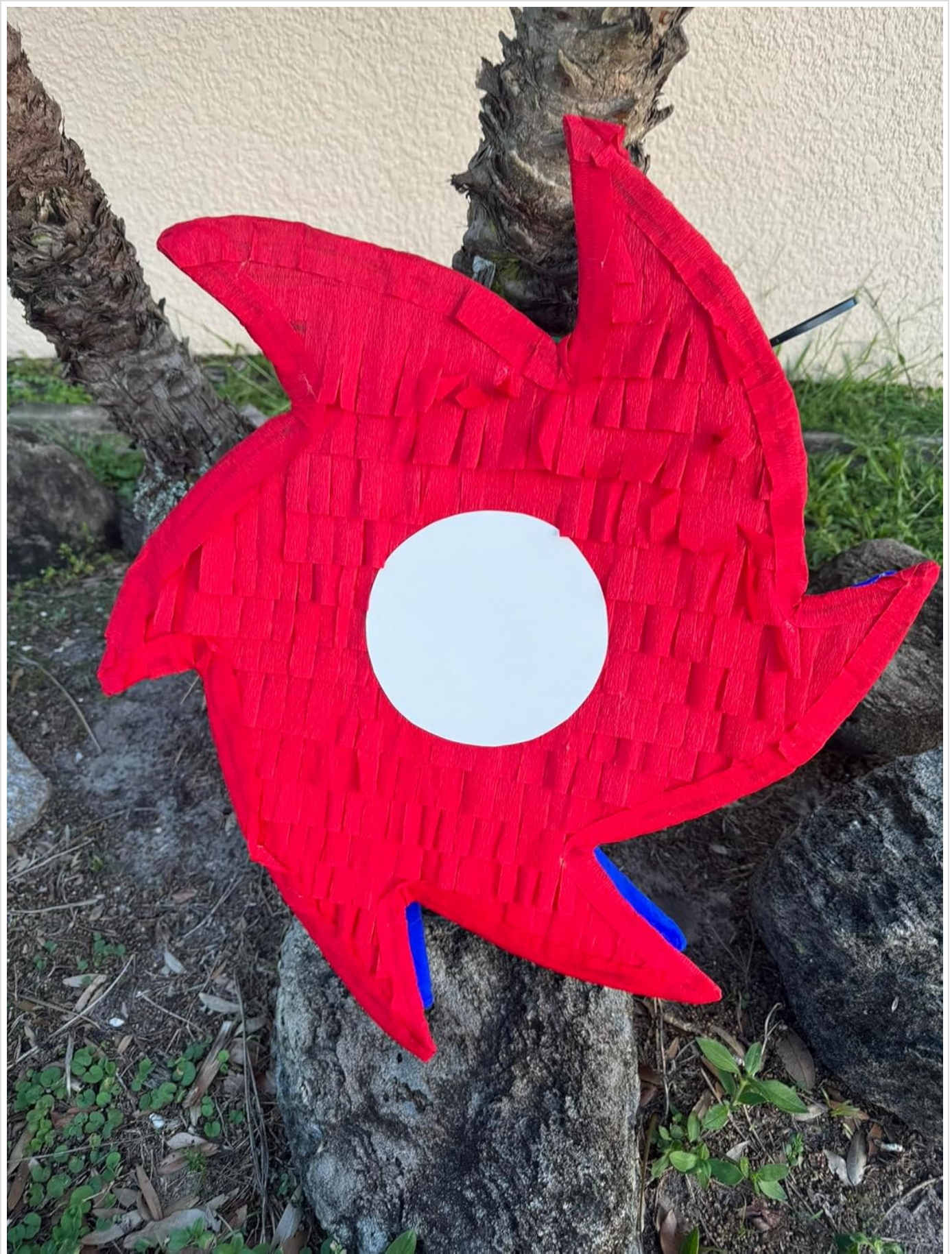
Image: The Whirlwind Sign Piñata positioned outdoors, leaning against a tree trunk. This image provides a sense of the piñata's scale and how it might appear in an outdoor party setting, ready for hanging.

sturdy support structure, such as a tree branch, ceiling hook, or a dedicated piñata stand. Verify that the hanging point can safely support the weight of the piñata once filled.