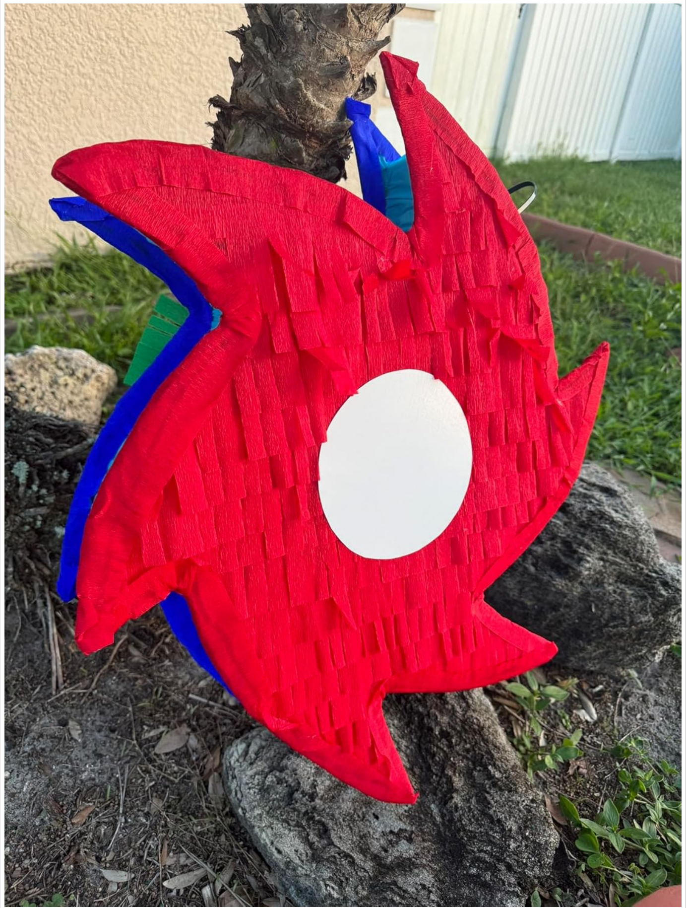
Image: Side view of the Whirlwind Sign Piñata, illustrating its depth and the typical location of the filling opening. The piñata is red with blue accents visible from the side.