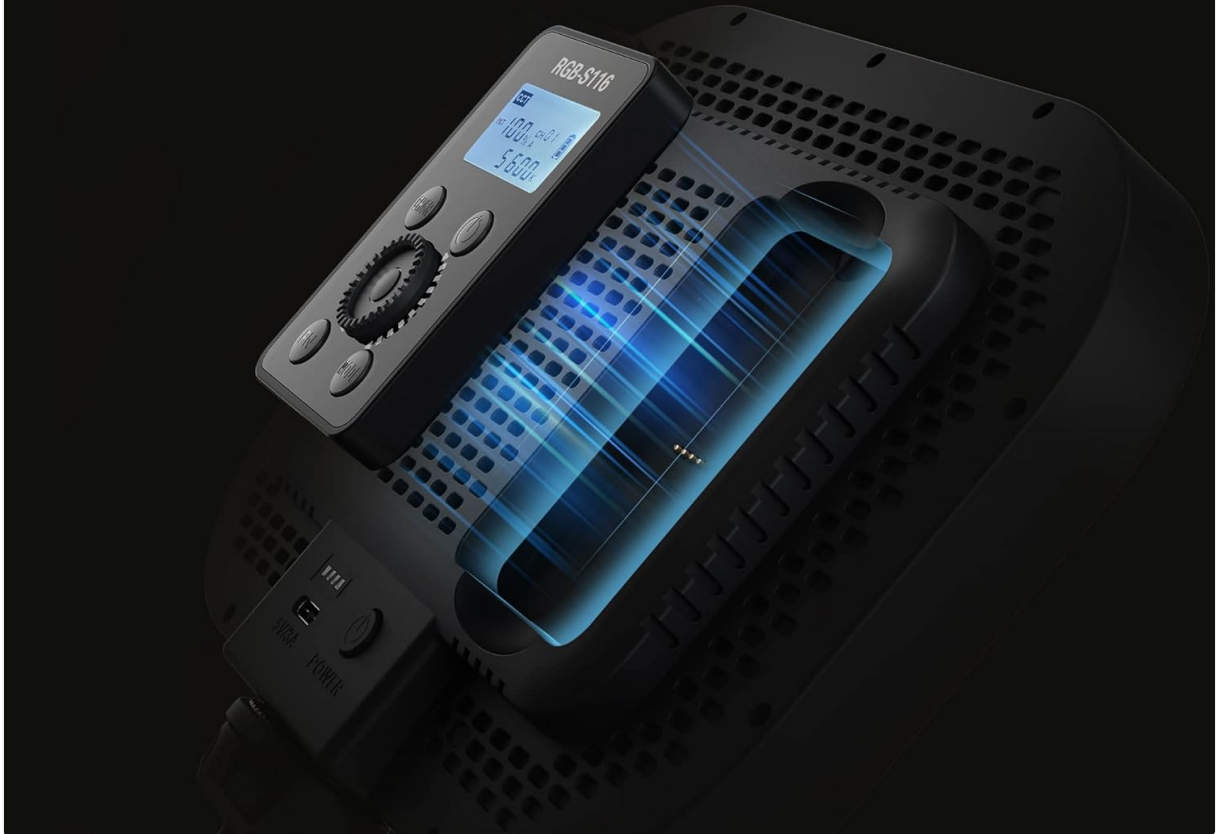
Image: This image demonstrates how the remote control easily connects, charges, and stores within the light's compartment, eliminating the need for an external app.

Don't bother with downloading an App just put the remote control on the compartment to finish the connection the charging and the store of the remot control