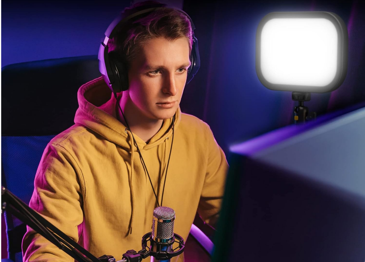
Image: This image highlights the eye-friendly design, showing the side-emitting technology and the built-in 4-layer diffuser that makes the light softer and protects your eyes.