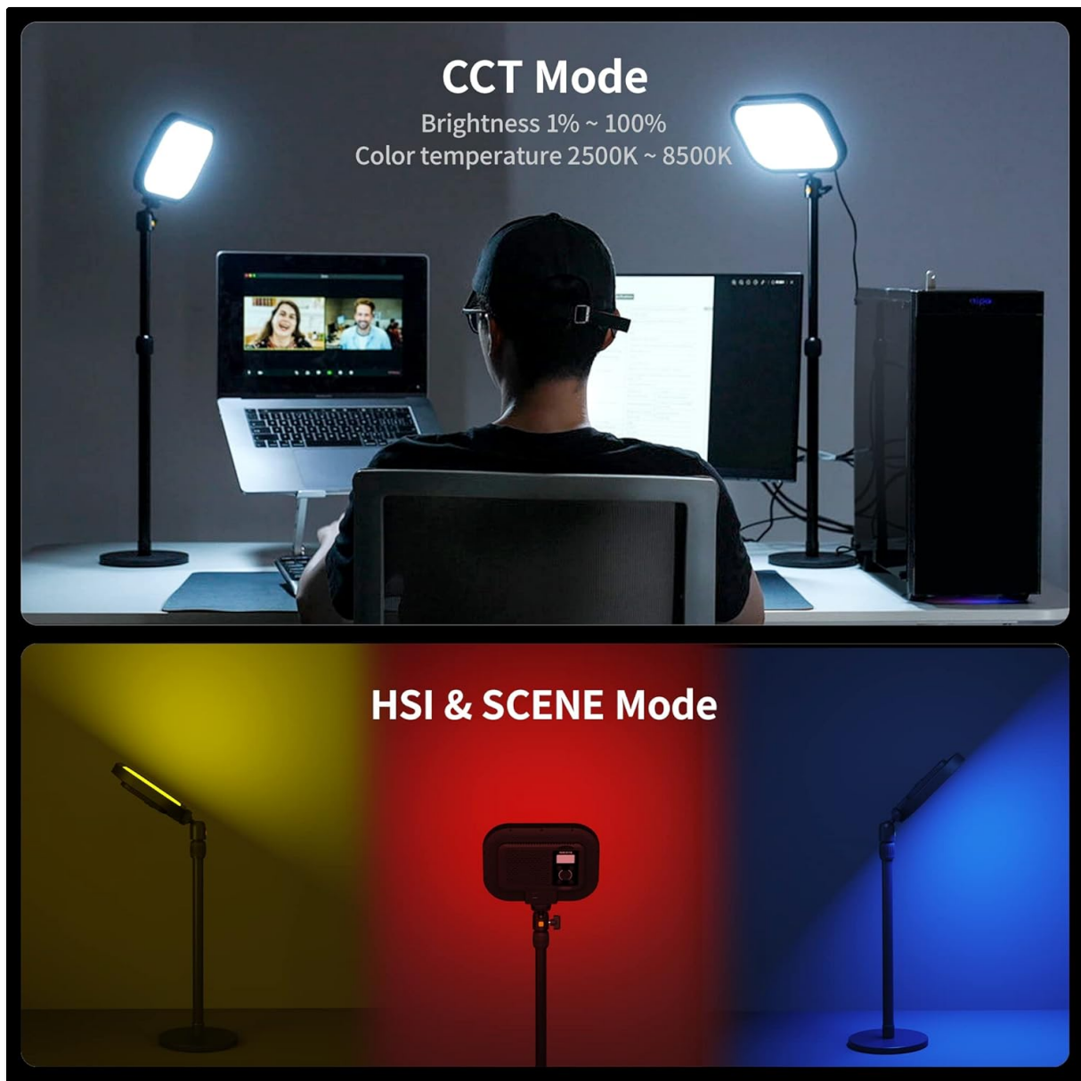
Image: The top panel shows two lights in CCT mode, demonstrating brightness (1%-100%) and color temperature (2500K-8500K) adjustments. The bottom panel illustrates HSI & Scene mode with yellow, red, and blue lighting.