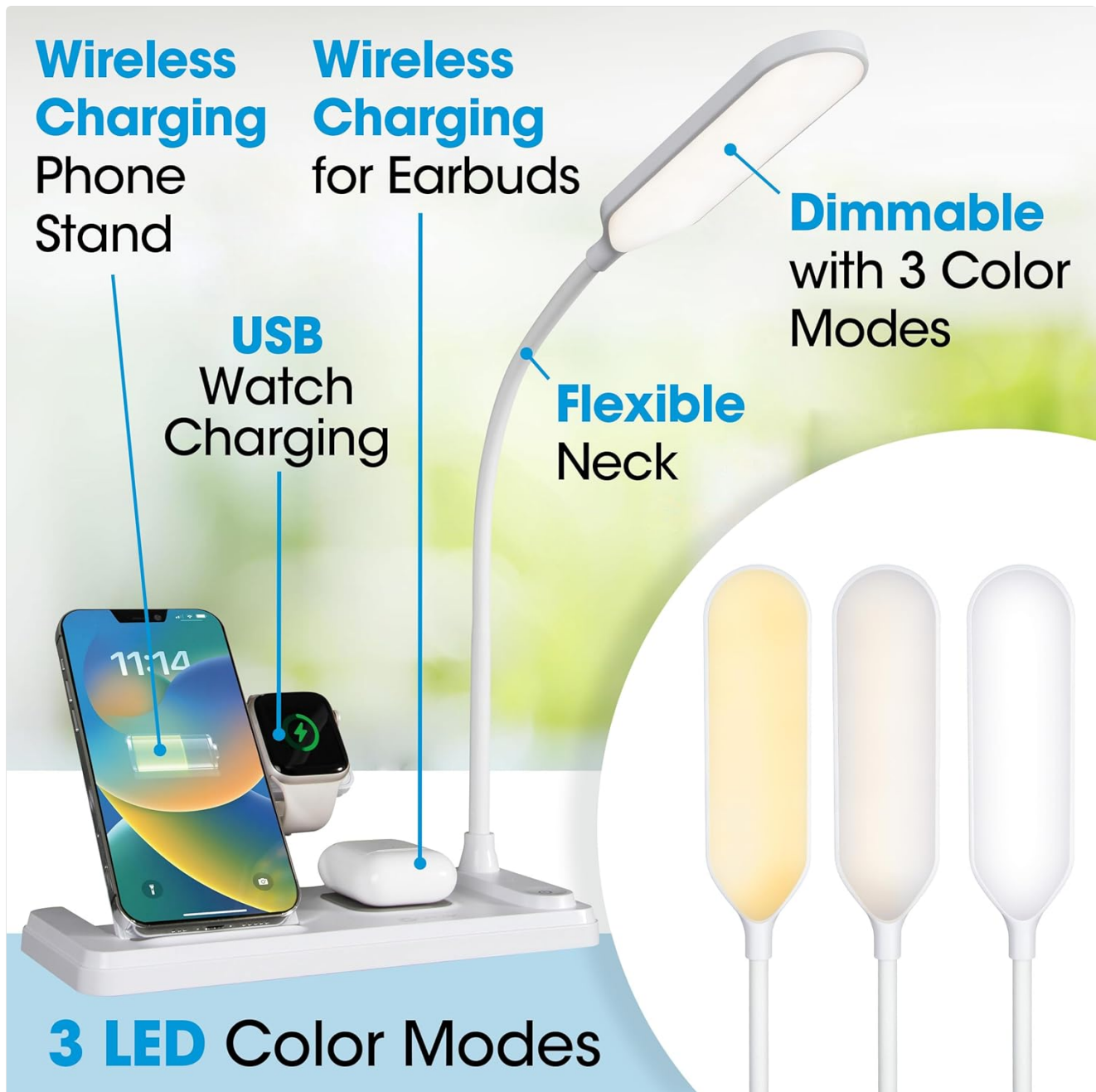
Figure 3: Overview of product features.