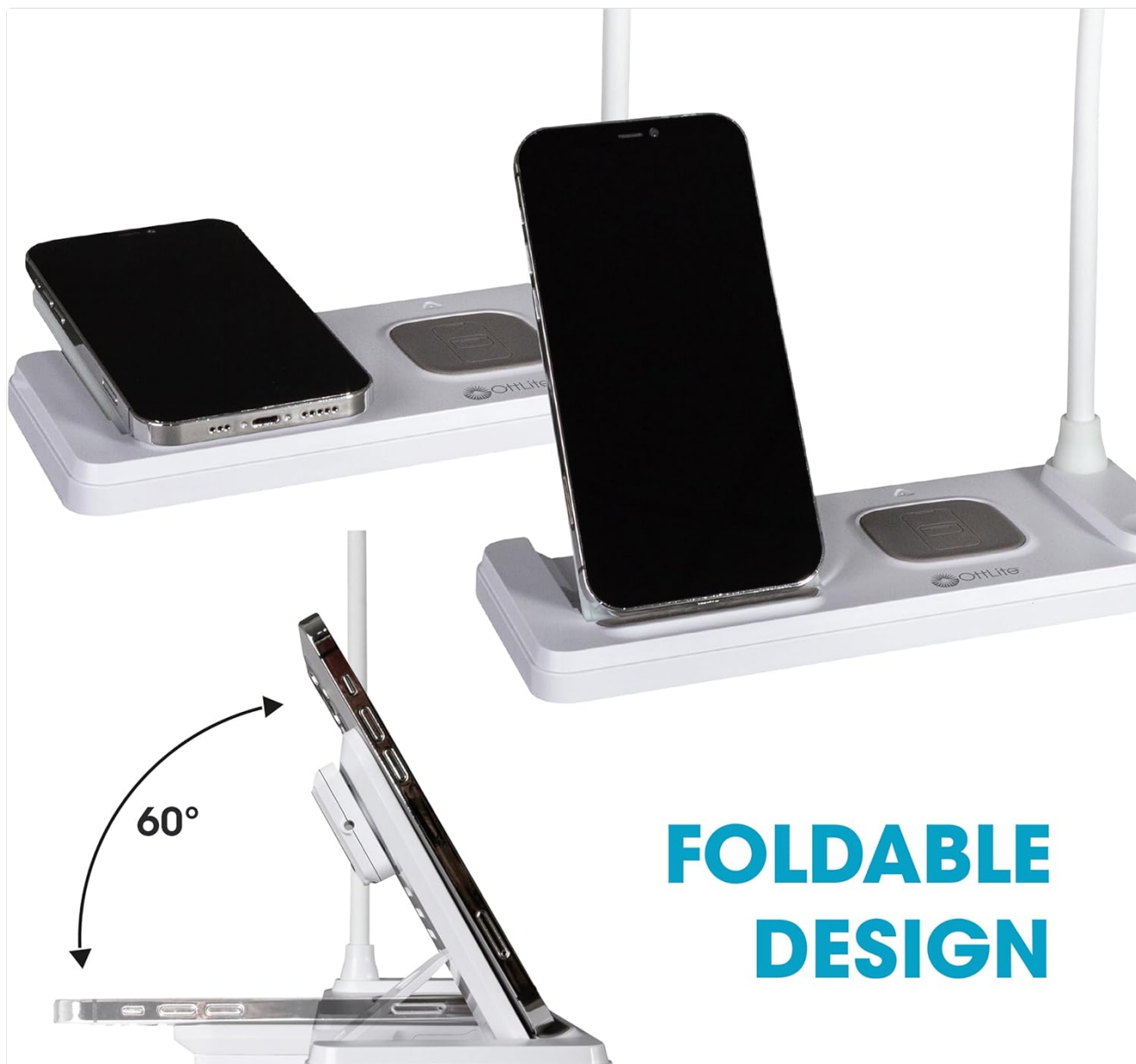
Figure 5: Foldable phone stand design.