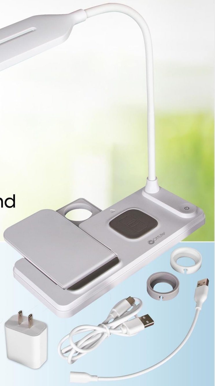
Figure 2: Included components with the OttLite LED Desk Lamp.