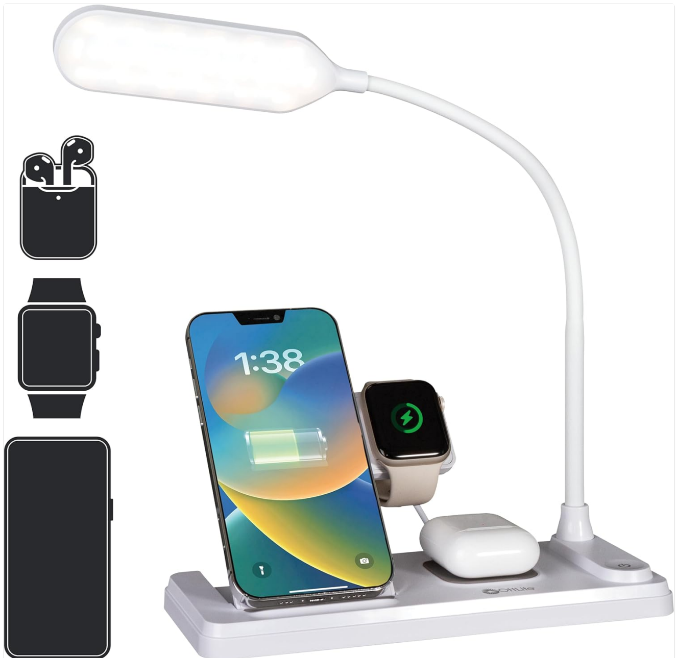
Figure 1: OttLite LED Desk Lamp with Charging Station.