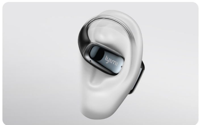
Image: An illustration demonstrating the effortless stability and secure fit of the headphones on the ear.

Crafted from ultra-fine titanium memory frame, these open-ear headphones effortlessly adapt to any ear shape, delivering a secure fit that stays put no matter the activity.