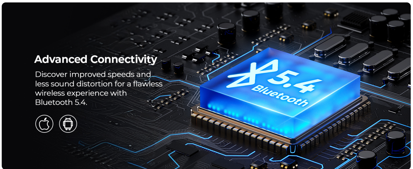
Image: Visual representation of the advanced Bluetooth 5.4 technology for seamless connectivity.