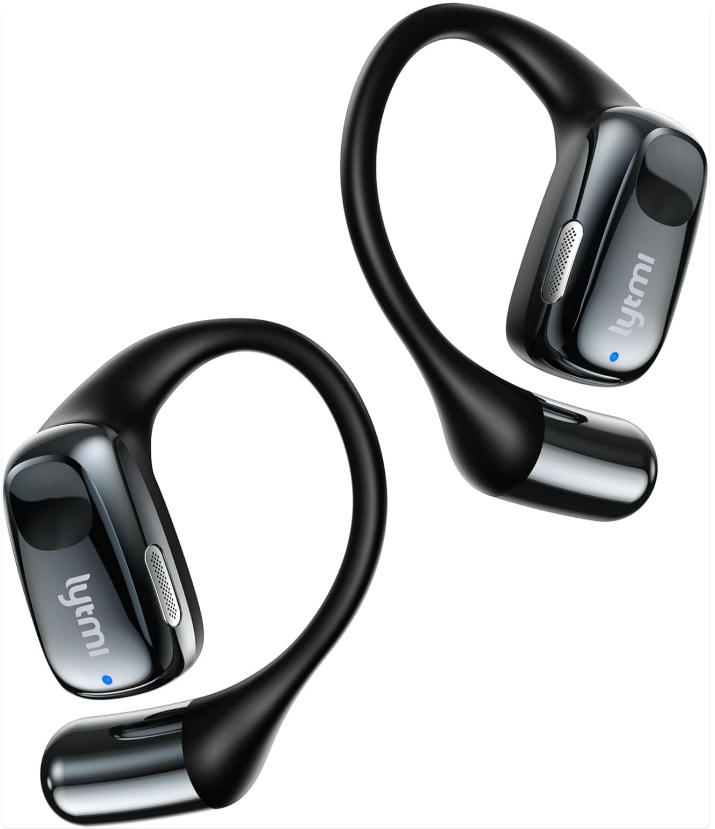
Image: Lytmi CozyFit Open Ear Headphones, showcasing their sleek black design and open-ear form factor.