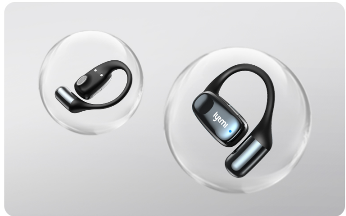
Image: The featherlight design of the CozyFit headphones, shown floating effortlessly.

It feels virtually weightless. At just 0.23 oz, it's so light you'll forget you're wearing it.