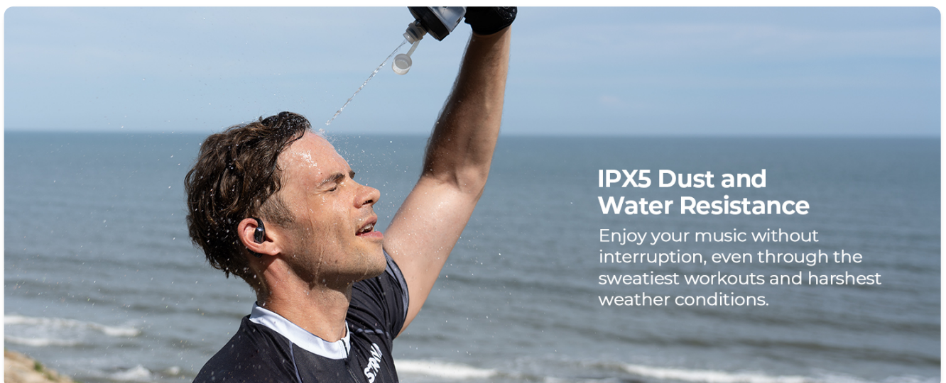
Image: A user demonstrating the IPX5 dust and water resistance of the headphones during an activity.