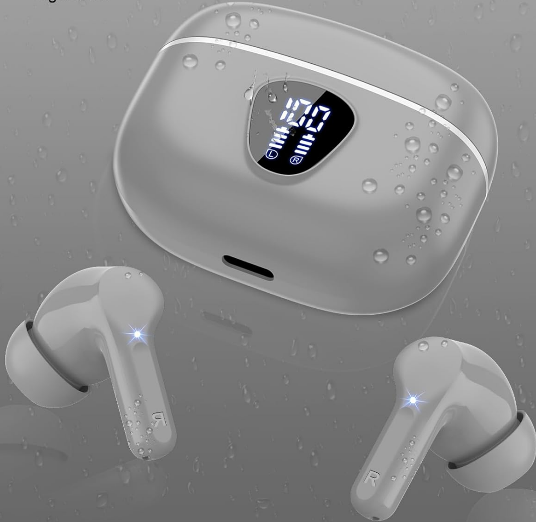
Image: The earbuds and charging case shown with water droplets, illustrating their IP7 waterproof and dustproof capabilities, suitable for various life situations.