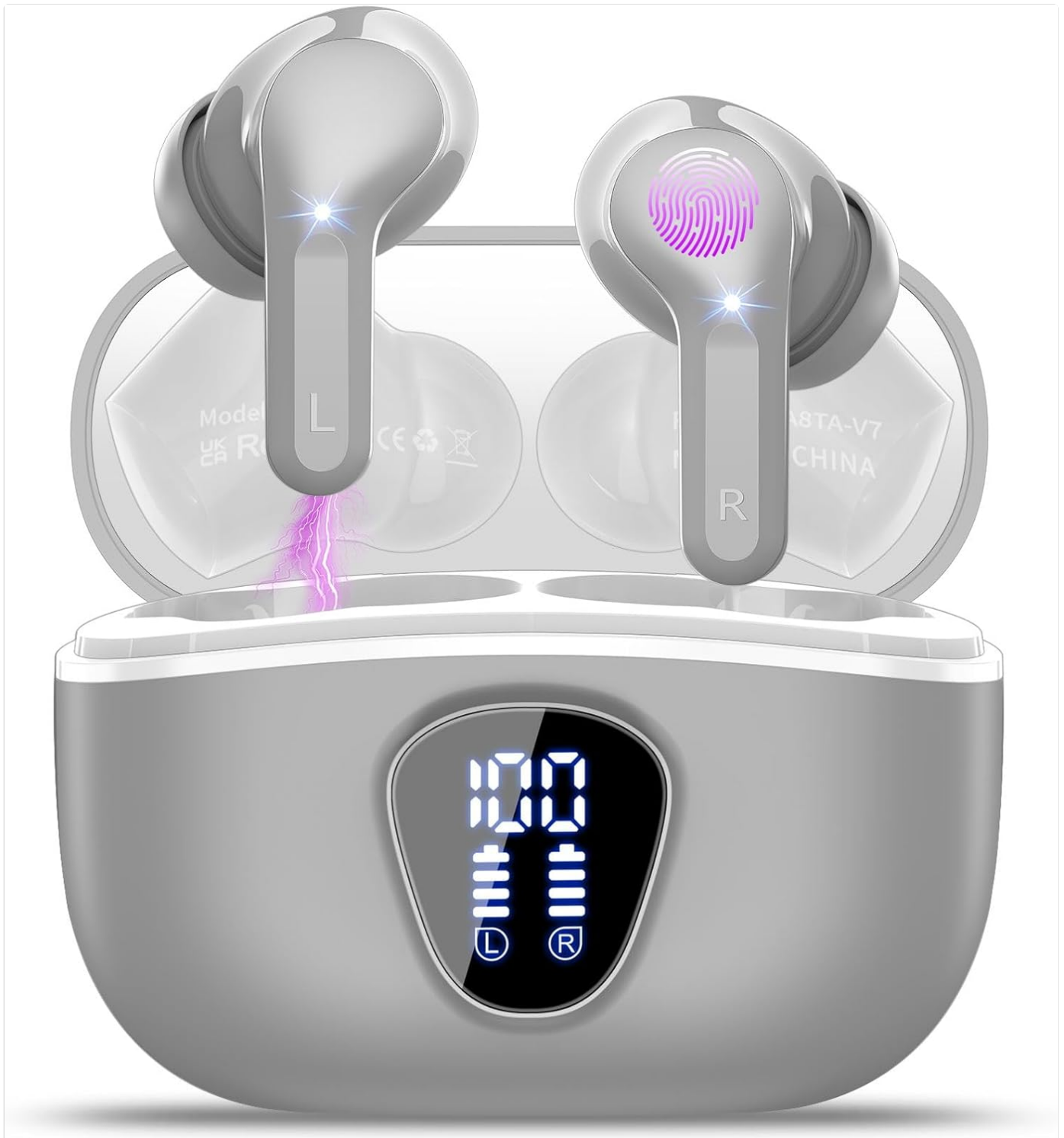
Image: The BESNOOW I53 earbuds resting in their charging case, which features an LED display showing the current battery percentage.