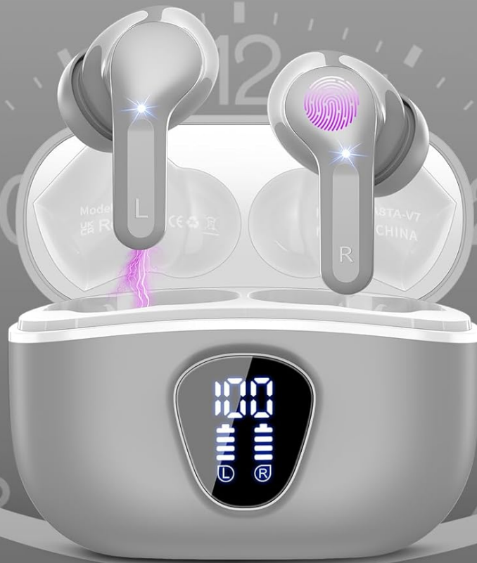
Image: The BESNOOW I53 earbuds and charging case, emphasizing the long battery life of up to 40 hours with the case and 8 hours per earbud charge.