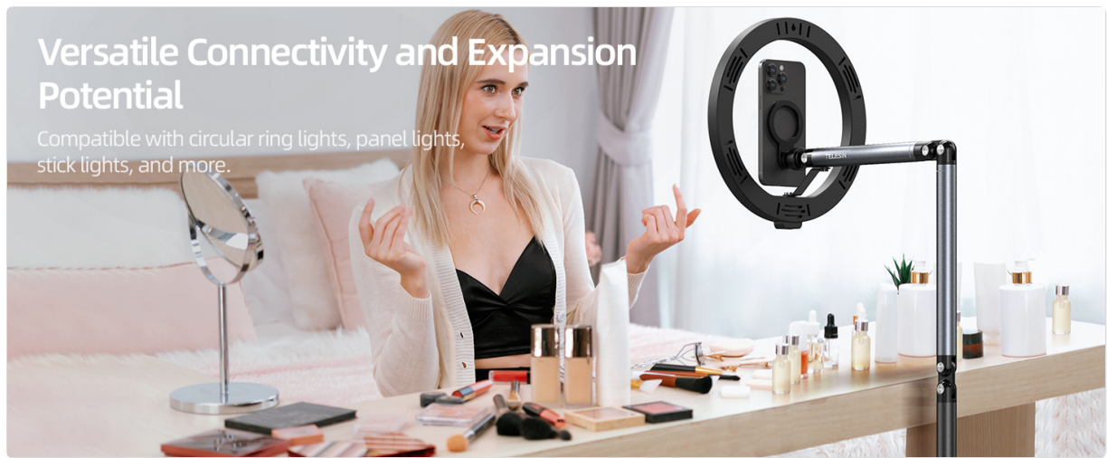
Figure 5.1: The stand supports various modes like selfie, overhead, and side views for diverse content creation.