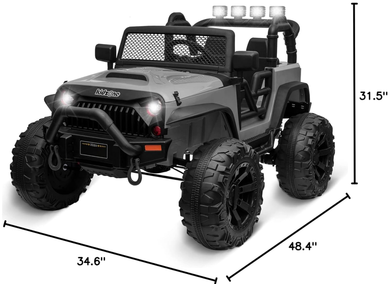
Detailed dimensions of the Kidzone 2 Seater Kids Large Ride On Truck.