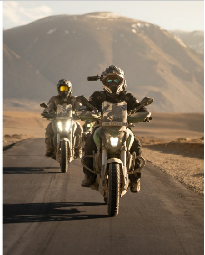
Figure 3.2: Dominar 400 design optimized for road trips.

Throaty exhaust with heavy bass note makes Dominar's presence felt to everyone.