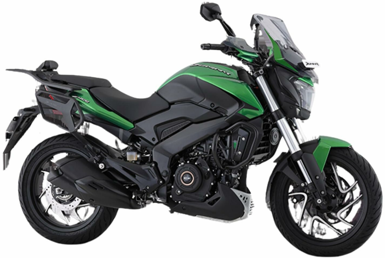
Figure 1.1: Bajaj Dominar 400 UG2 Motorcycle (Savanna Green)