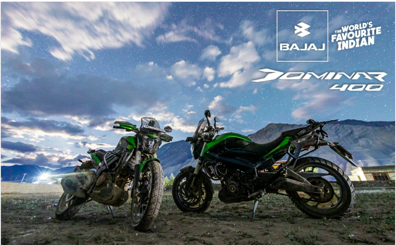
Figure 2.1: Dominar 400 Motorcycles in a scenic night setting.

The purchase of your Dominar 400 motorcycle involves a structured process to ensure a smooth transaction and delivery. The amount paid on Amazon is a booking amount for the ex-showroom price only. Additional charges for registration, road tax, and insurance are to be paid directly to the assigned dealership.