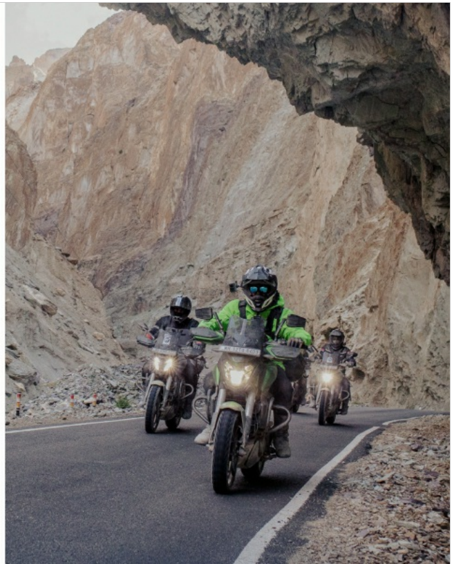
Figure 3.4: Dominar 400 riders demonstrating safety features on a mountain road.

Neatly tucked under the pillion seat, the 4 bungee straps help tie down luggage, enhancing the touring capabilities of the Dominar 400.