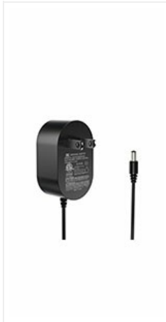
Image 4.1: The power adapter for charging the SunSare KCV02 main unit.