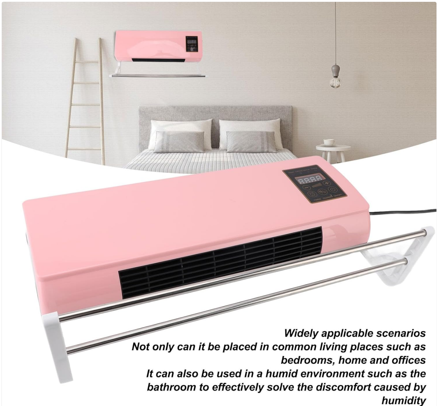
Image: The Haofy Smart Wall Heater shown mounted on a wall in a bedroom setting, demonstrating its space-saving design.