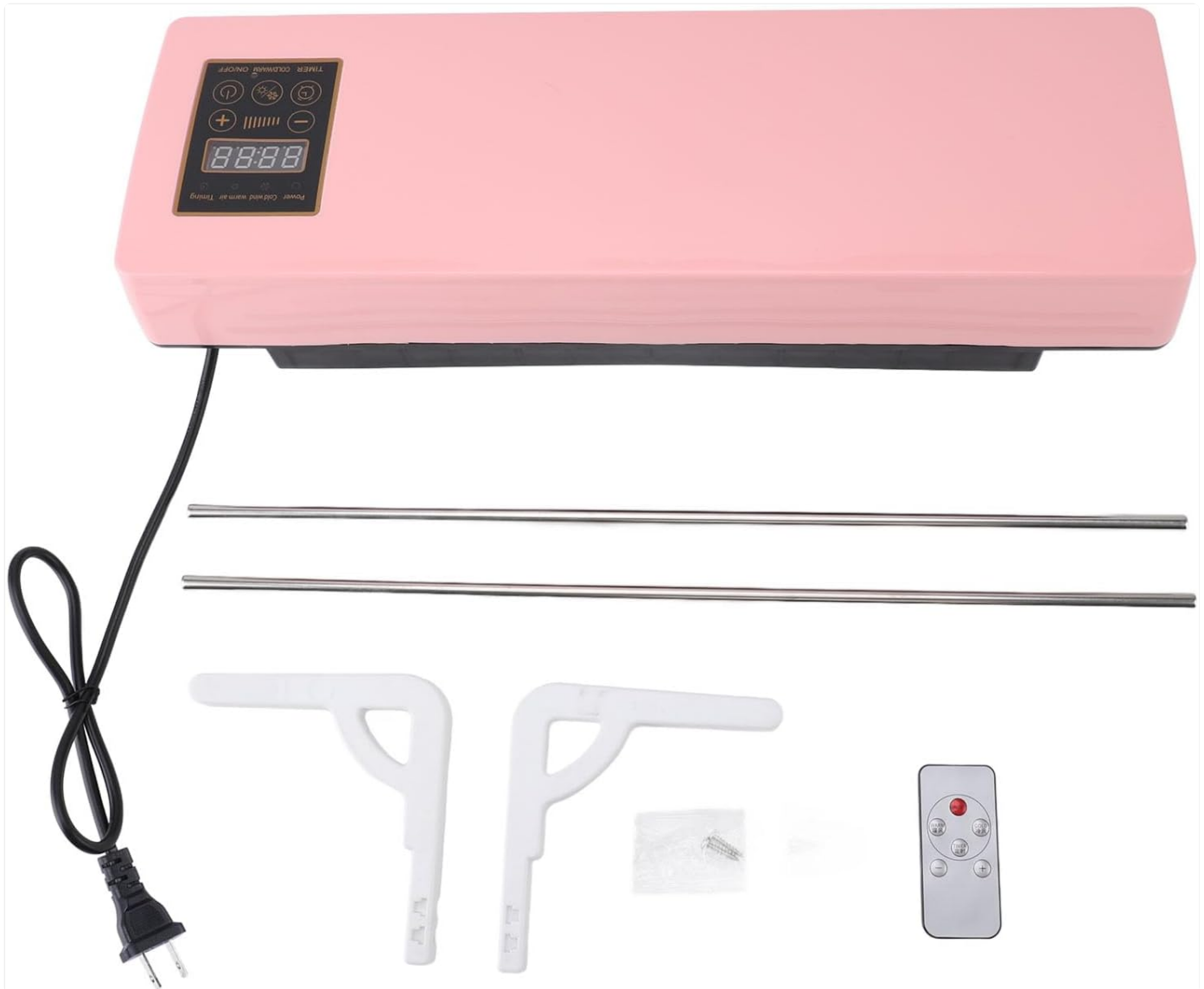
Image: All components included in the package, showing the heater unit, remote control, power cord, mounting brackets, screws, expansion studs, and two metal poles.