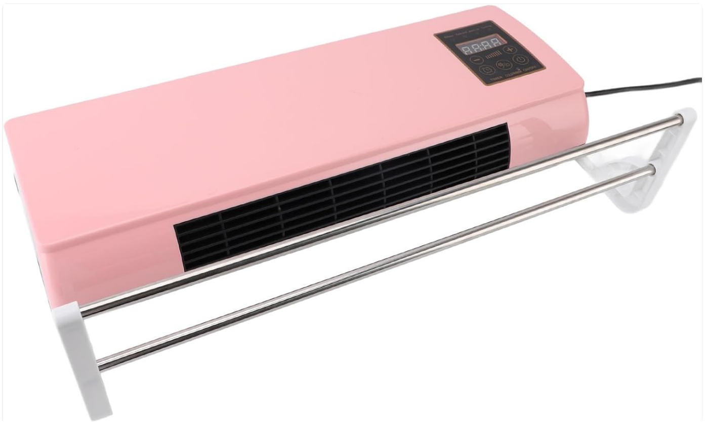
Image: An angled view of the Haofy Smart Wall Heater, wall-mounted, with the optional towel bars installed below the heating unit.