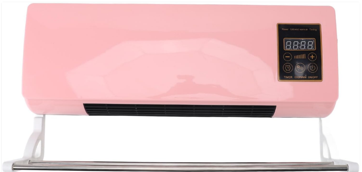
Image: The Haofy Smart Wall Heater displayed on a flat surface, illustrating its mobile design for desktop placement.

For localized warming, the heater can be placed on a stable, flat surface. Ensure the surface is heat-resistant and that the heater is not near any edges where it could fall.