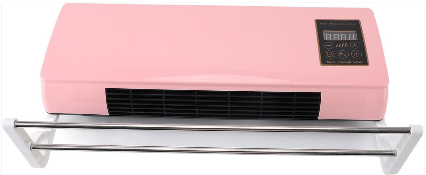
Image: A detailed view of the heater's control panel, showing the digital display and various function buttons.