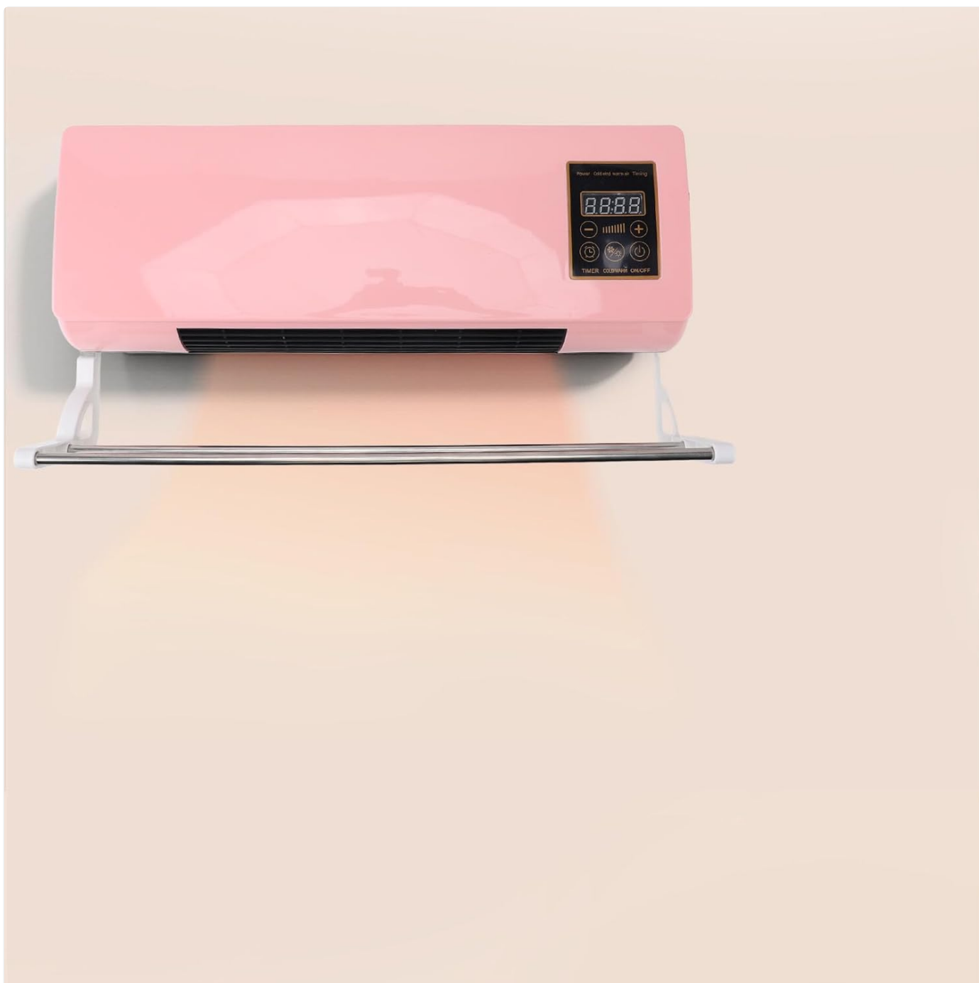
Image: The Haofy Smart Wall Heater in operation, showing warm air being emitted from the unit, indicating its heating function.