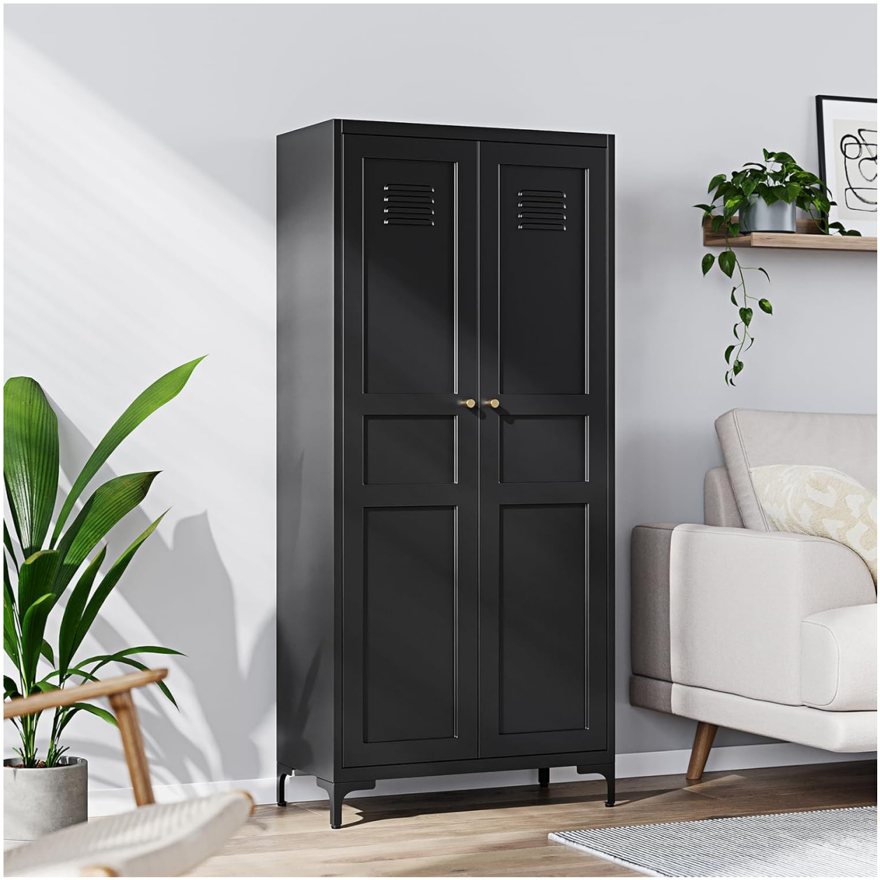
Image: The Yizosh Metal Pantry Storage Cabinet, black finish, shown in a contemporary living room.