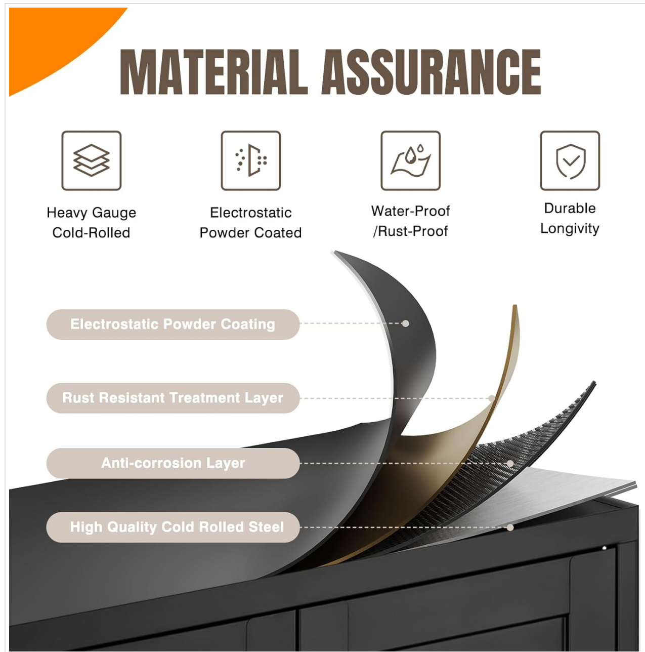
Image: Cross-section diagram detailing the robust material construction, including cold-rolled steel, anti-corrosion, rust-resistant, and electrostatic powder coating layers.