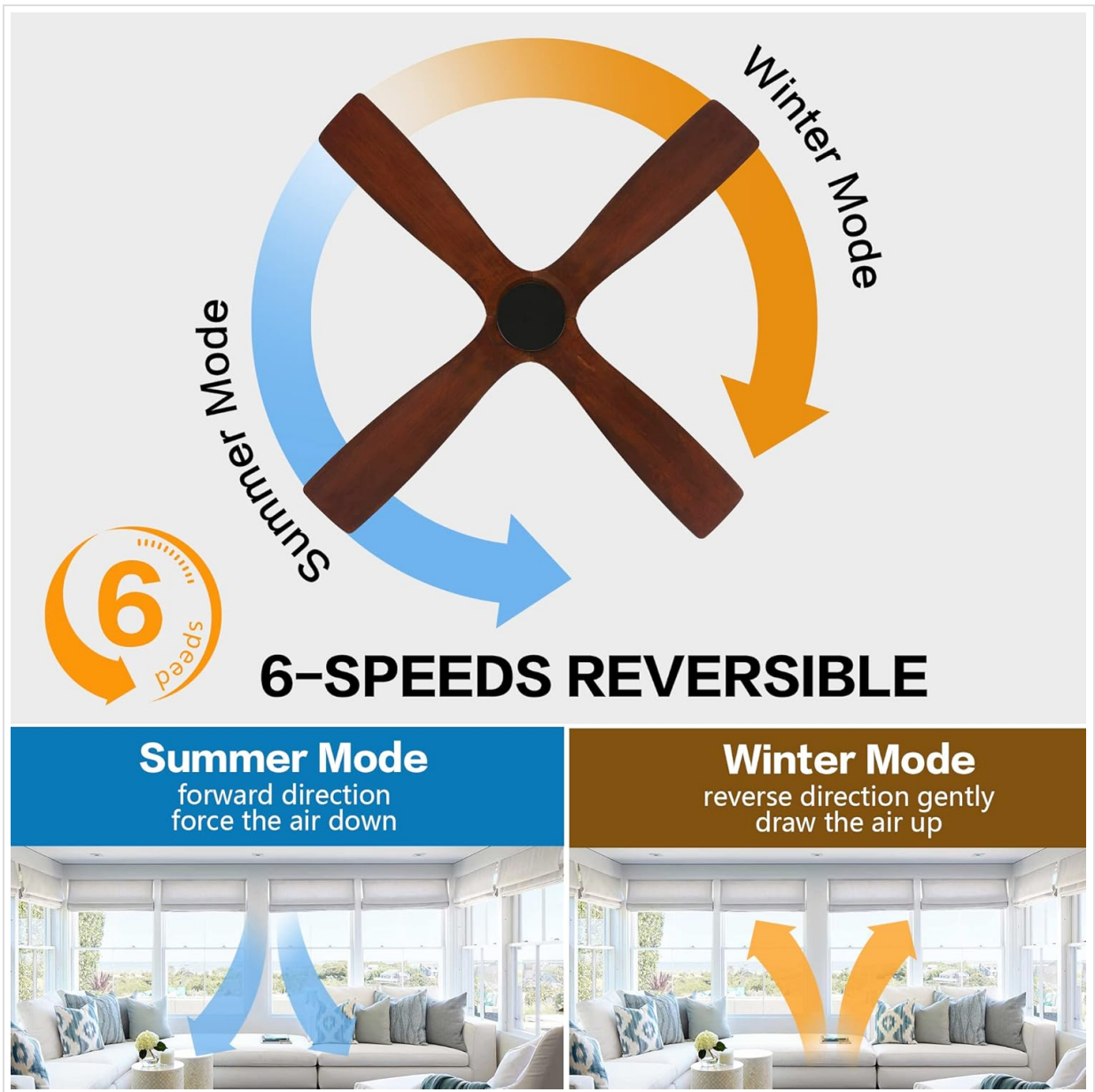
Image: A visual representation of the fan's reversible function, showing downward airflow for summer and upward airflow for winter.