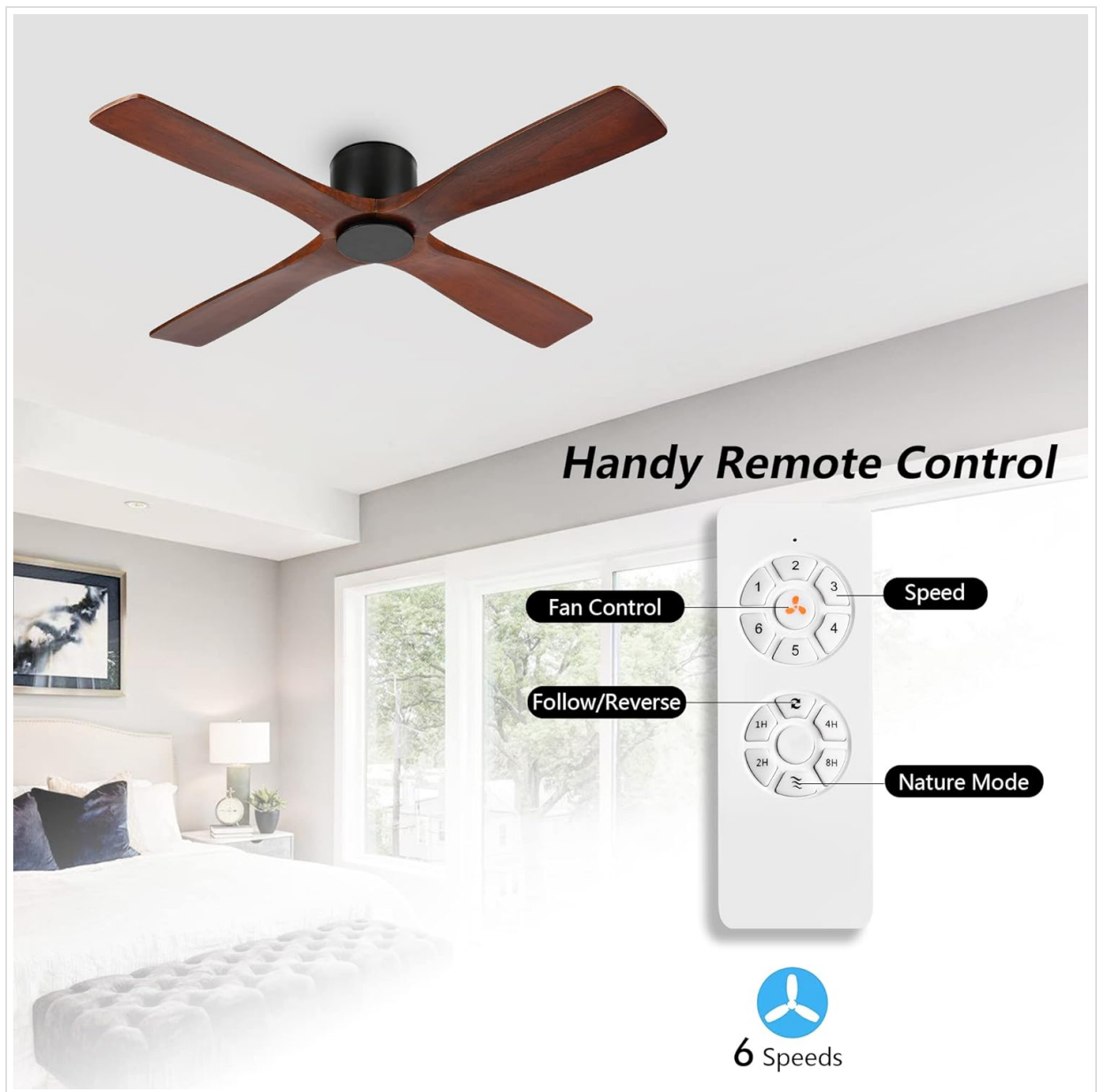
Image: A diagram showing the remote control with labels for Fan Control (6 speeds), Follow/Reverse, and Nature Mode buttons.