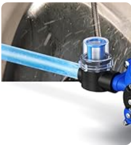
Image: A clear hose showing water flowing, indicating the flushing process.