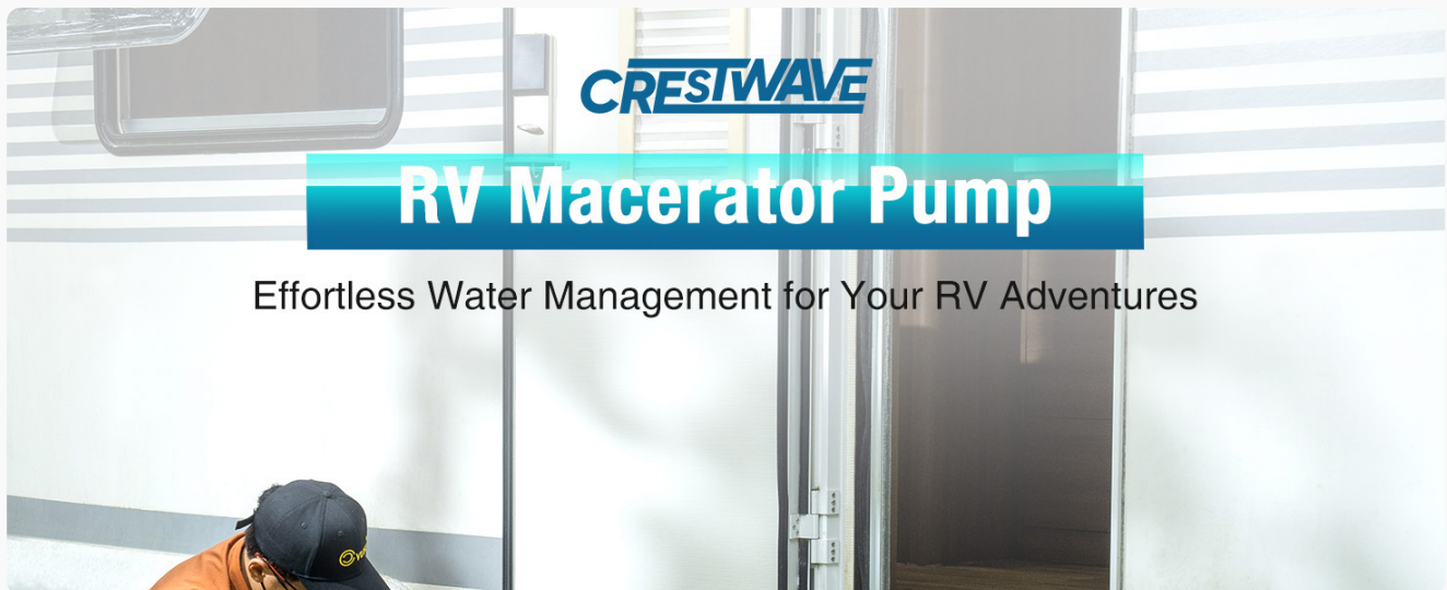
Image: CrestWave RV Macerator Pump banner, illustrating the product and brand.