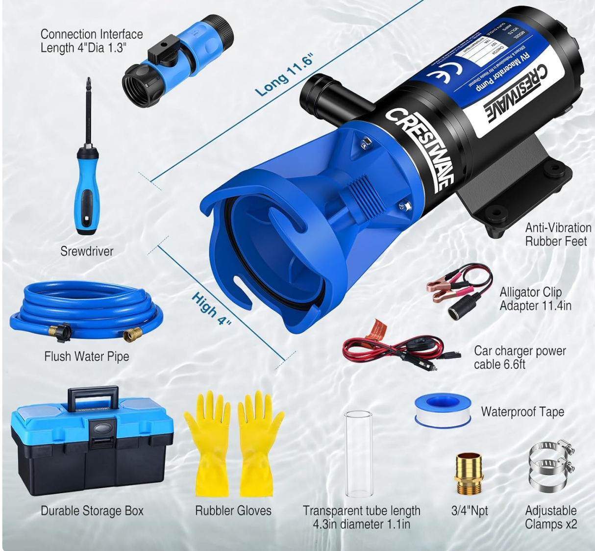
Image: Diagram showing the dimensions of the macerator pump and its various components.