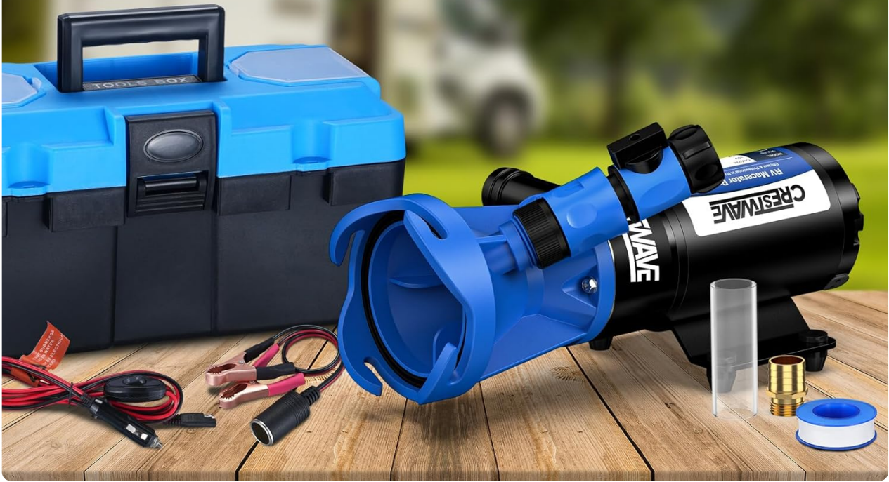
Image: Visual representation of the kit contents with labels.