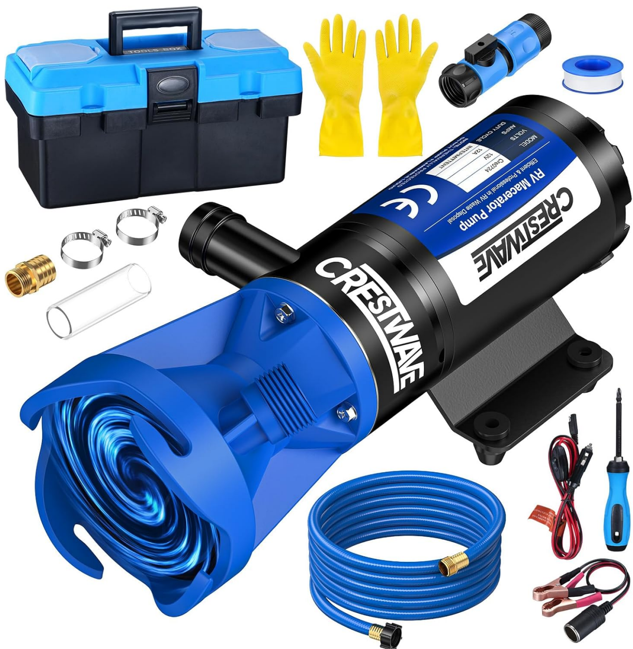
Image: Complete CrestWave RV Macerator Pump kit, showing all included components.

Verify that all items listed below are included in your package. If any items are missing or damaged, contact customer support.