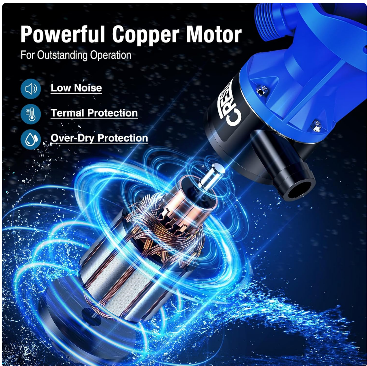
Image: Diagram illustrating the powerful copper motor with features like low noise, thermal protection, and over-dry protection.