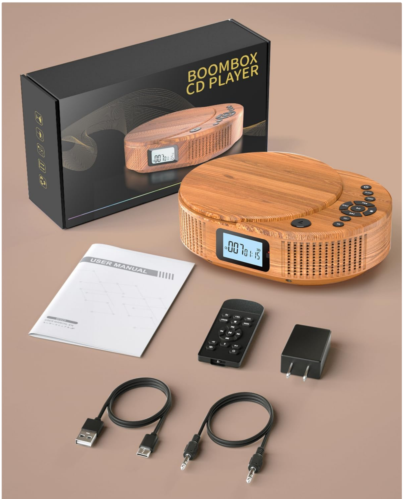
Image: The FELEMAN Portable CD Player, its retail box, remote control, AC adapter, USB-C charging cable, and the user manual, laid out on a surface.