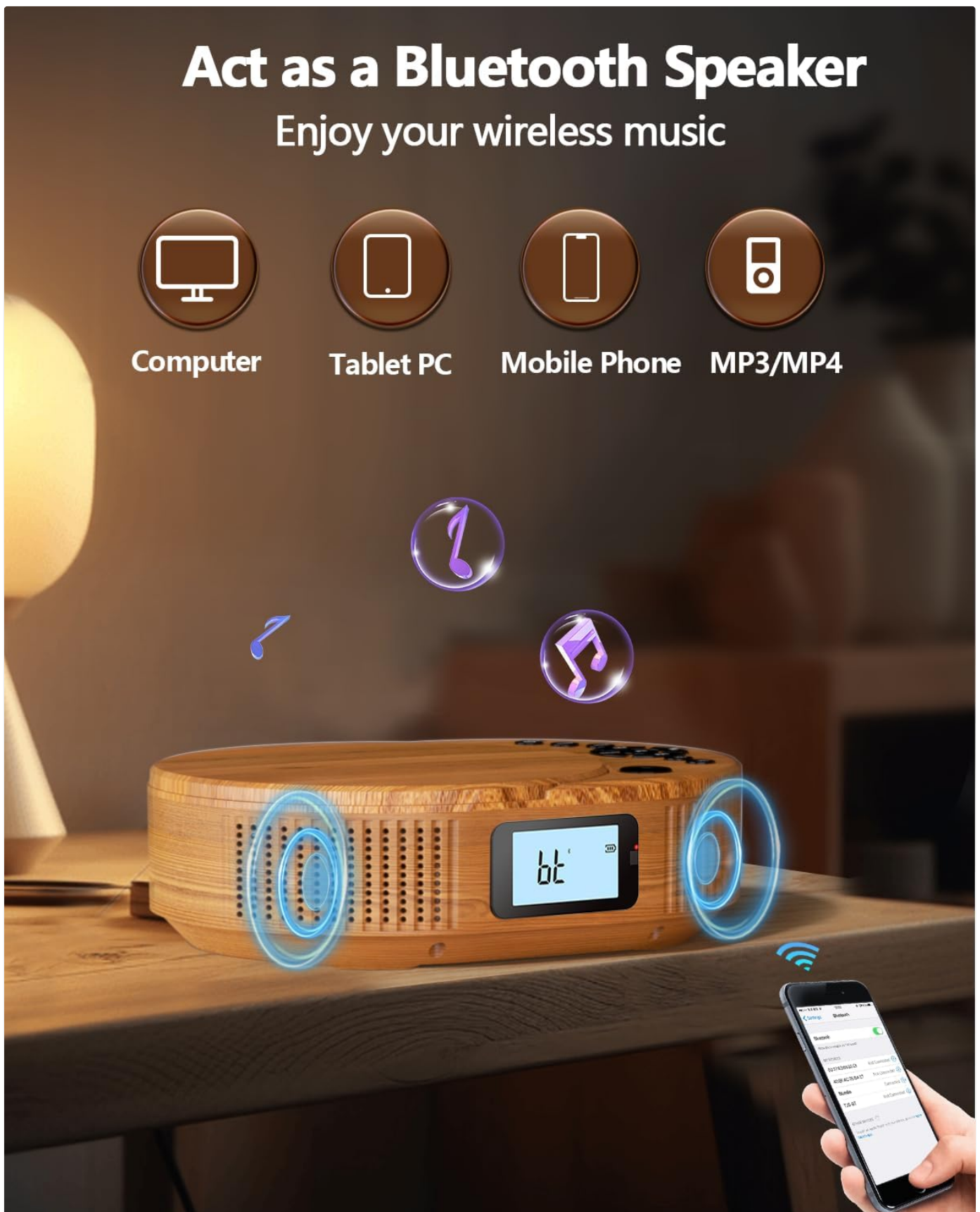
Image: The FELEMAN Portable CD Player displaying "bt" for Bluetooth mode, with a smartphone in the foreground indicating a wireless connection, highlighting its function as a Bluetooth speaker.