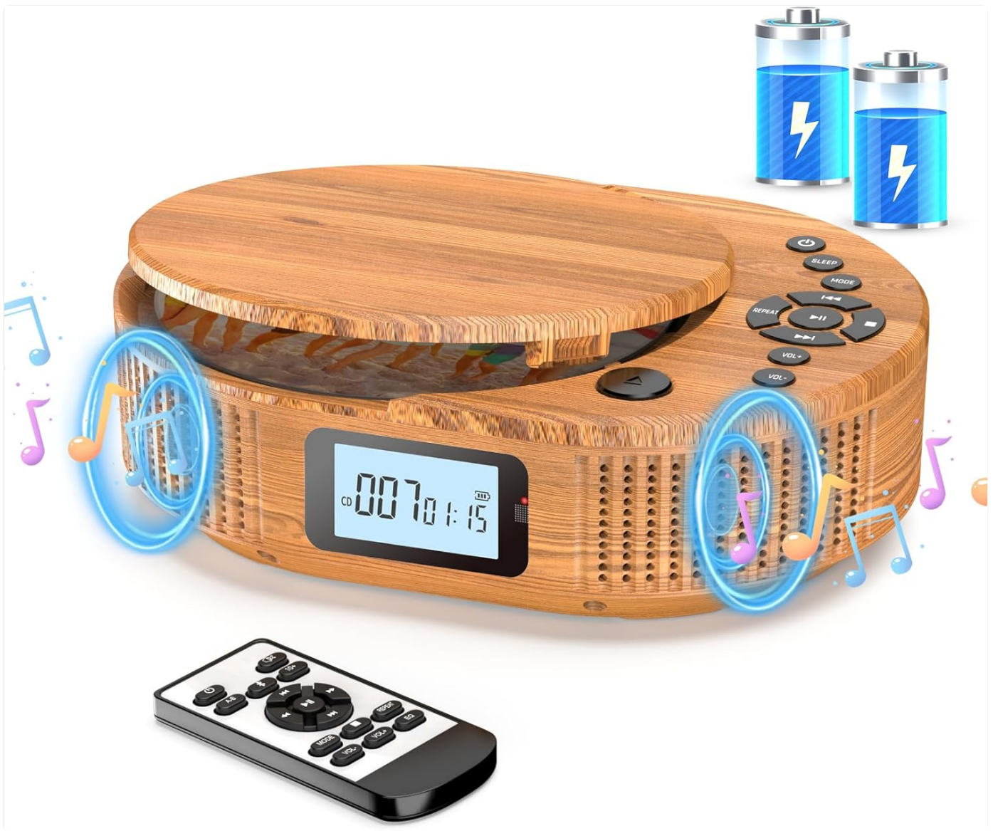
Image: The FELEMAN Portable CD Player and Bluetooth Speaker, showcasing its wooden finish, integrated speakers, digital display, and included remote control. Two battery icons indicate its rechargeable nature.