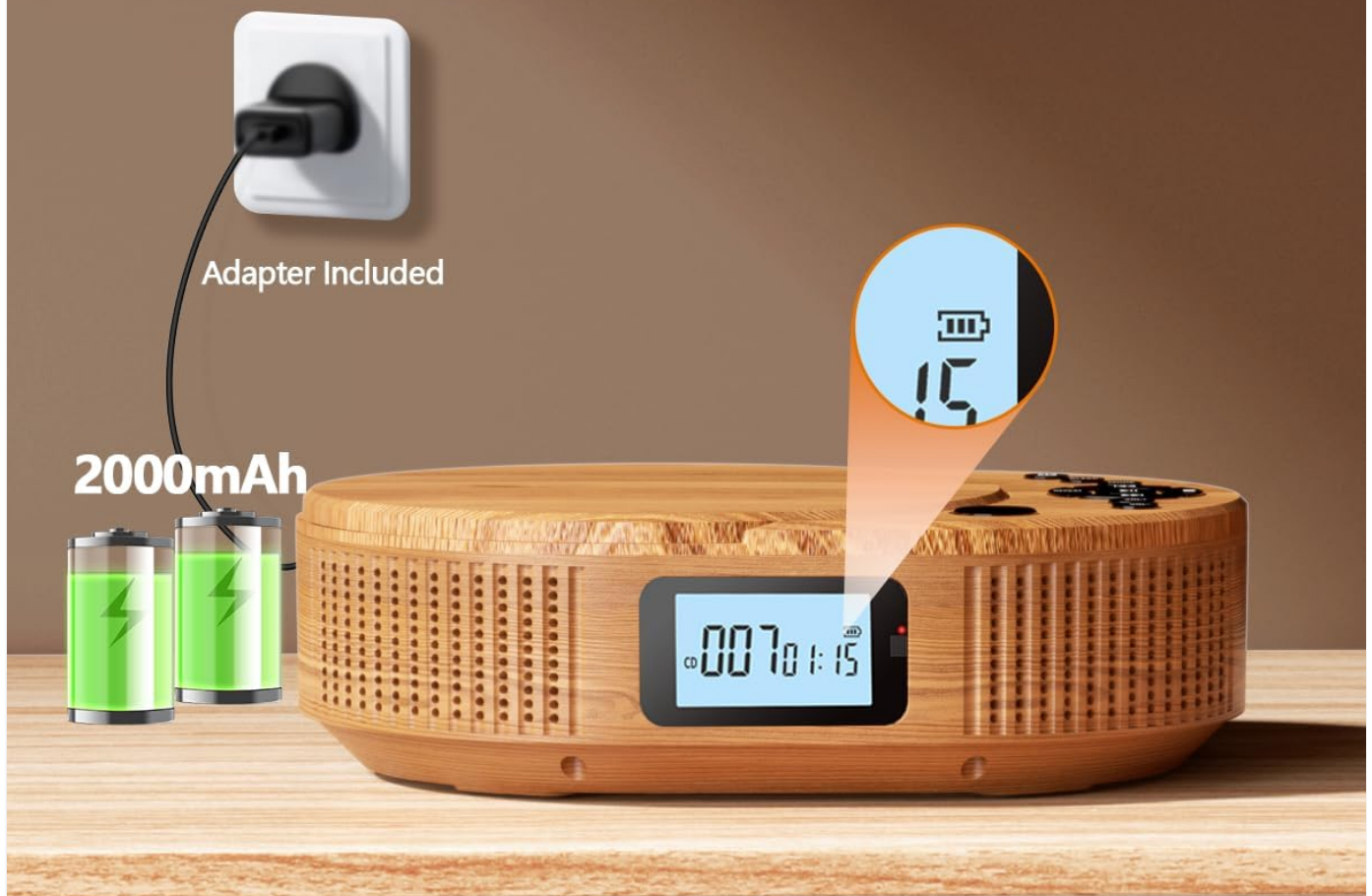
Image: The FELEMAN Portable CD Player connected to a wall charger via its USB-C cable, illustrating the charging process and the battery level indicator on its display.