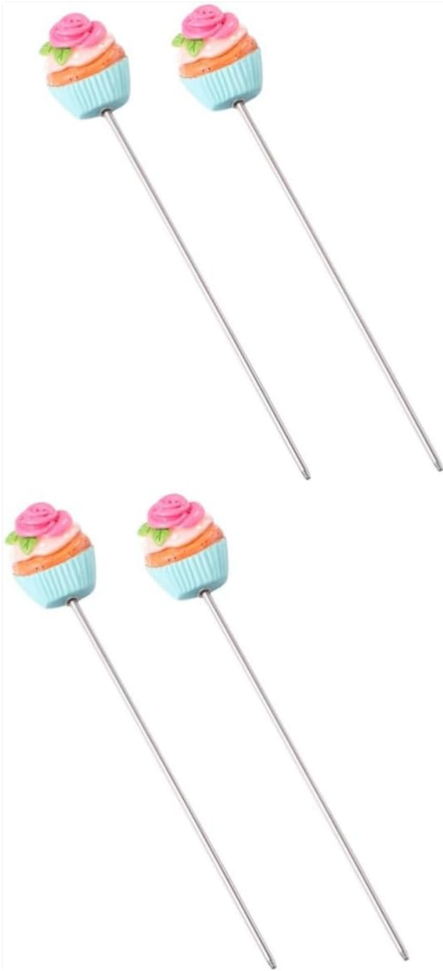
Figure 1.1: Zerodeko Stainless Steel Cake Tester Needles (Set of 4)

This image displays the complete set of four cake tester needles. Each needle features a stainless steel shaft and a charming cupcake-shaped handle with a rose design, making them both functional and aesthetically pleasing for any kitchen.