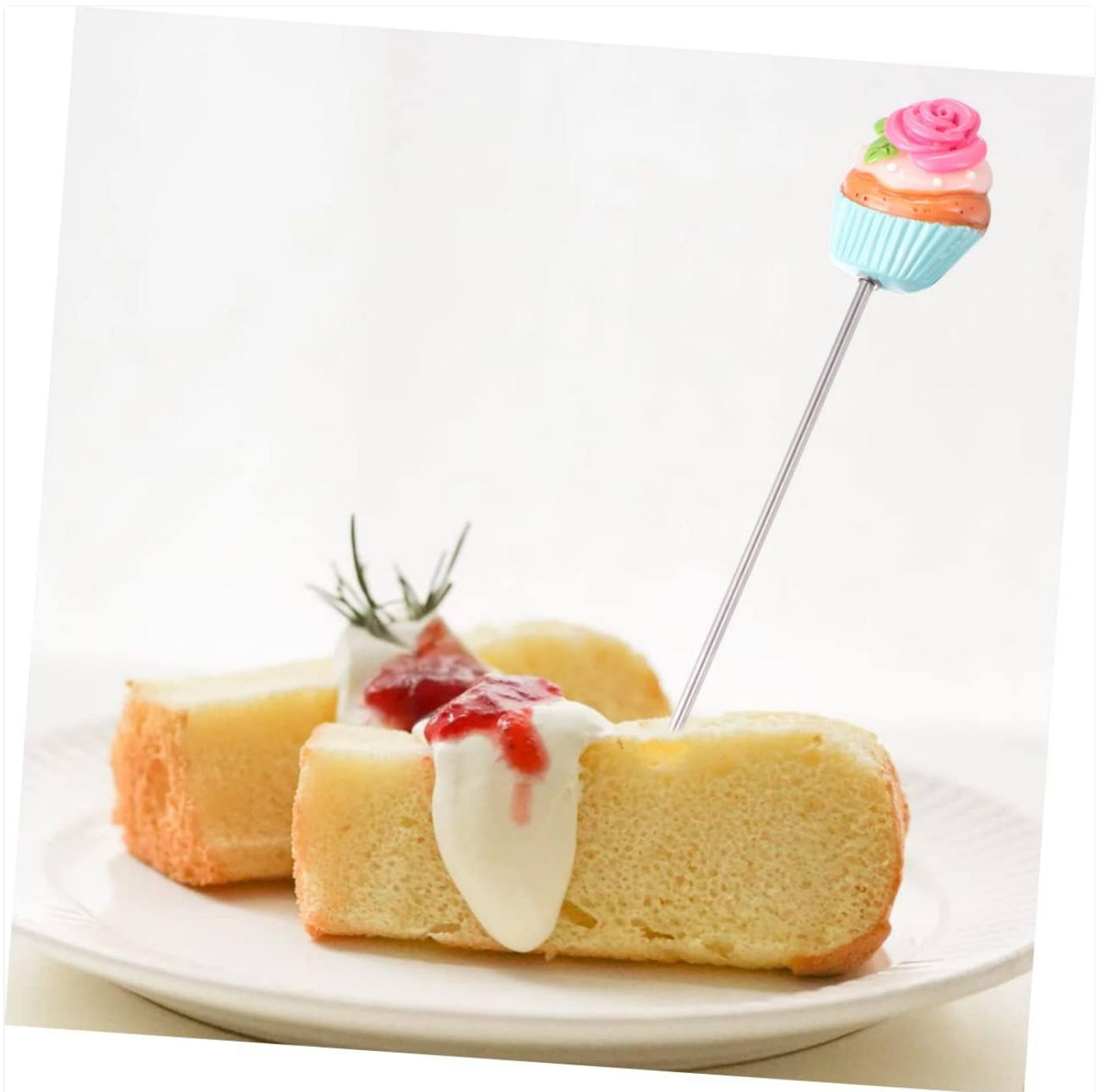
Figure 4.1: Testing a Cake for Doneness

This image demonstrates the practical application of the cake tester needle, showing it inserted into a piece of cake to check if it is fully baked.