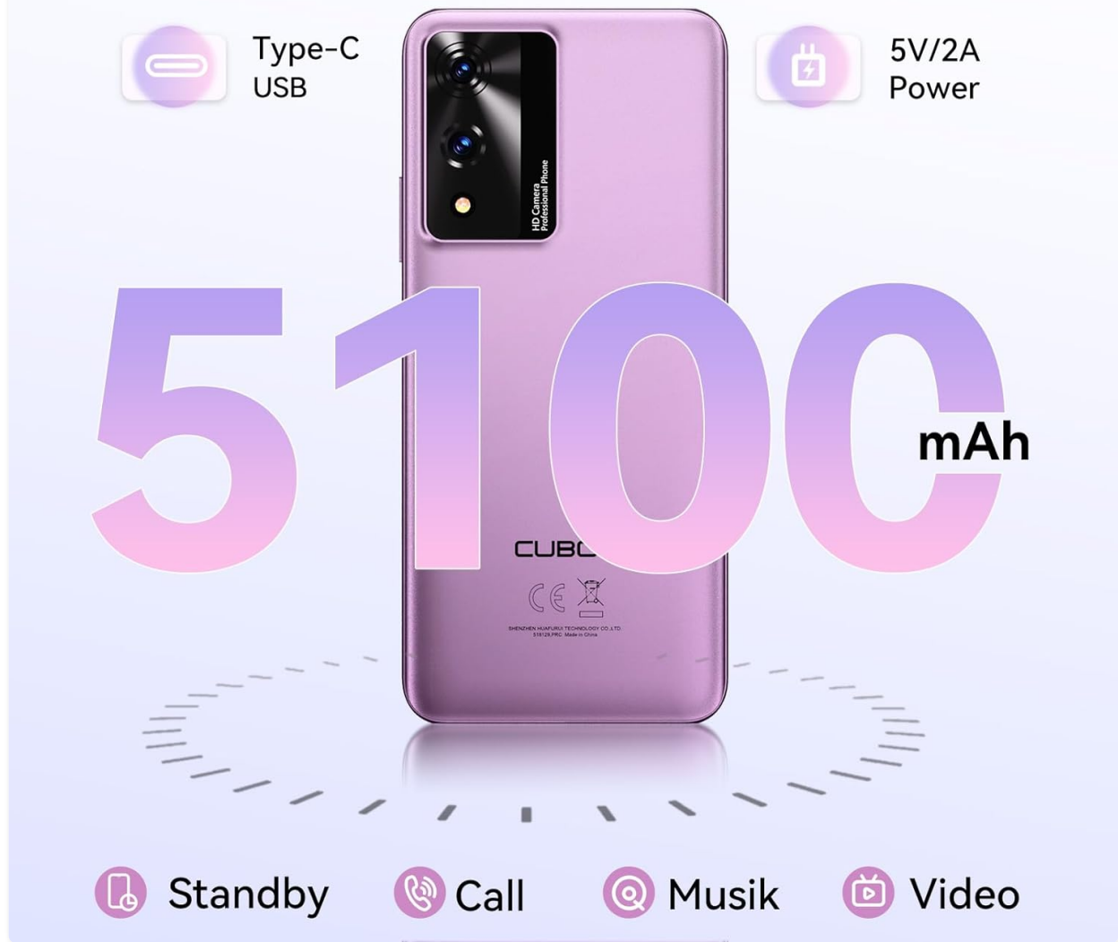
Figure 3.2: Charging the CUBOT A10.