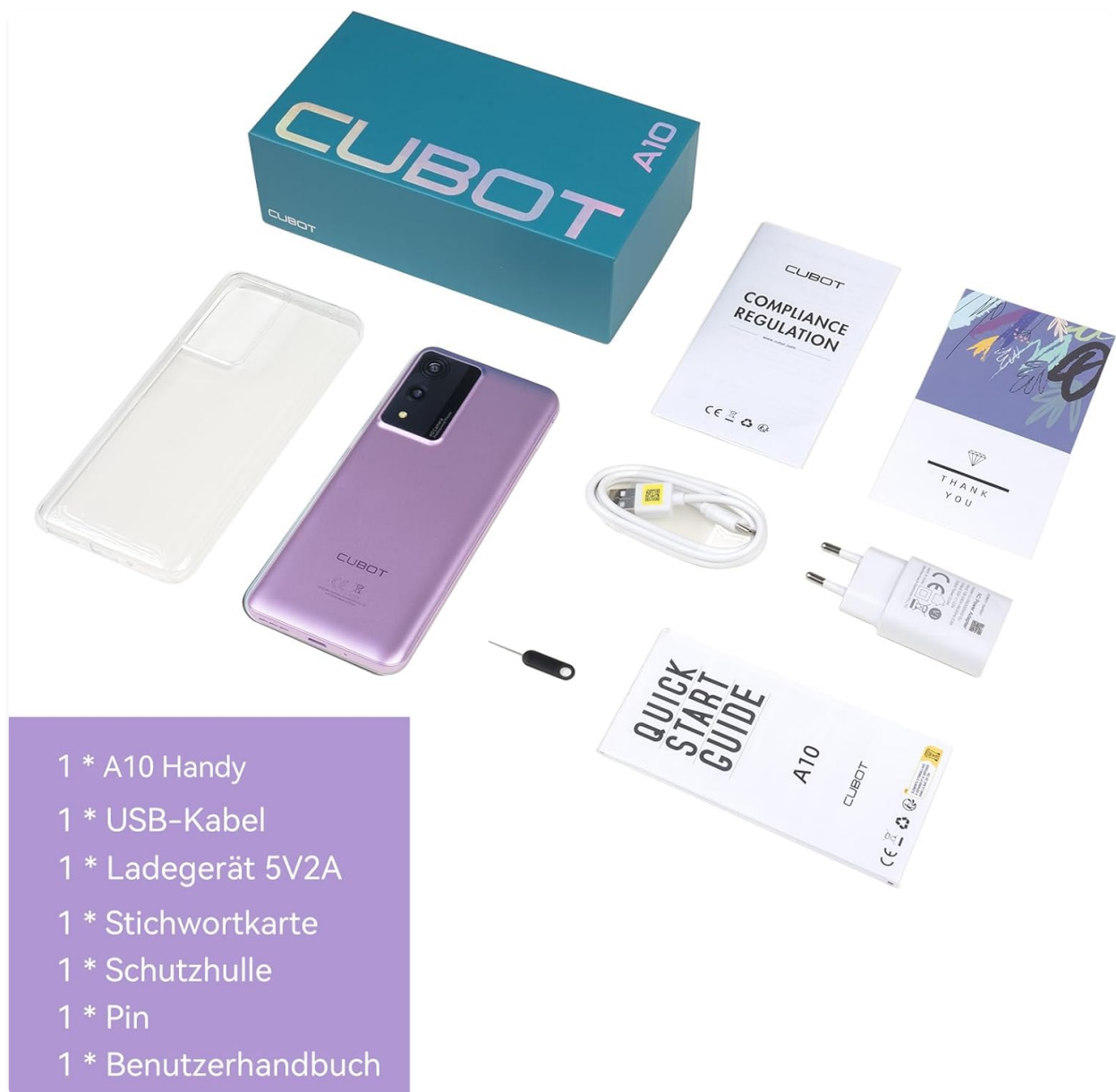
Figure 2.1: Package Contents of the CUBOT A10 Smartphone.