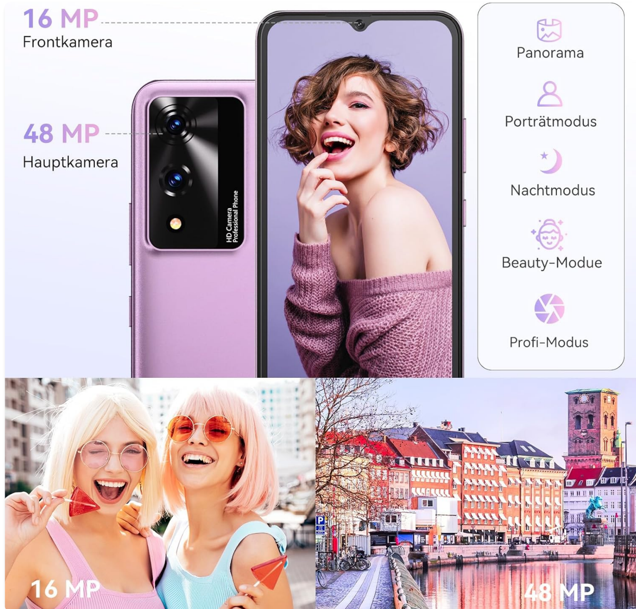
Figure 4.3: CUBOT A10 Camera Features.