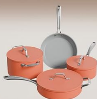
Ciarra Ceramic Cookware Set