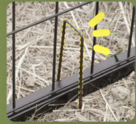
#Secure U-Shape Nails