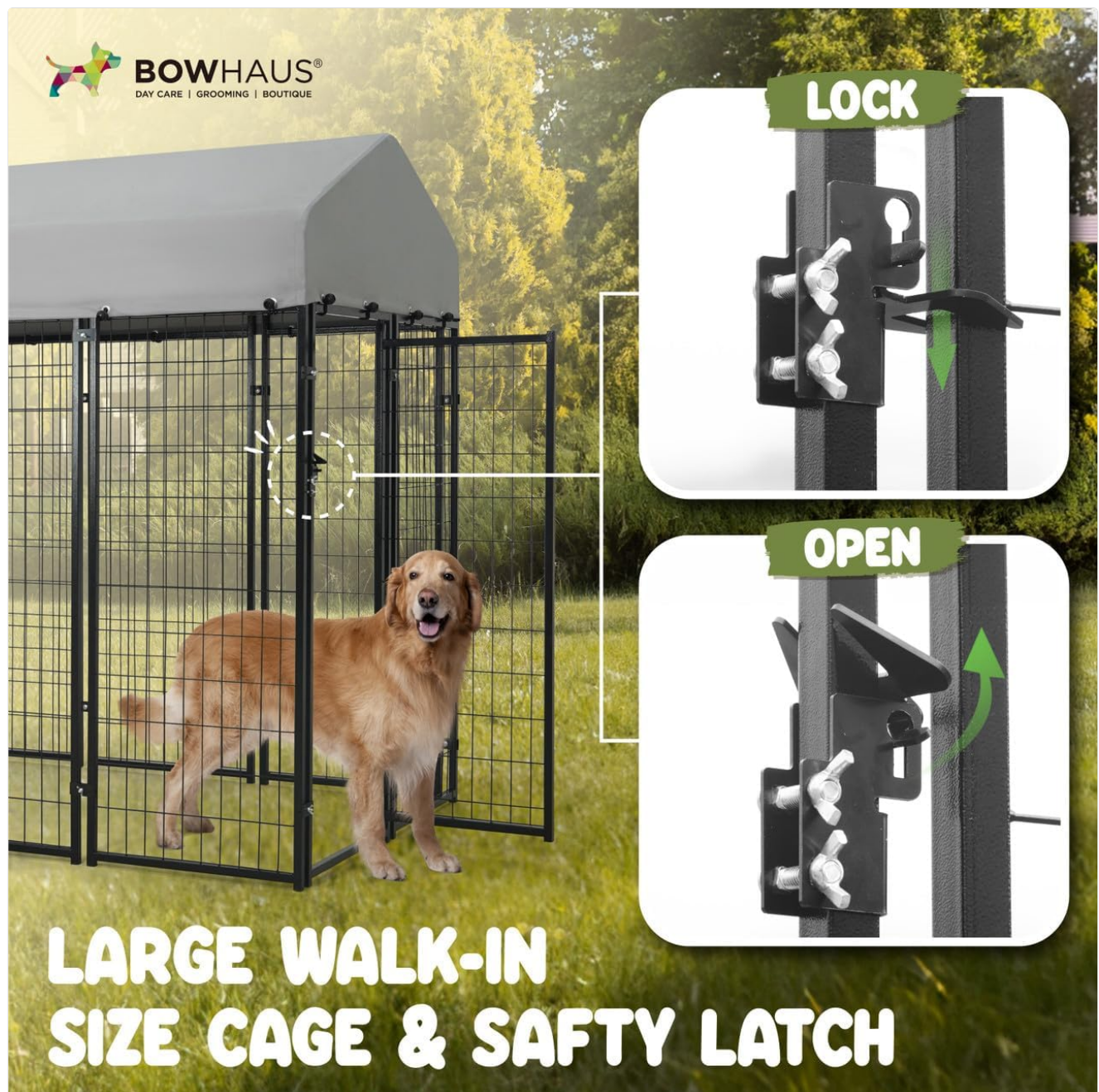
Image 4: The kennel panels can be configured into various shapes, such as a fence or a cage.

The modular design allows for various configurations. Panels can be rearranged to create different shapes or sizes to suit your pet's needs or available space.