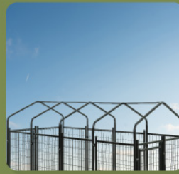
#Durable 5 Top Support Pipe