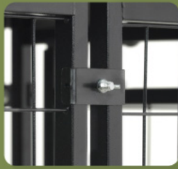
#Strong 20MM Heavy Duty Steel