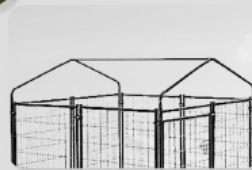
2 Top Support Pipe