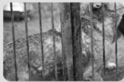
15MM Metal Tube