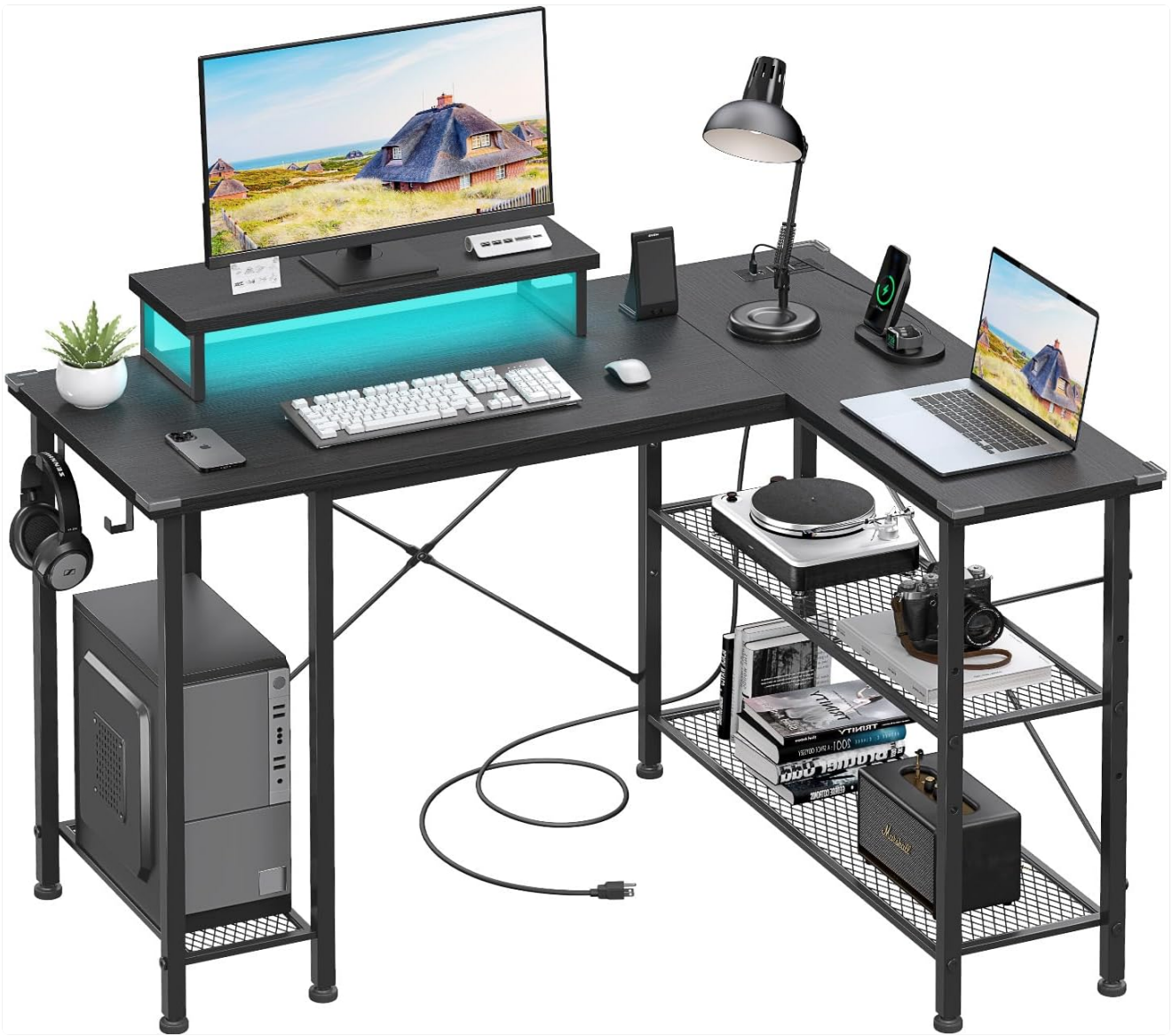
Figure 1.1: GIKPAL L-Shaped Computer Desk. This image shows the desk fully assembled with a computer, monitor, laptop, and various office accessories, highlighting its spacious and organized design.