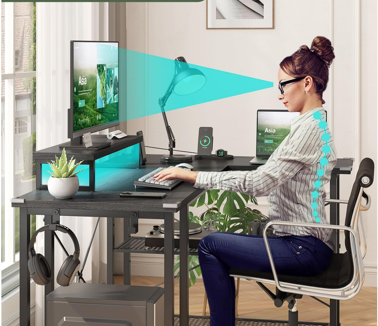
Figure 5.2: Movable Monitor Stand. This image demonstrates how the elevated monitor stand helps reduce neck strain by positioning the screen at an ergonomic height, improving posture.

Elevating the screen reduces neck stress Flexible movement while saving you more space