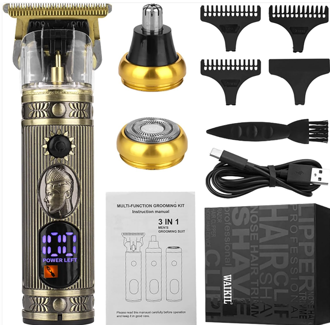
Image 2.1: The WAKIL 3-in-1 Grooming Kit, showcasing the hair trimmer, nose hair trimmer, beard trimmer, various limit combs, cleaning brush, USB cable, and protective cover.