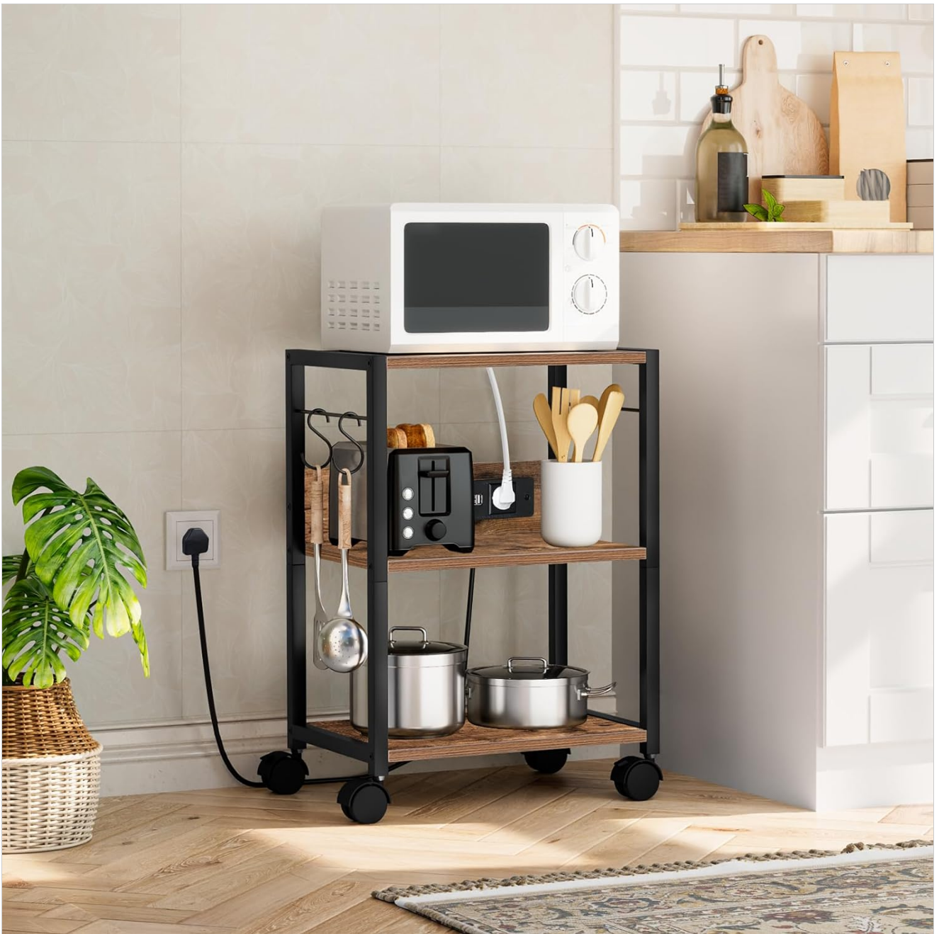
Figure 3: Illustration of the lockable wheels for securing the cart in place.