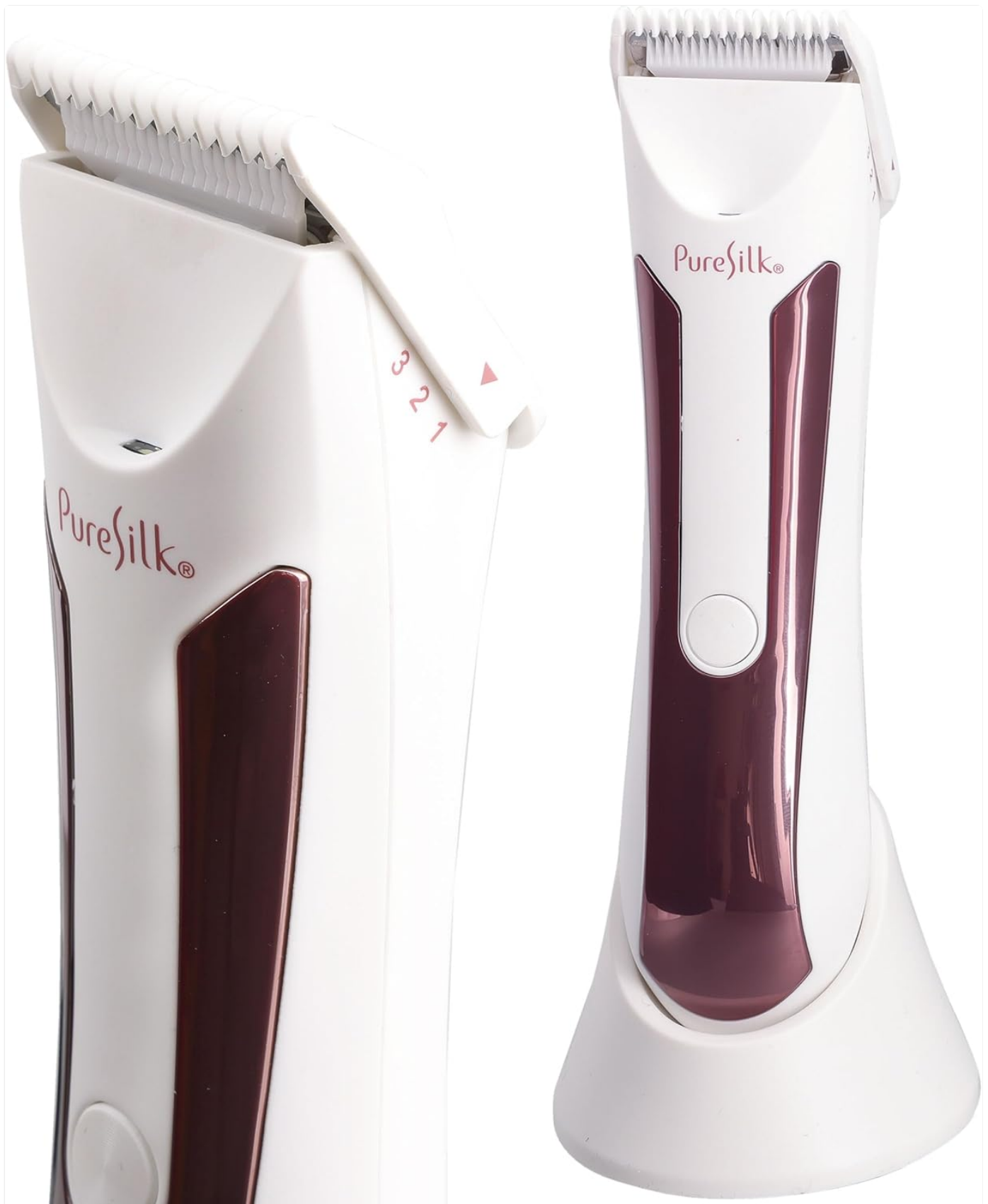
Image: A detailed view of the trimmer head, showing the guide comb mechanism and length settings (1, 2, 3).