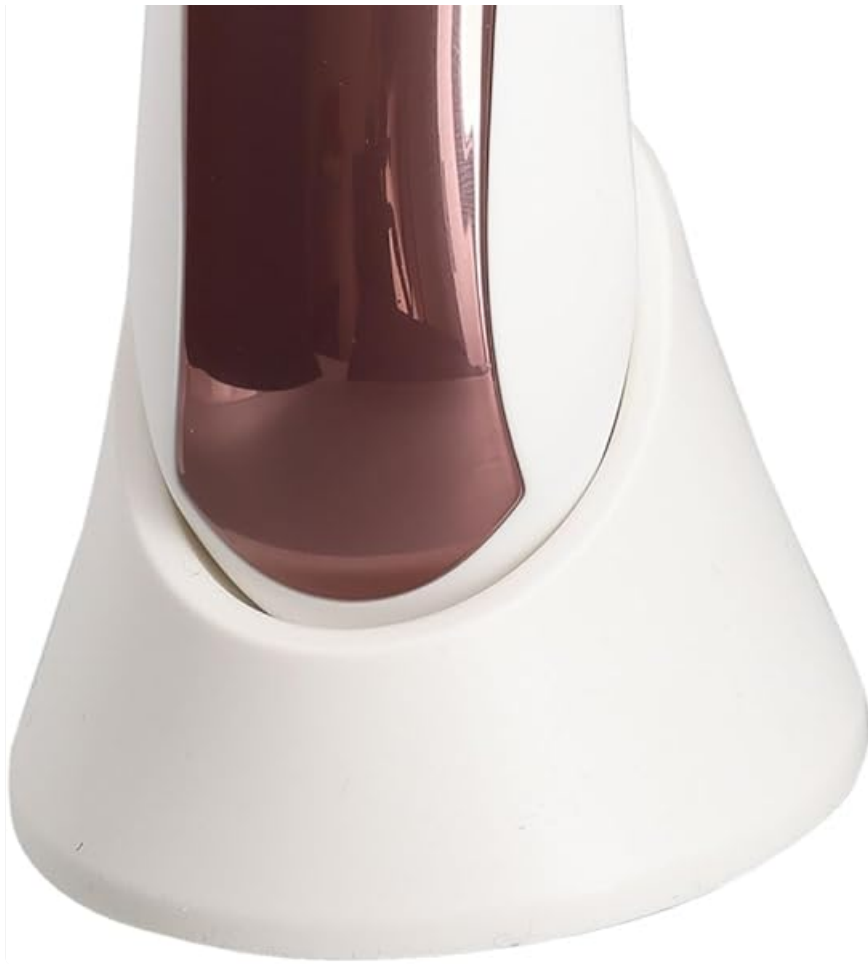
Image: The Pure Silk Body Hair Trimmer resting in its white charging stand.