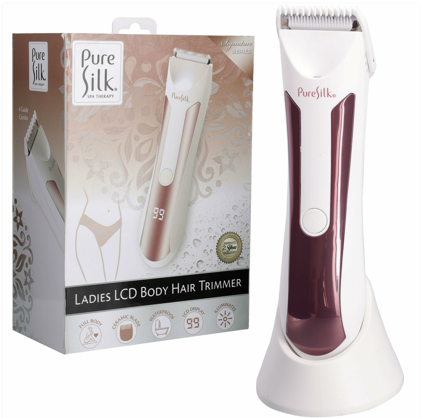
Image: The Pure Silk Body Hair Trimmer, its charging stand, and product packaging.