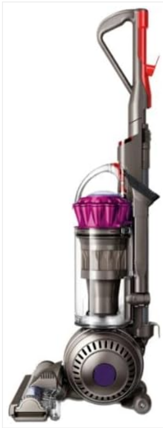
Image 1: Front view of the Dyson Ball UP13 Multi Floor Bagless Upright Vacuum, showcasing its distinctive ball design and clear dust bin.