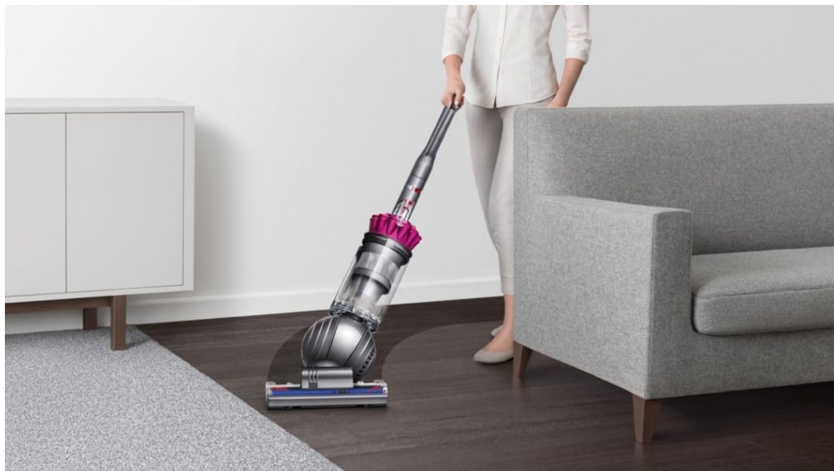
Image 2: The Dyson Ball UP13 vacuum being operated on a hard floor, demonstrating its maneuverability.