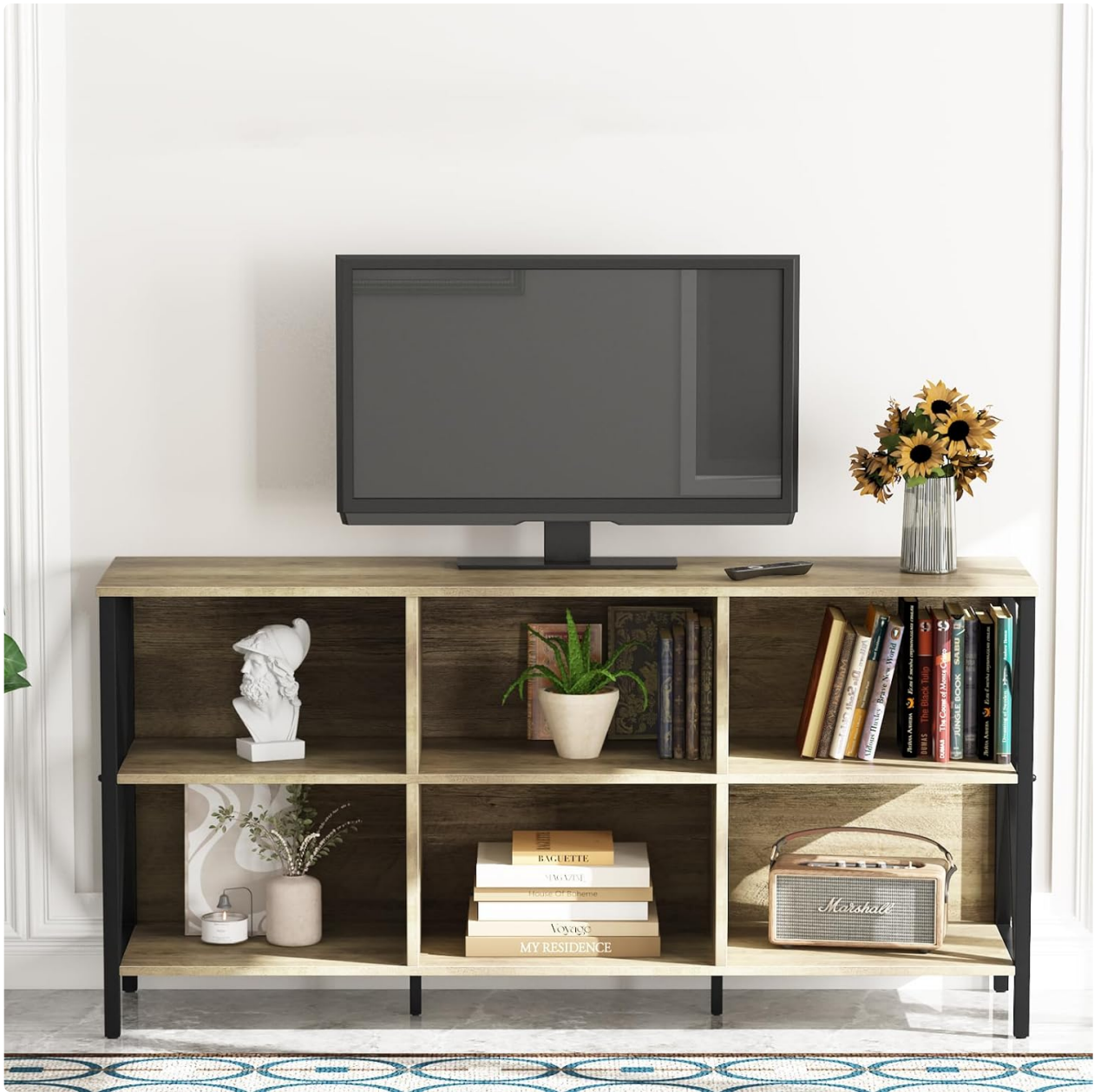
Image 5.1: The bookshelf configured as a television stand, demonstrating its adaptability for media storage and display.