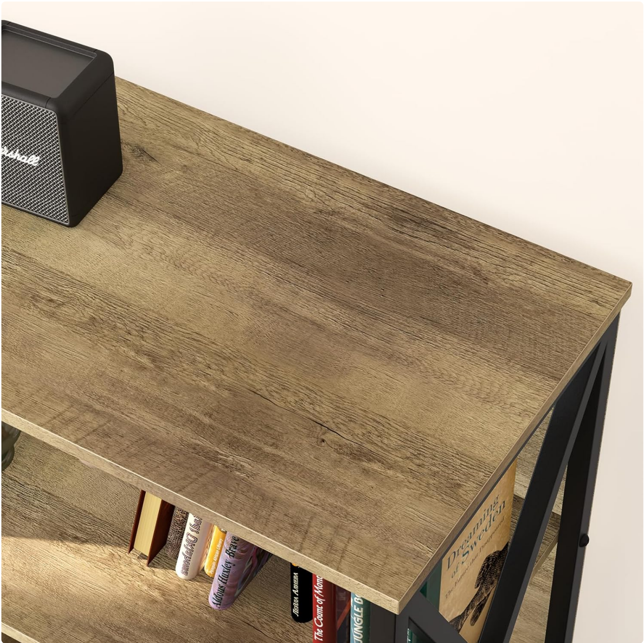
Image 6.1: A detailed view of the rustic oak surface, illustrating the texture and finish that should be maintained with proper cleaning.