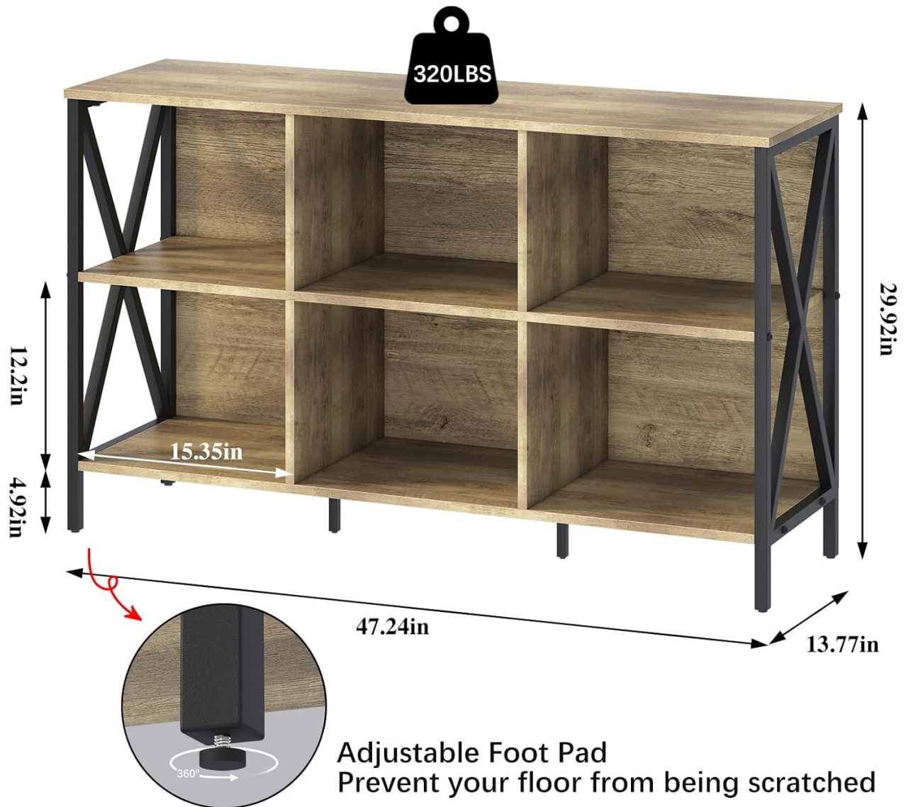
Image 4.1: Visual representation of the bookshelf's dimensions and the adjustable foot pad feature, designed to prevent floor scratches and ensure stability.

Large bearing weight capacity Each layer can support 80-120LBS