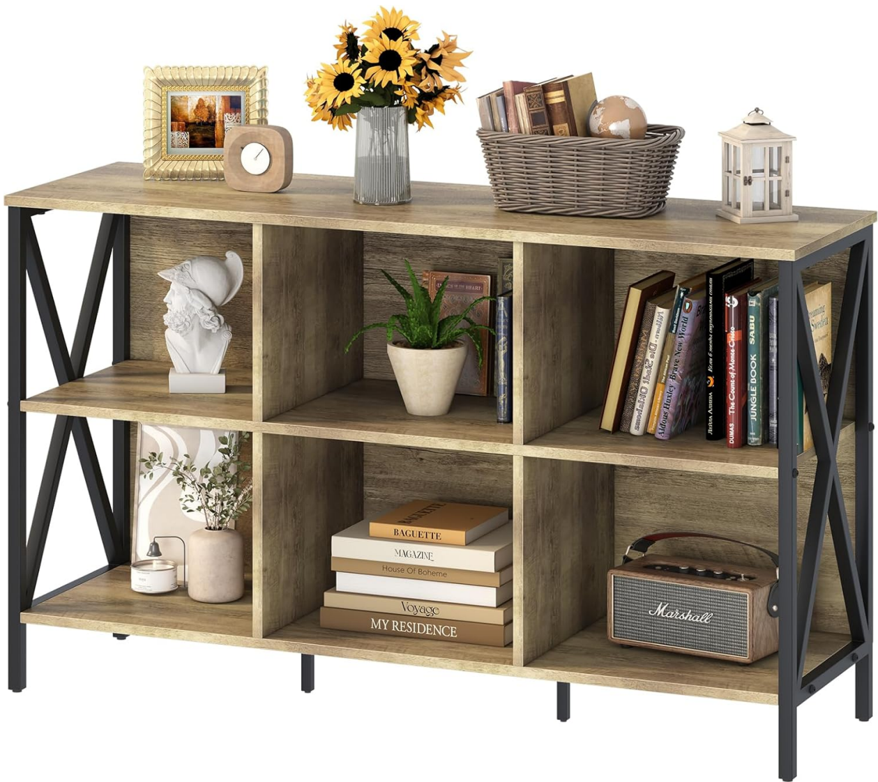
Image 1.1: The Adompacat 6-Cube Horizontal Bookshelf, showcasing its rustic oak finish and black metal frame, filled with books, plants, and decorative items.