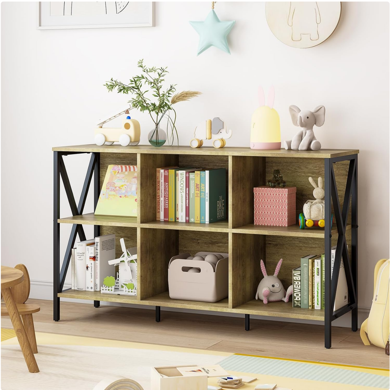
Image 5.2: The bookshelf placed in a child's room, illustrating its use for organizing children's books and toys, contributing to a tidy space.