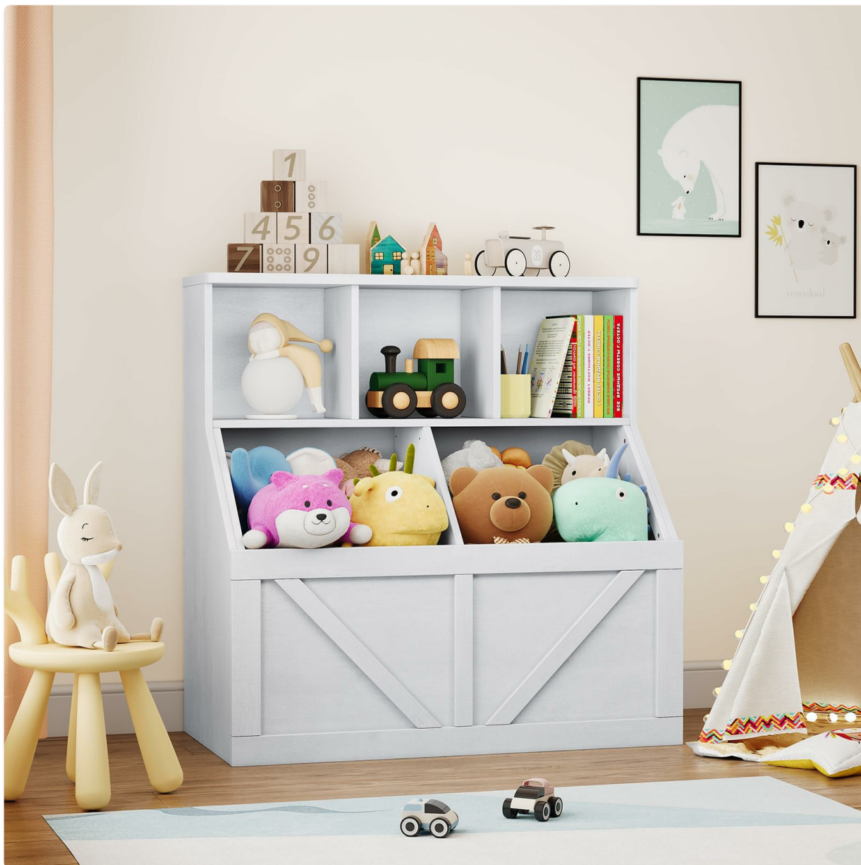
Figure 2: Product dimensions: 35.4 in (L) x 16.5 in (W) x 36.2 in (H).

Assembly is typically completed within 30-45 minutes with clear instructions.