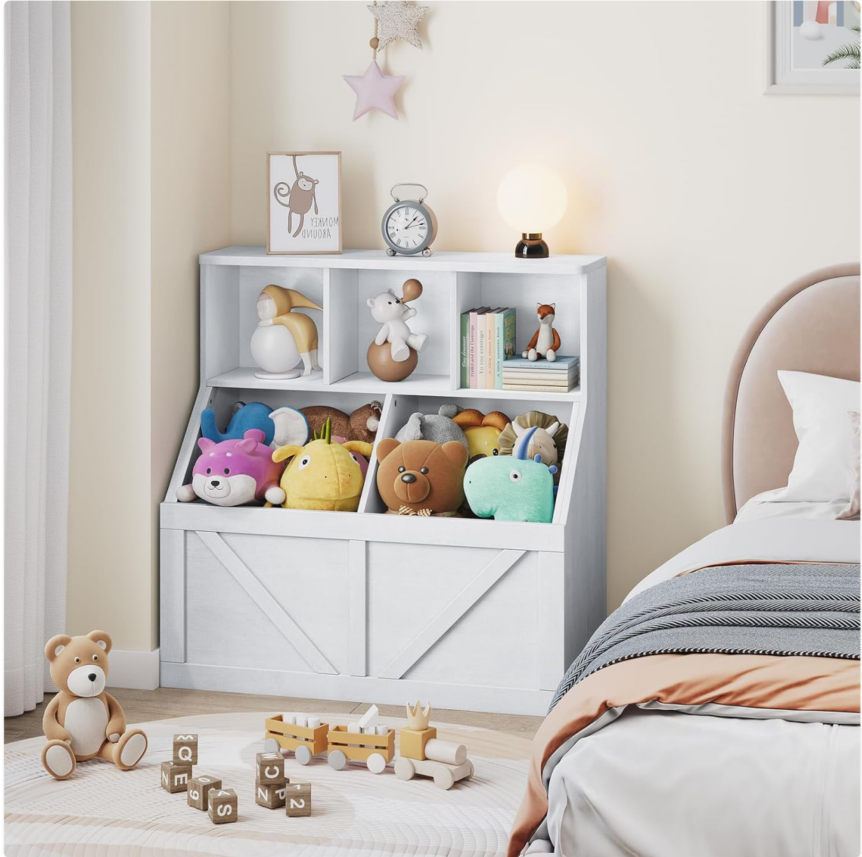
Figure 3: Organizer in a bedroom setting, showcasing its storage capabilities for books and toys.