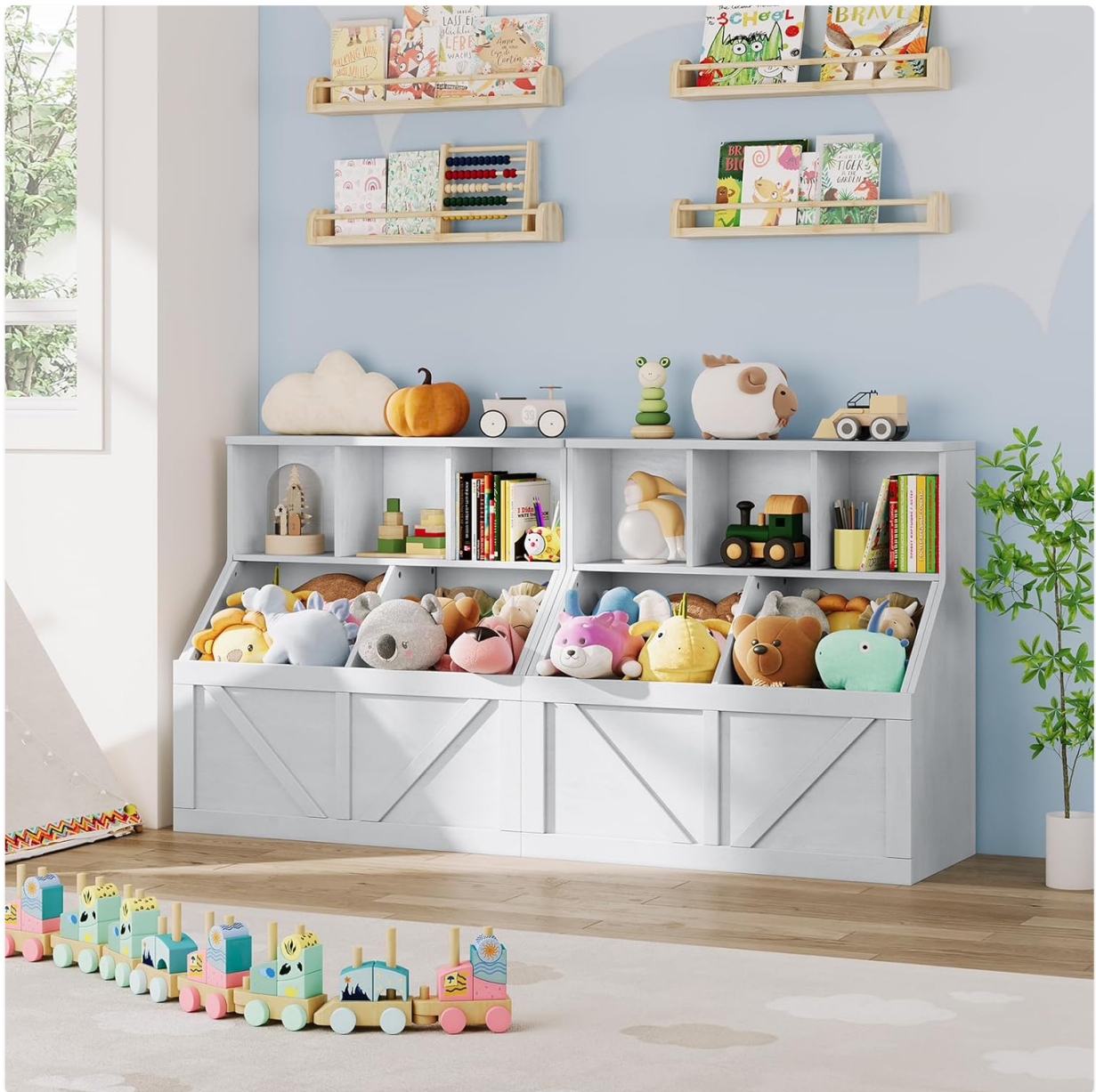
Figure 4: Multiple units can be used together to create an expansive storage solution in a playroom or nursery.