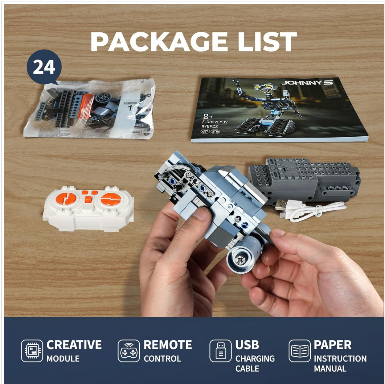
Figure 2.1: Package contents including building modules, remote control, USB charging cable, and the instruction manual.