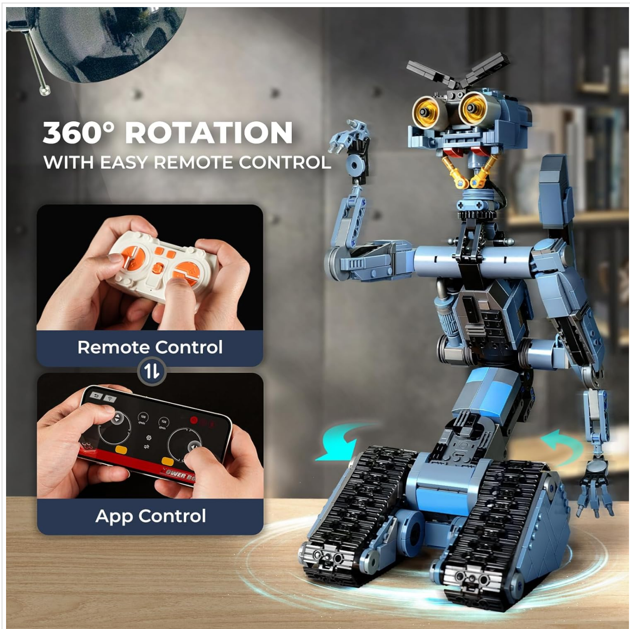
Figure 4.1: The robot can be controlled via a physical remote or a mobile application, allowing for 360-degree rotation and other movements.

download the dedicated application and follow the in-app instructions for pairing.