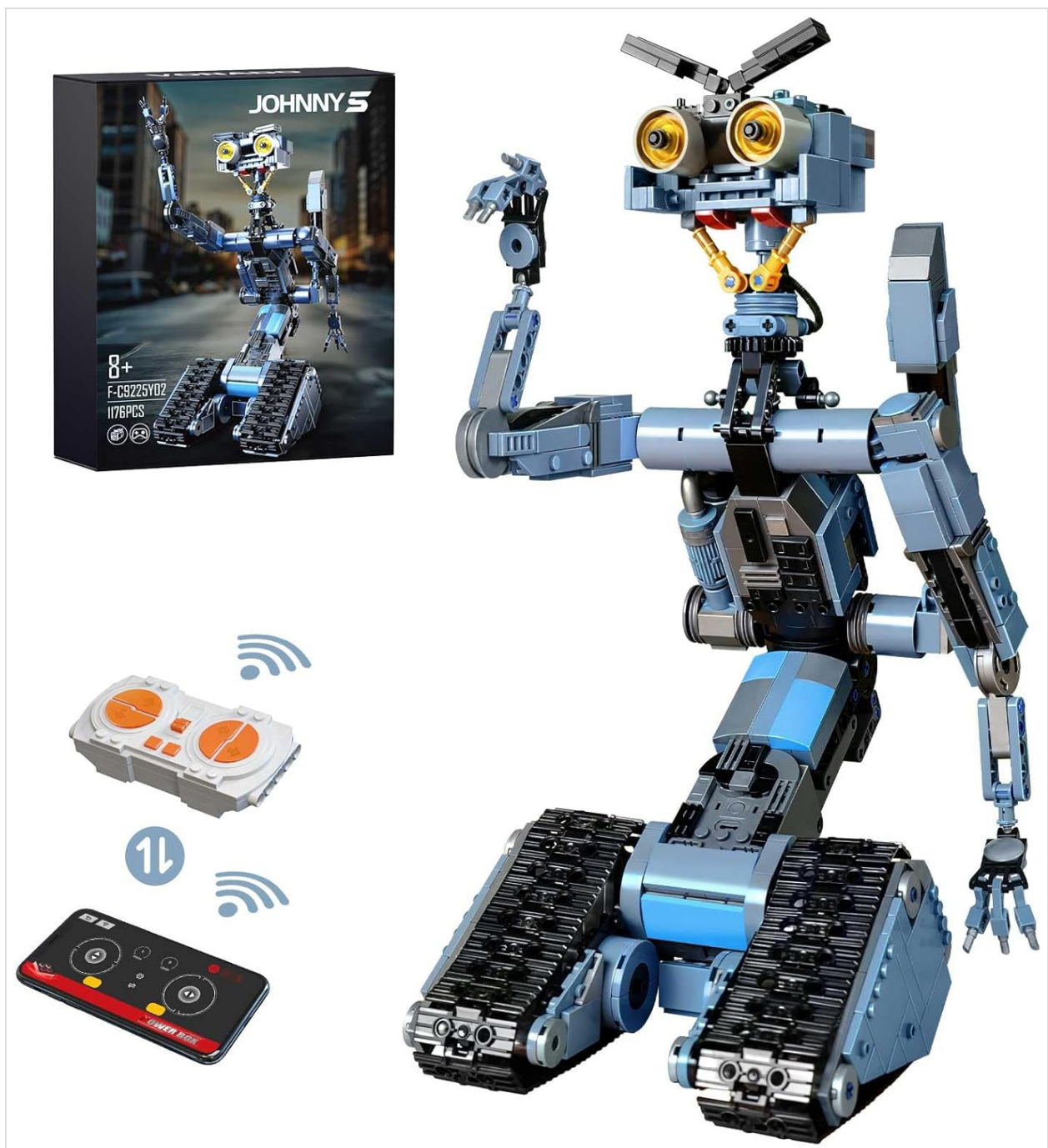
Figure 3.1: The iATOM Johnny 5 Robot Building Set, showing the assembled robot, remote controls, and product packaging.