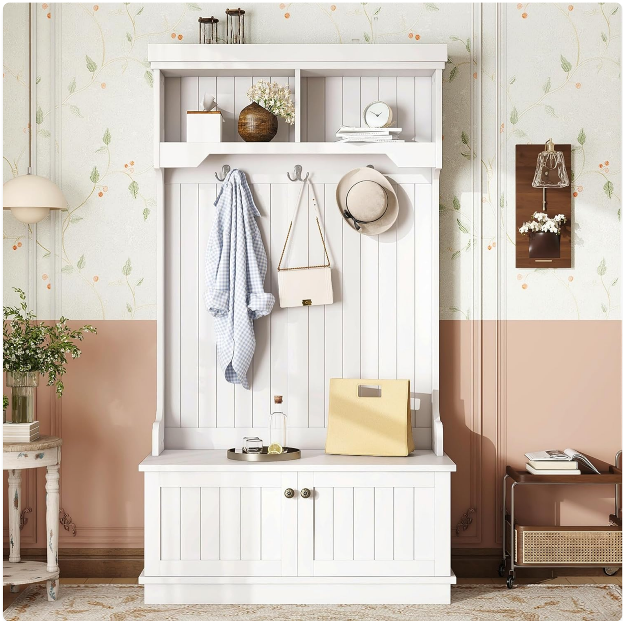
Image: The Bellemave 35.5-inch Hall Tree, showcasing its multi-functional design in an entryway setting.