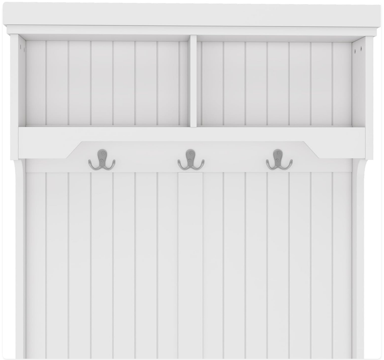
Image: Detail of the sturdy double hooks for hanging various items.