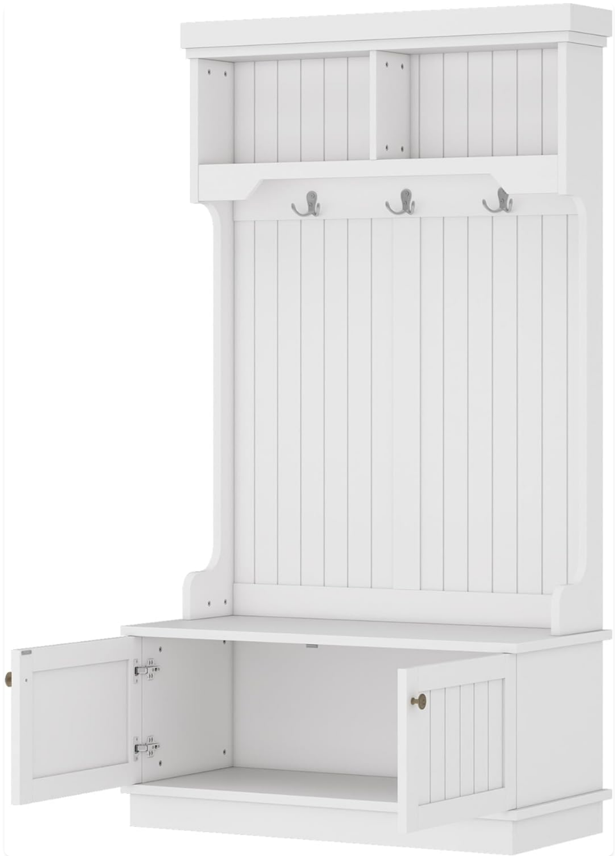
Image: The lower storage cabinets with doors open, showing the internal compartments.