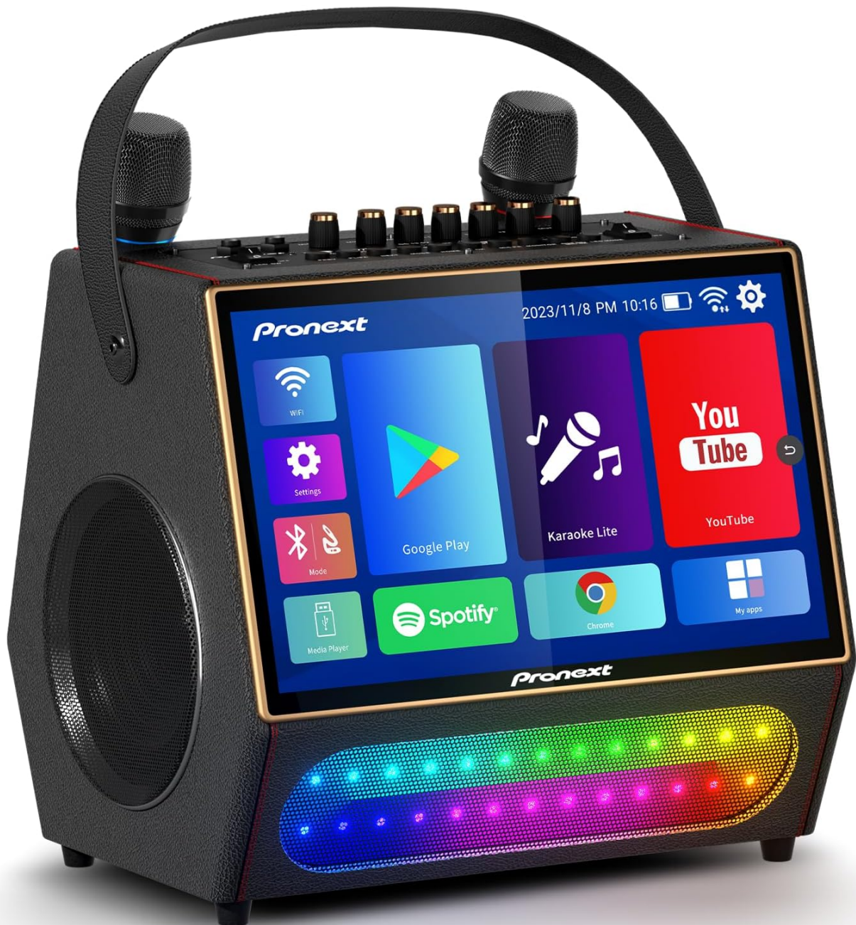
Figure 1.1: PRONEXT Karaoke Machine (Model P08) main unit.