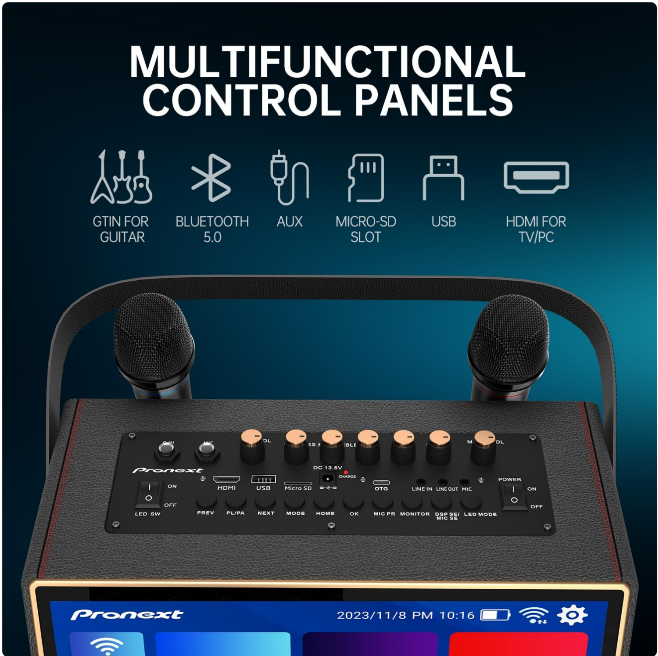
Figure 3.1: Overview of available input and output ports.