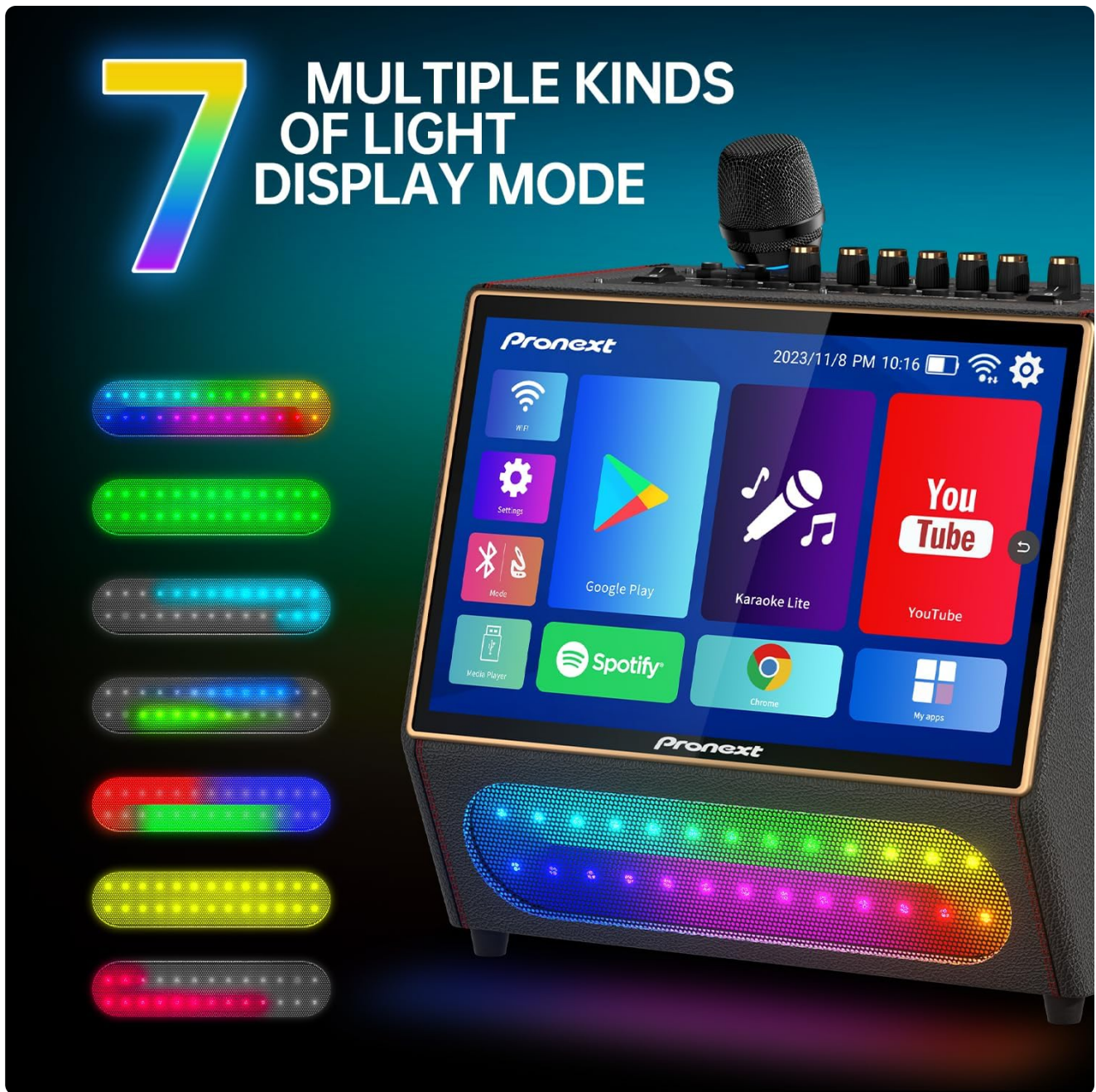
Figure 3.4: Seven different light display modes.