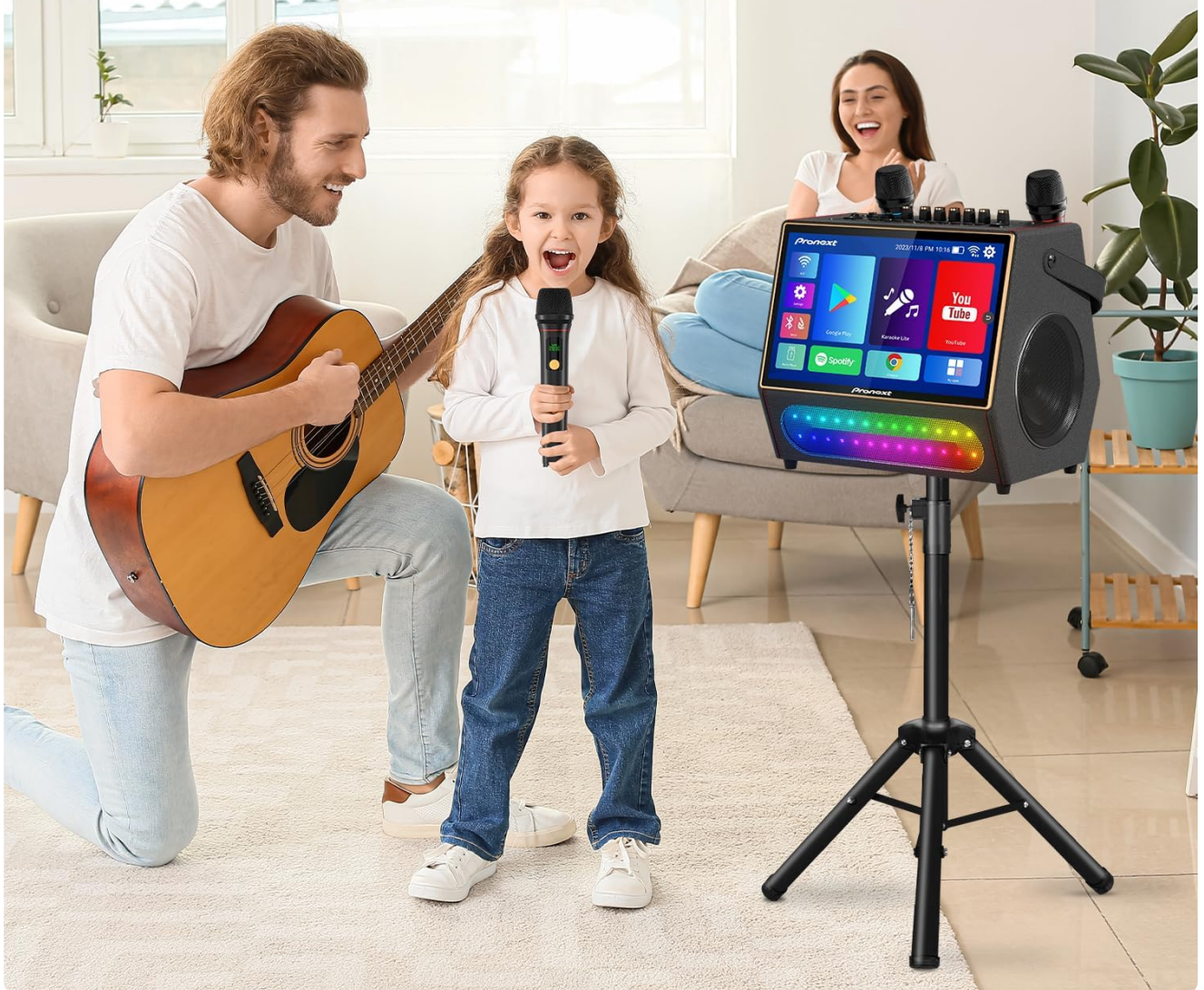
Figure 2.3: Karaoke machine on its stand, ready for use.