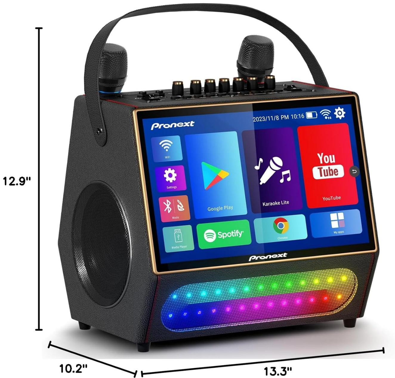
Figure 6.1: Product dimensions.