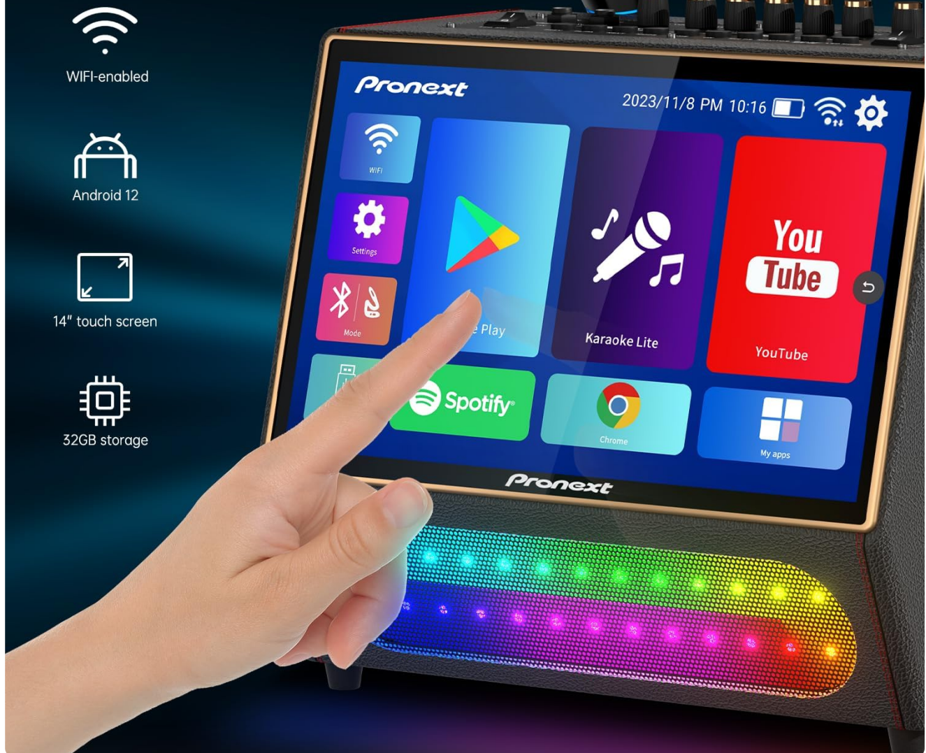
Figure 2.4: The P08 tablet interface, showing Wi-Fi and other features.