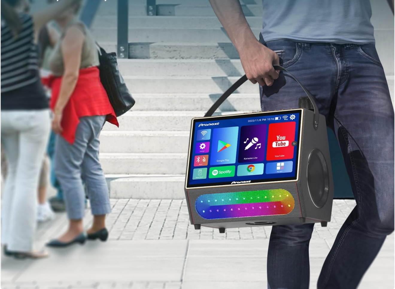
Figure 3.5: Portable design with carrying strap.

Easy to carry, a sturdy carrying handle that you can take it to any corner you want!