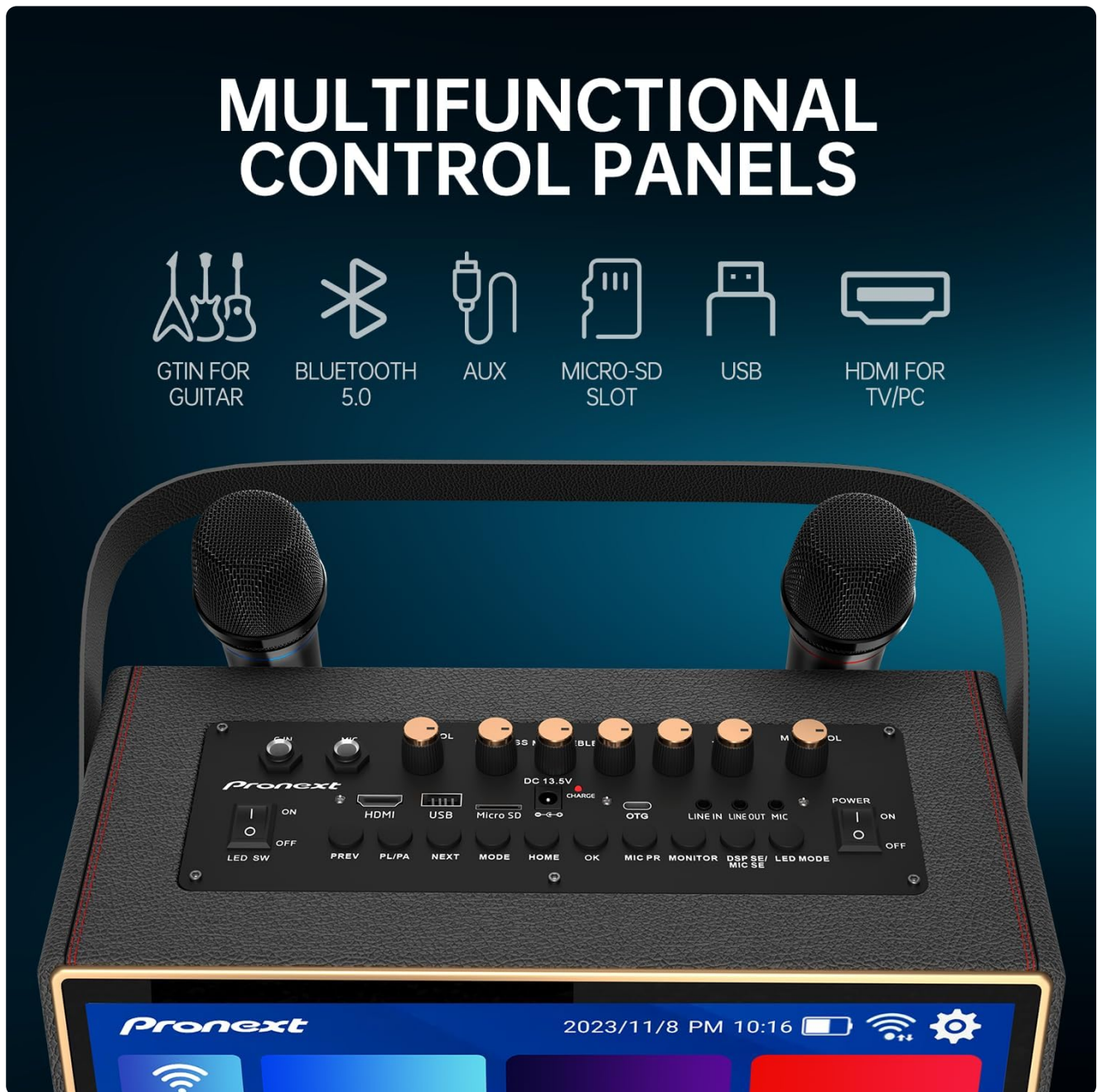
Figure 2.1: Multifunctional control panel with various input/output options.

Connect the power adapter to the DC 13.5V input port on the karaoke machine and plug it into a wall outlet. The internal 7200 mAh battery will begin charging. For first use, it is recommended to fully charge the unit.