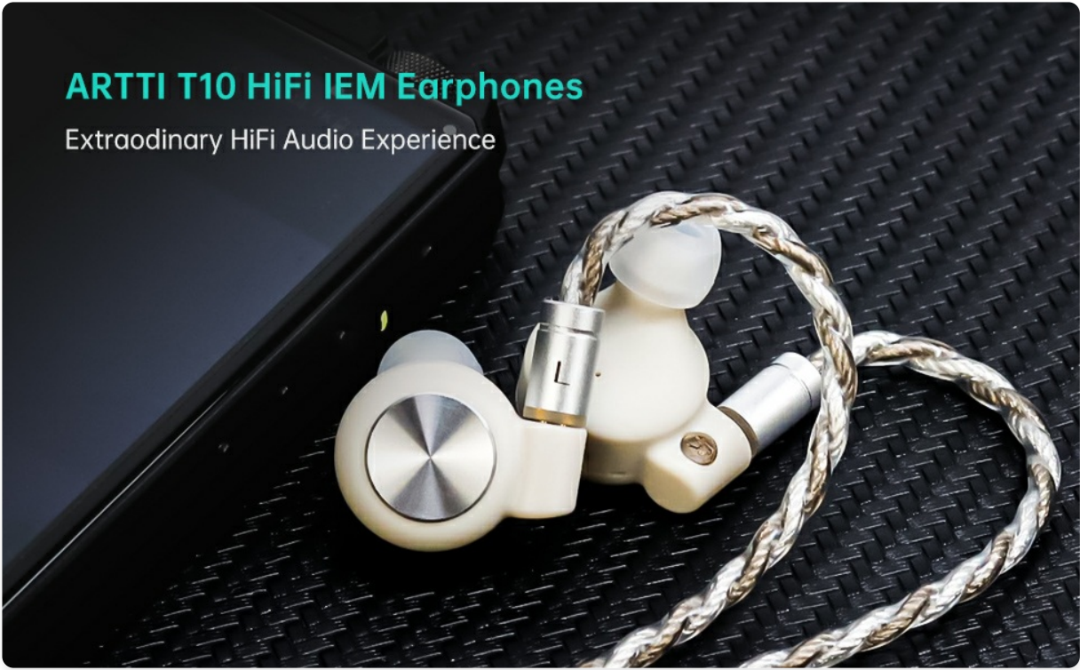
Image: ARTTI T10 earphones connected to a portable audio device.