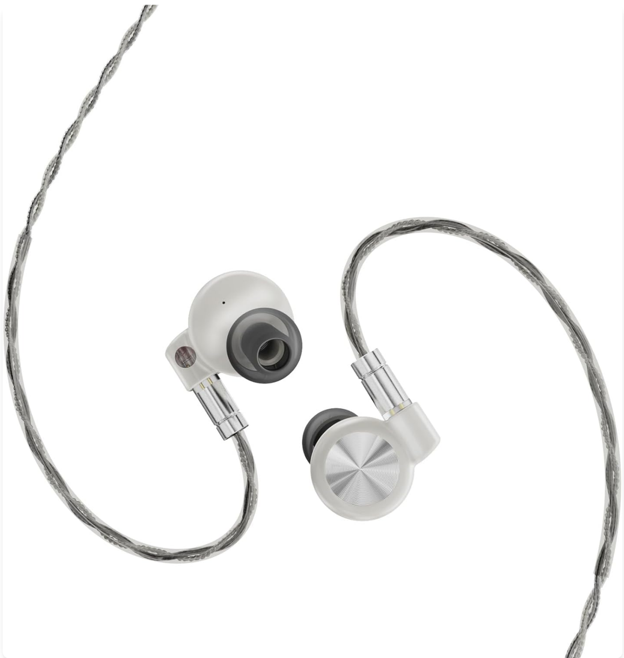
Image: ARTTI T10 In-Ear Earphones with detachable cable.