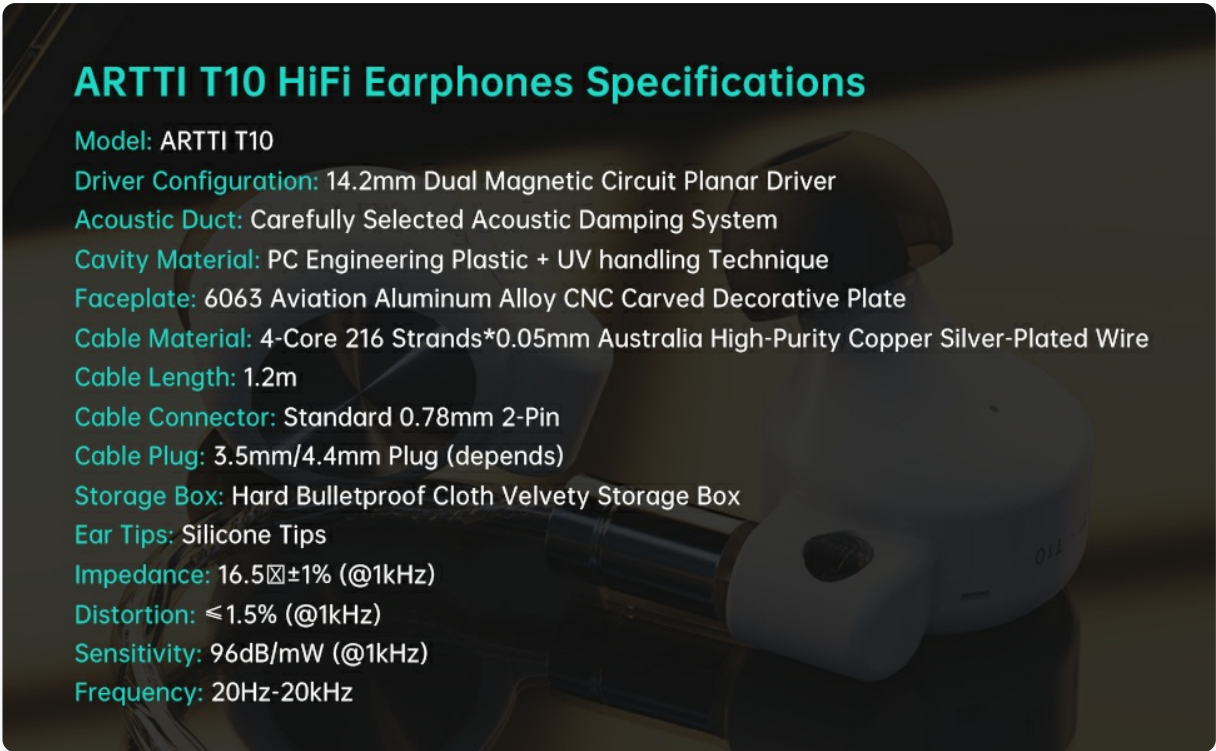
Image: Visual representation of ARTTI T10 HiFi Earphones specifications.

Detailed technical specifications for the ARTTI T10 In-Ear Earphones: