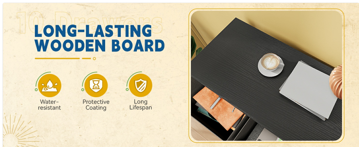
Image 6.1: Features of the wooden top, highlighting its water-resistant and protective coating for durability.