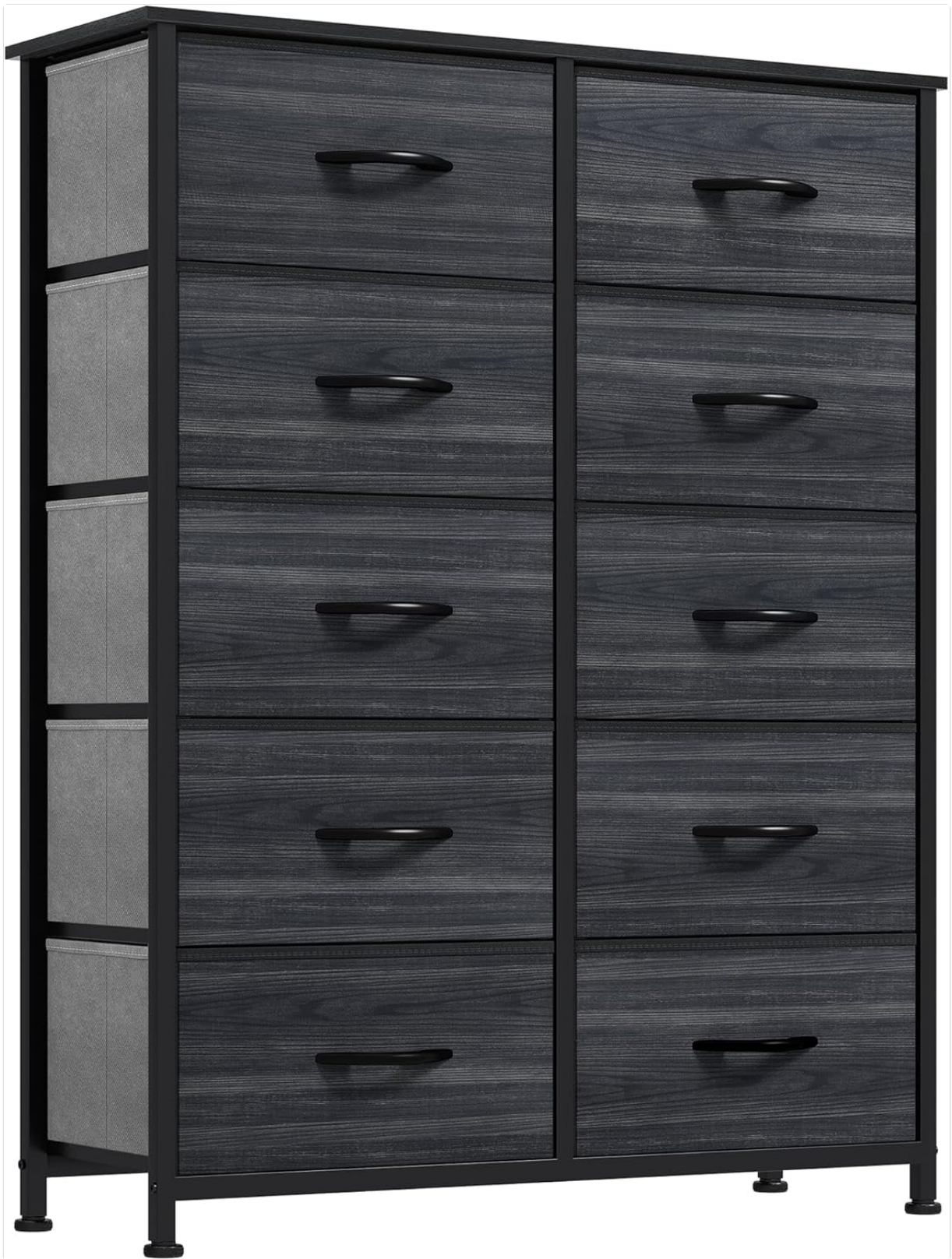
Image 1.1: Front view of the DWVO 10-Drawer Fabric Storage Dresser.