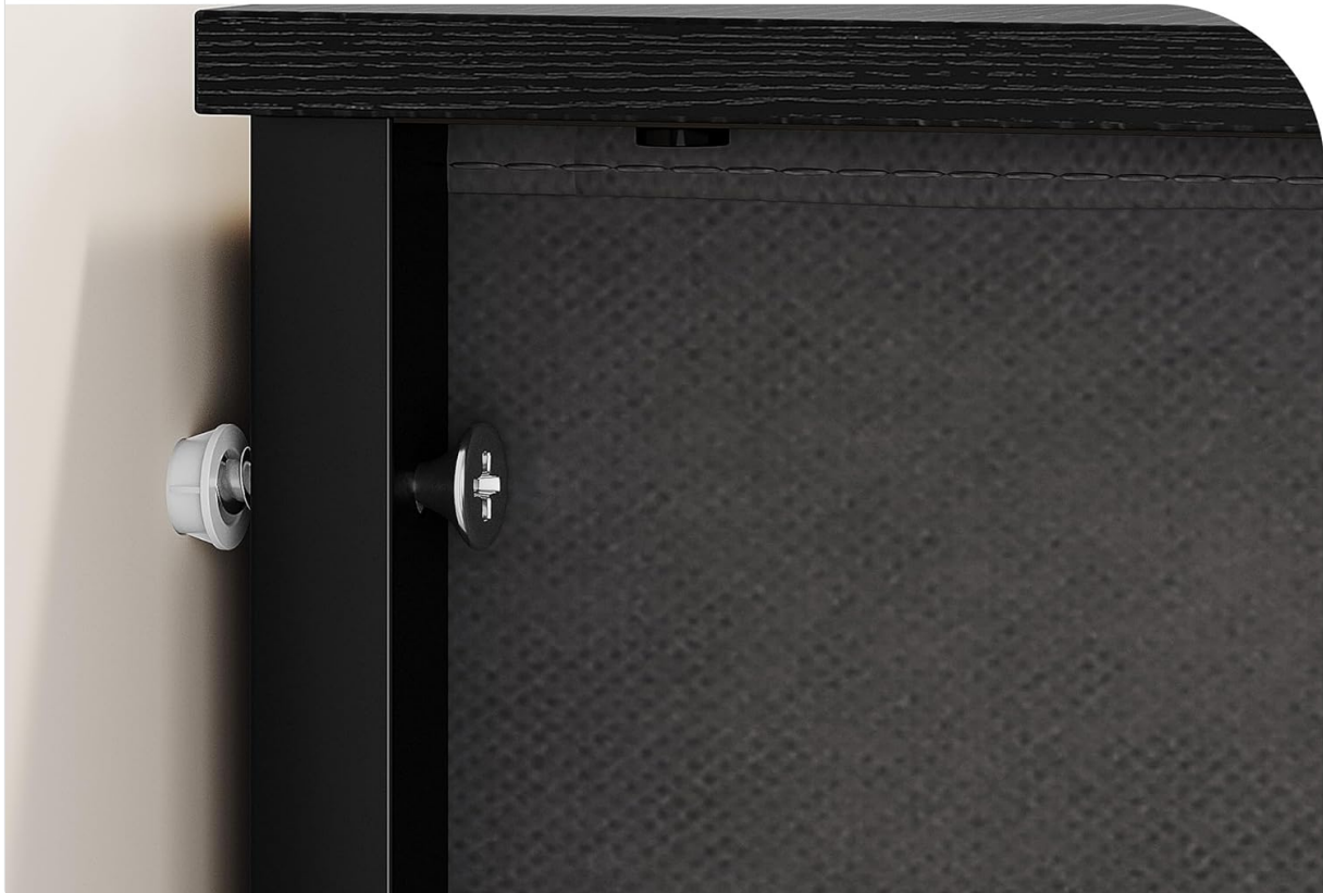
Image 2.1: Illustration of the anti-tip device installation for securing the dresser to a wall.