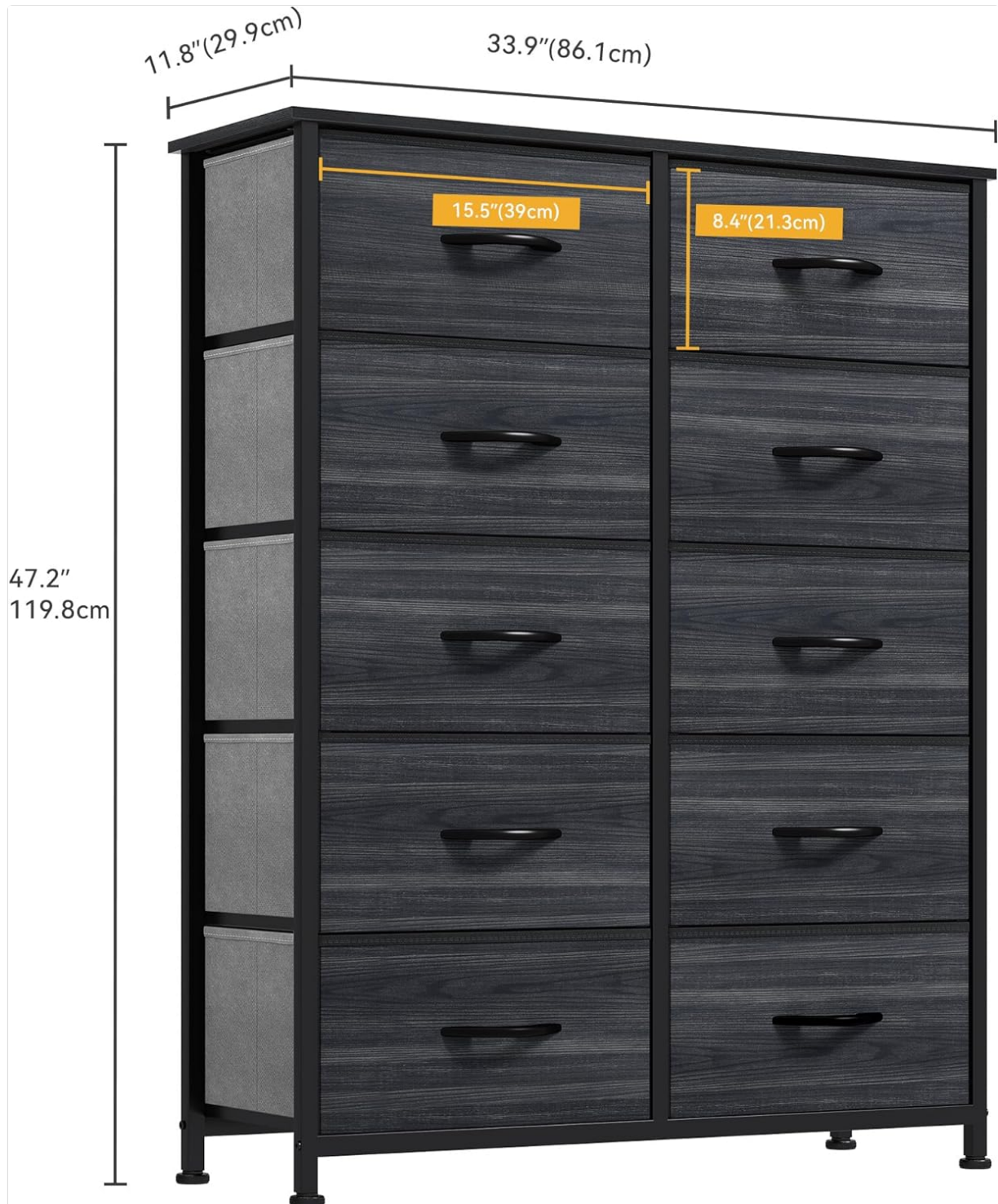
Image 4.1: Dimensions of the assembled dresser: 33.9"L x 11.8"W x 47.2"H.