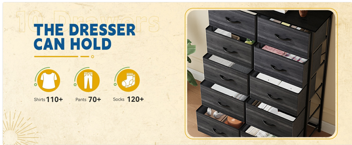
Image 5.2: Visual representation of the storage capacity for clothing items within the 10 drawers.