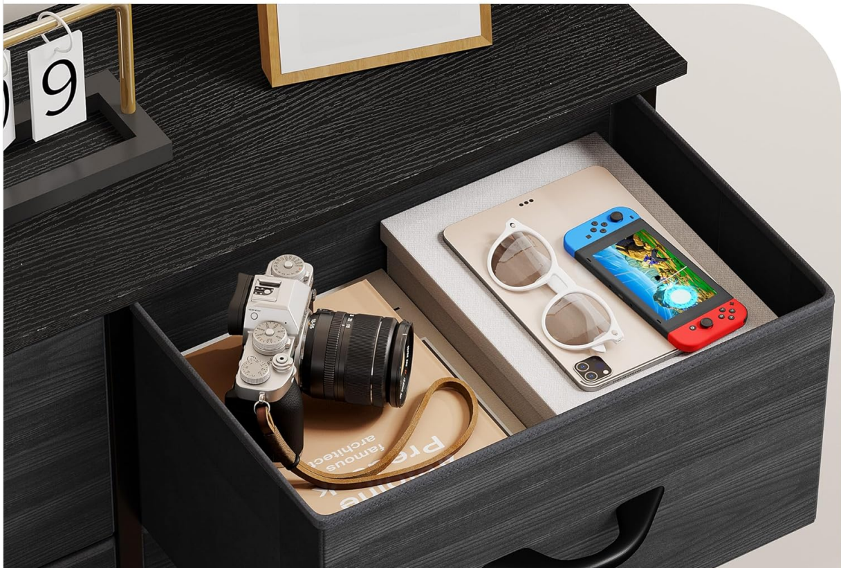
Image 5.1: Example of items stored within a dresser drawer, demonstrating versatile storage.