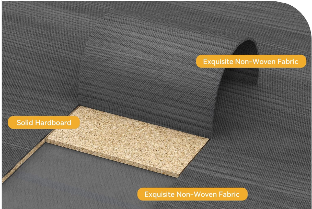
Image 6.2: Detailed view of the 3-layer structure of the fabric drawers, ensuring durability and shape retention.