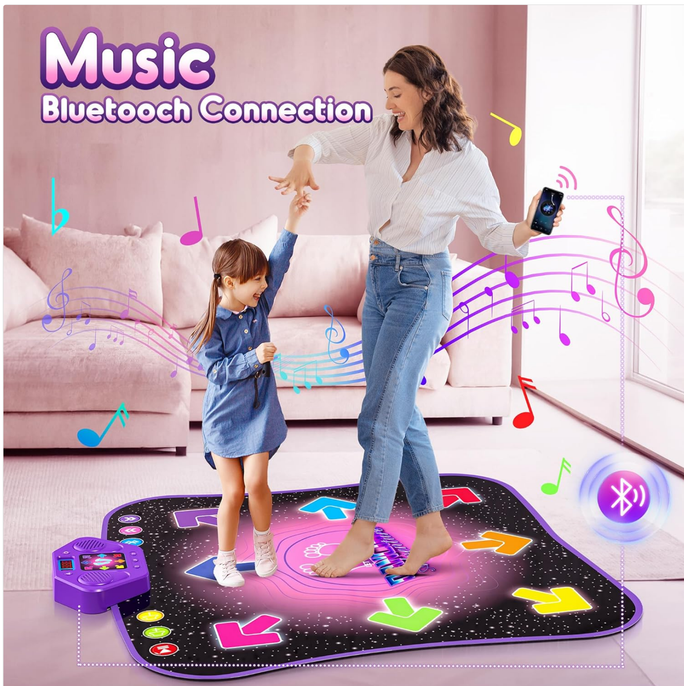
Figure 5: The dance mat connected via Bluetooth, allowing users to dance to their own music.