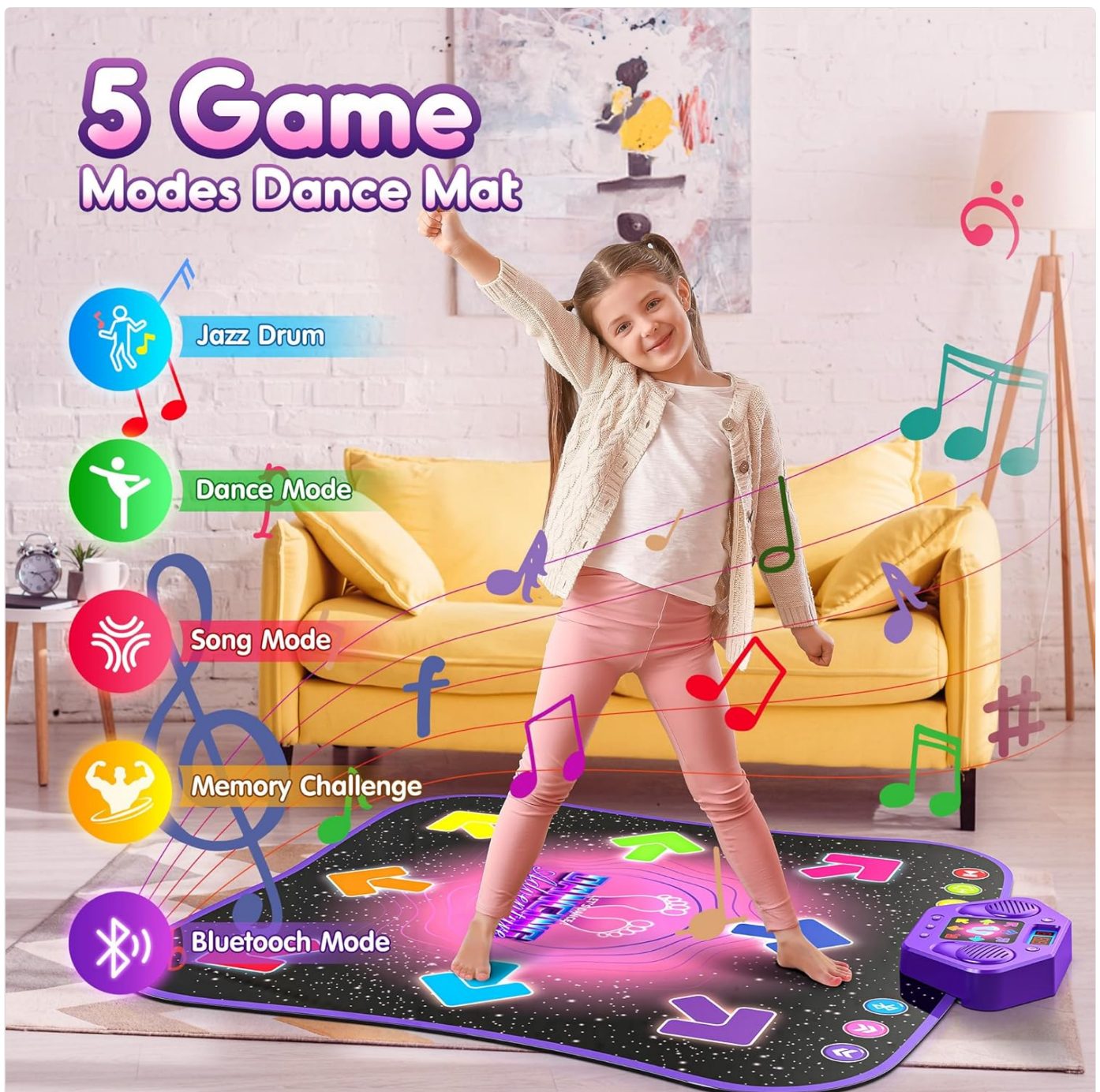
Figure 3: Visual representation of the 5 available game modes.