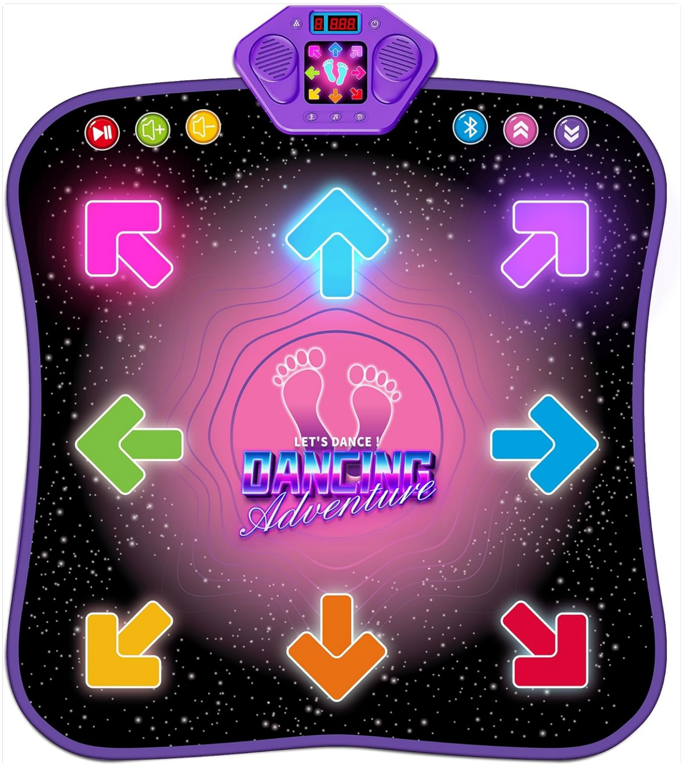
Figure 4: The Flooyes 8-Button Electronic Dance Mat in its entirety.