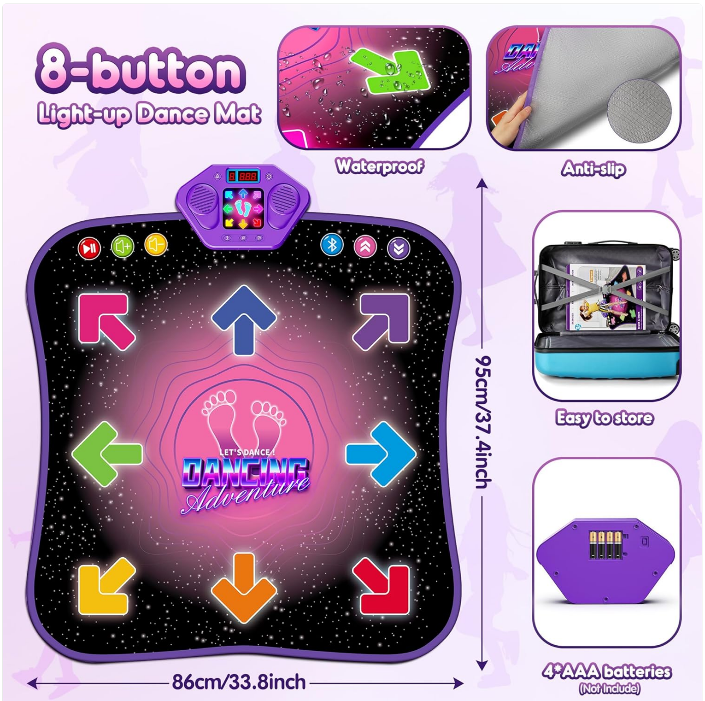
Figure 1: Rear view of the control unit showing the battery compartment and overall dimensions of the dance mat (95cm/37.4in x 86cm/33.8in).