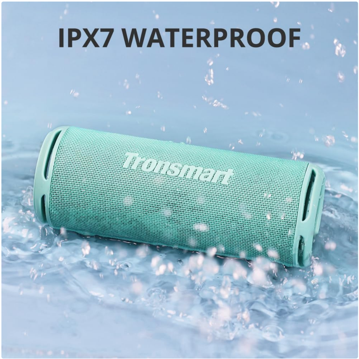
Image: The Tronsmart T7 Lite speaker partially submerged in water, visually confirming its IPX7 waterproof rating.