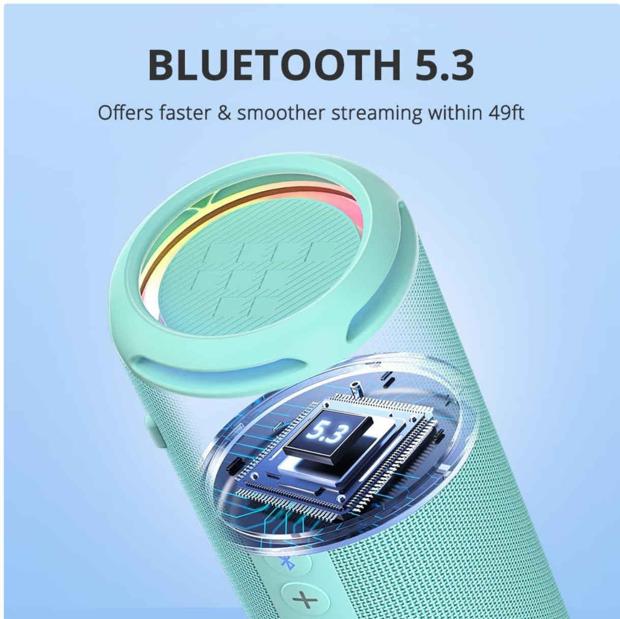
Image: A detailed view of the Tronsmart T7 Lite speaker's internal components, highlighting the Bluetooth 5.3 chip for fast and smooth streaming.

The speaker features Bluetooth 5.3, offering a stable wireless connection up to 49 feet (15 meters).