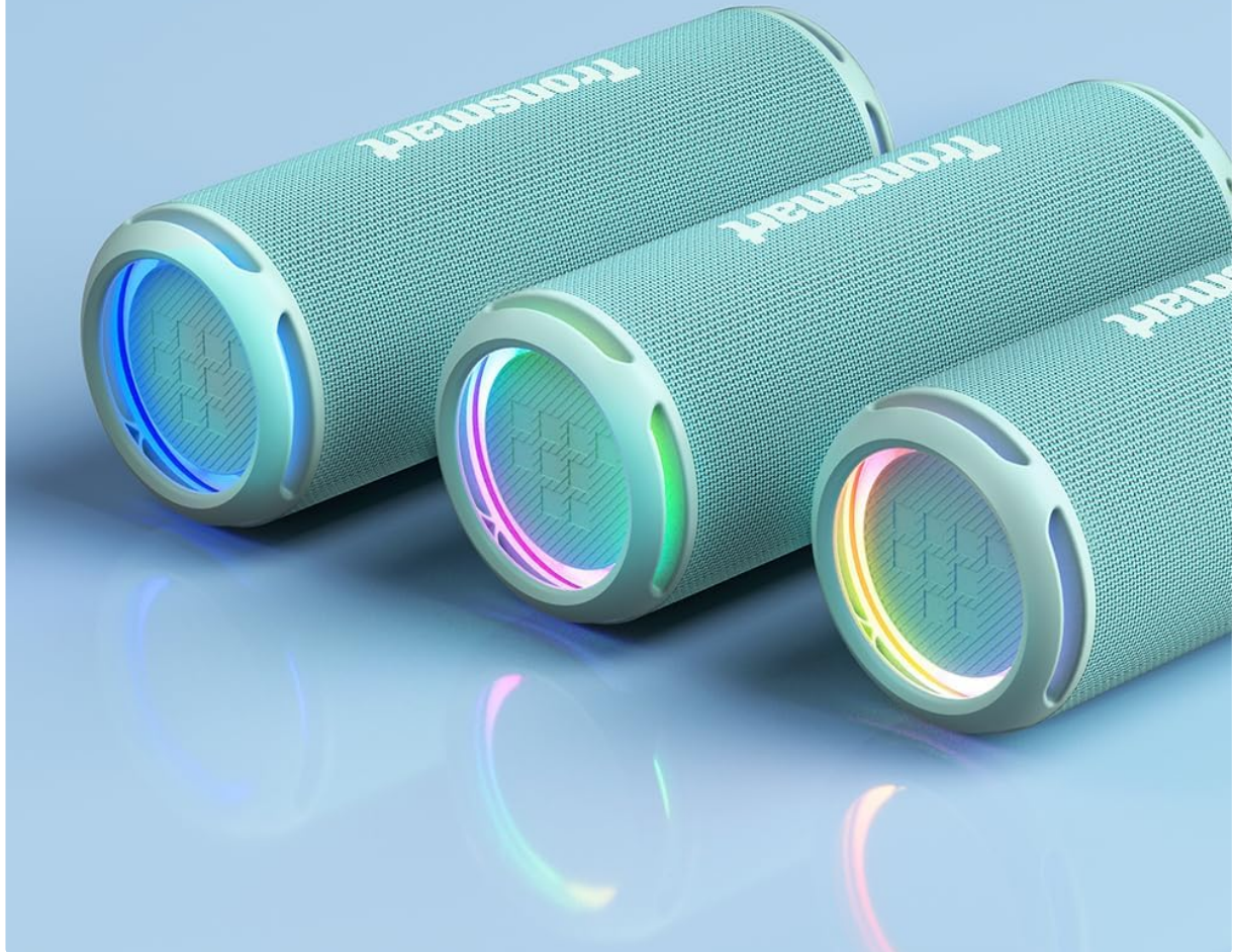
Image: Multiple Tronsmart T7 Lite speakers showcasing their vibrant rainbow light show feature, with lights changing colors.

Shiny light creates a fantastic light show