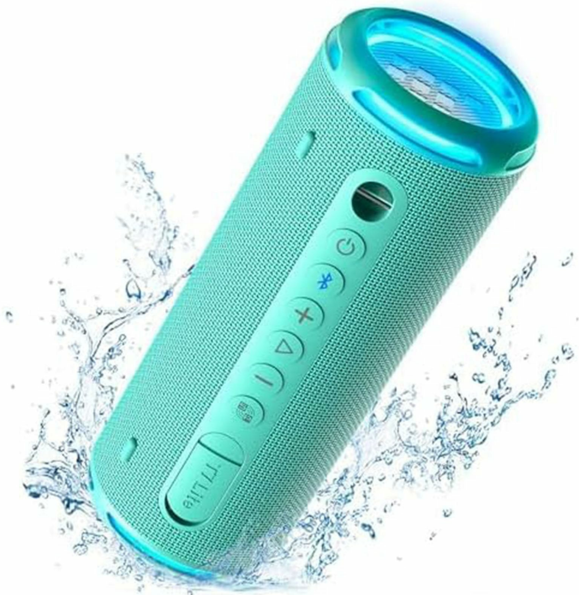
Image: The Tronsmart T7 Lite speaker, highlighting its control panel and overall design. This image shows the speaker in a splash of water, emphasizing its waterproof feature.