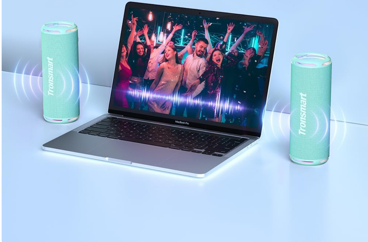
Image: Two Tronsmart T7 Lite speakers positioned on either side of a laptop, illustrating the True Wireless Stereo (TWS) pairing feature for amplified sound.

Pair 2 speakers to amplify your listening