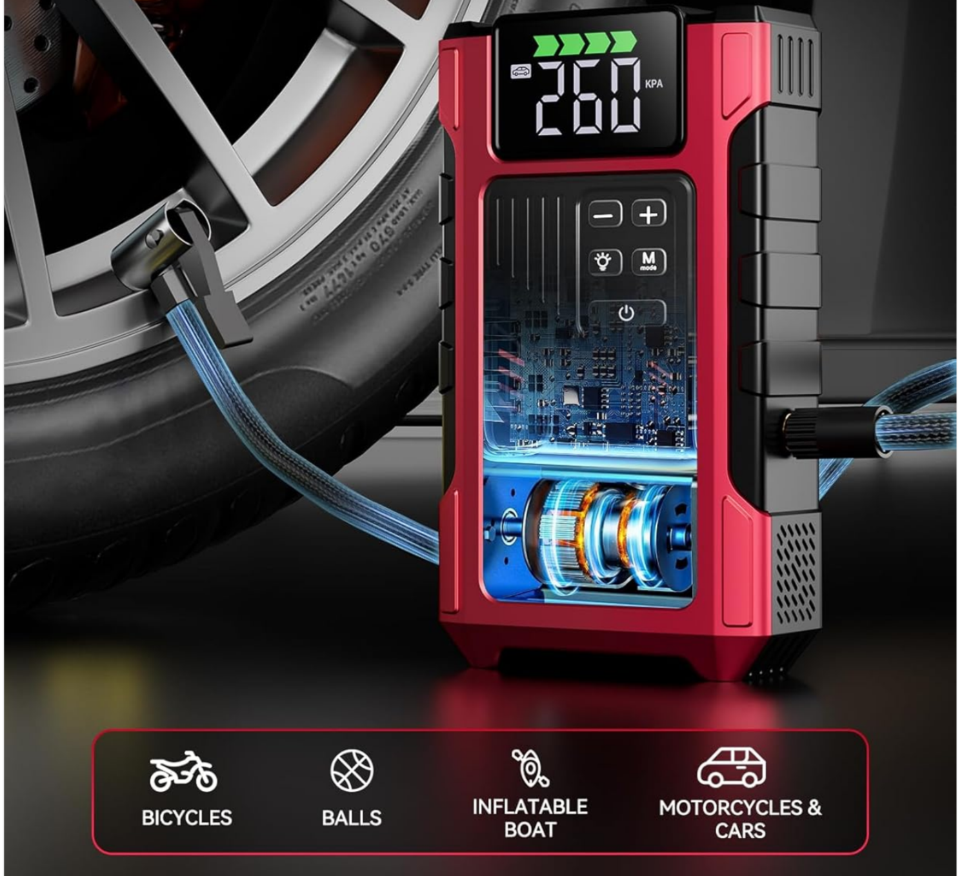
Image: Detailed view of the device's control panel and digital display.