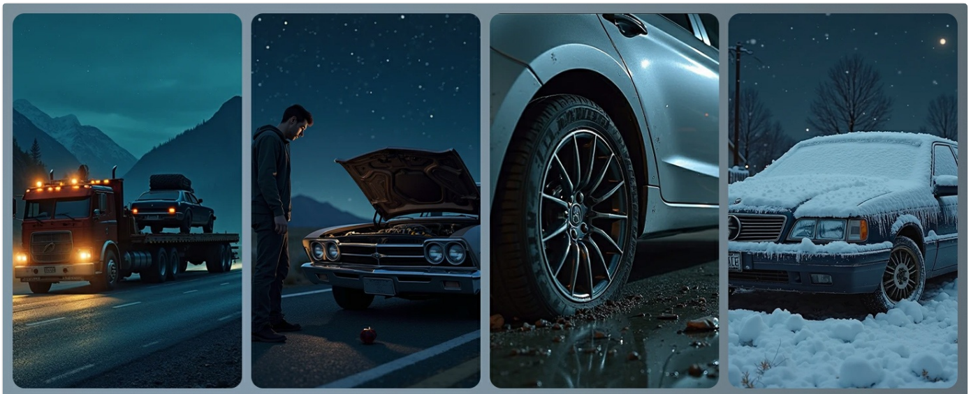
Image: The jump starter's LED flashlight in use during an emergency.

Press the flashlight button to cycle through different light modes: constant on, strobe, and SOS. This feature is useful for roadside emergencies or working in low-light conditions.