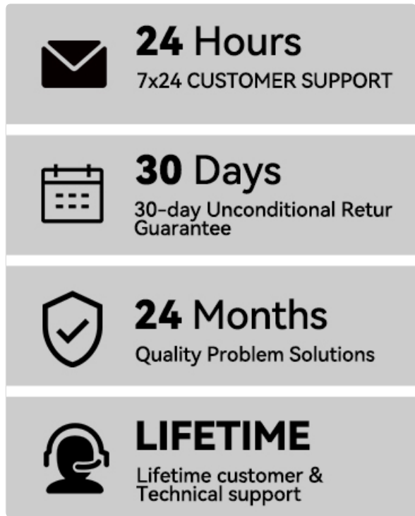
Image: Summary of Pabulum's customer support and warranty offerings.