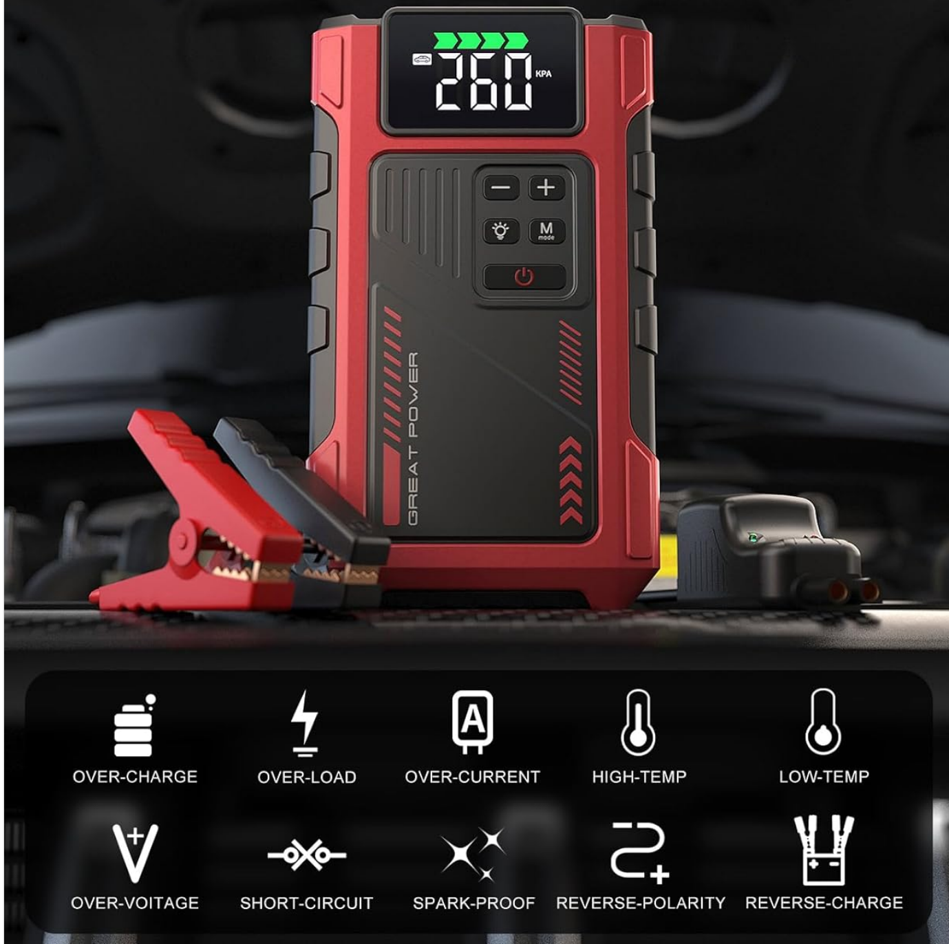
Image: The device features 10 advanced safety protections including over-charge, over-load, over-current, high-temp, low-temp, over-voltage, short-circuit, spark-proof, reverse-polarity, and reverse-charge.