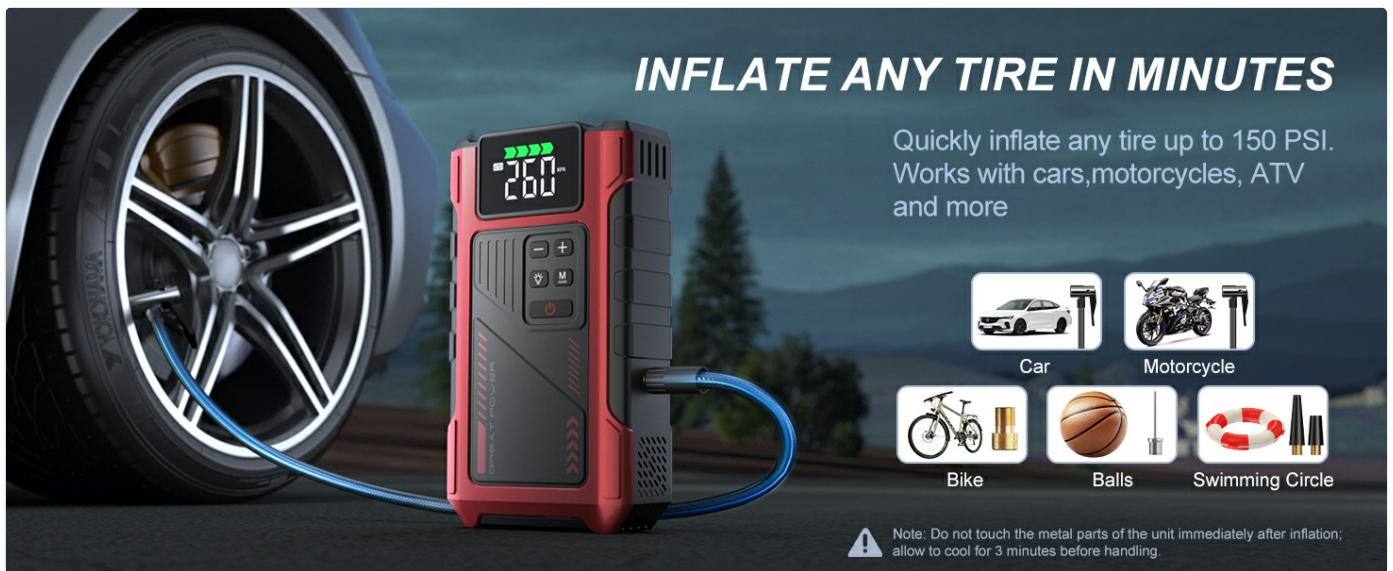
Image: The digital display showing various pressure units and battery charge levels.