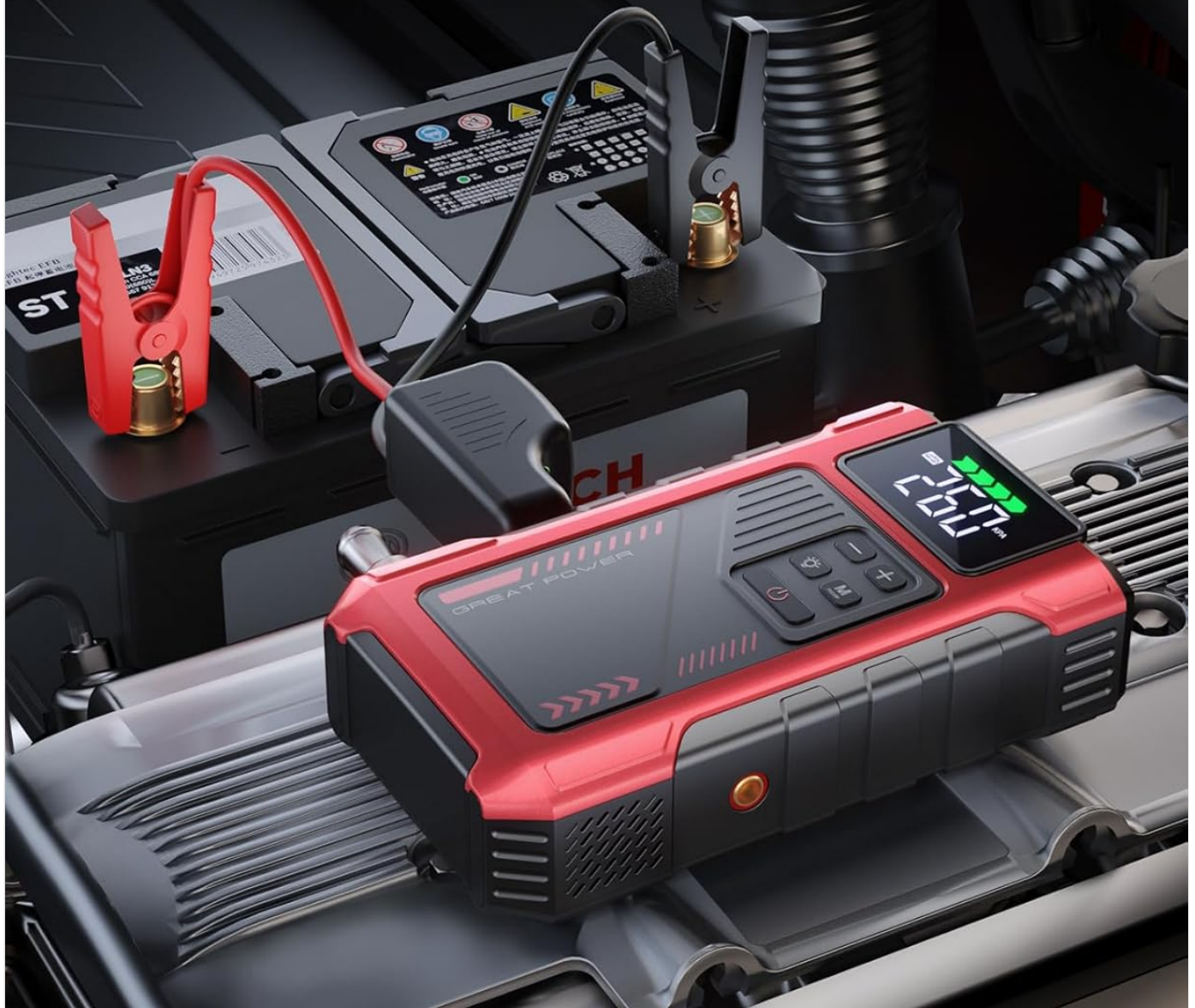
Image: The jump starter connected to a car battery, ready for operation.