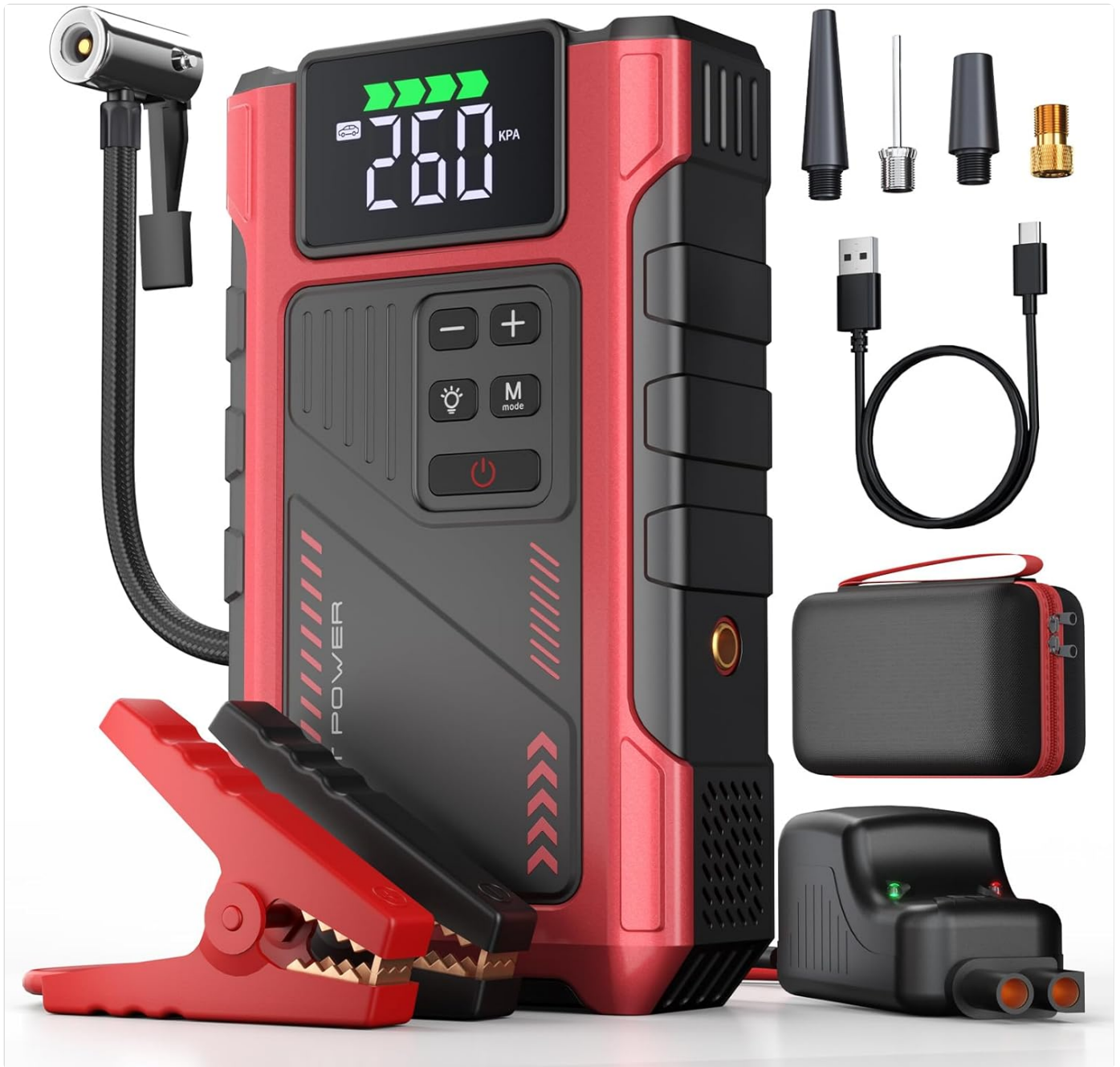
Image: All components included in the package, neatly arranged.