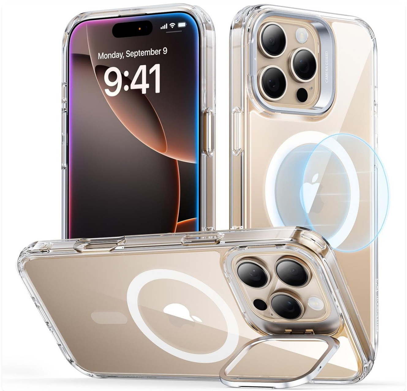
Figure 1: Overview of the ESR Classic Series Clear Case, highlighting its transparent design and integrated MagSafe ring and kickstand.