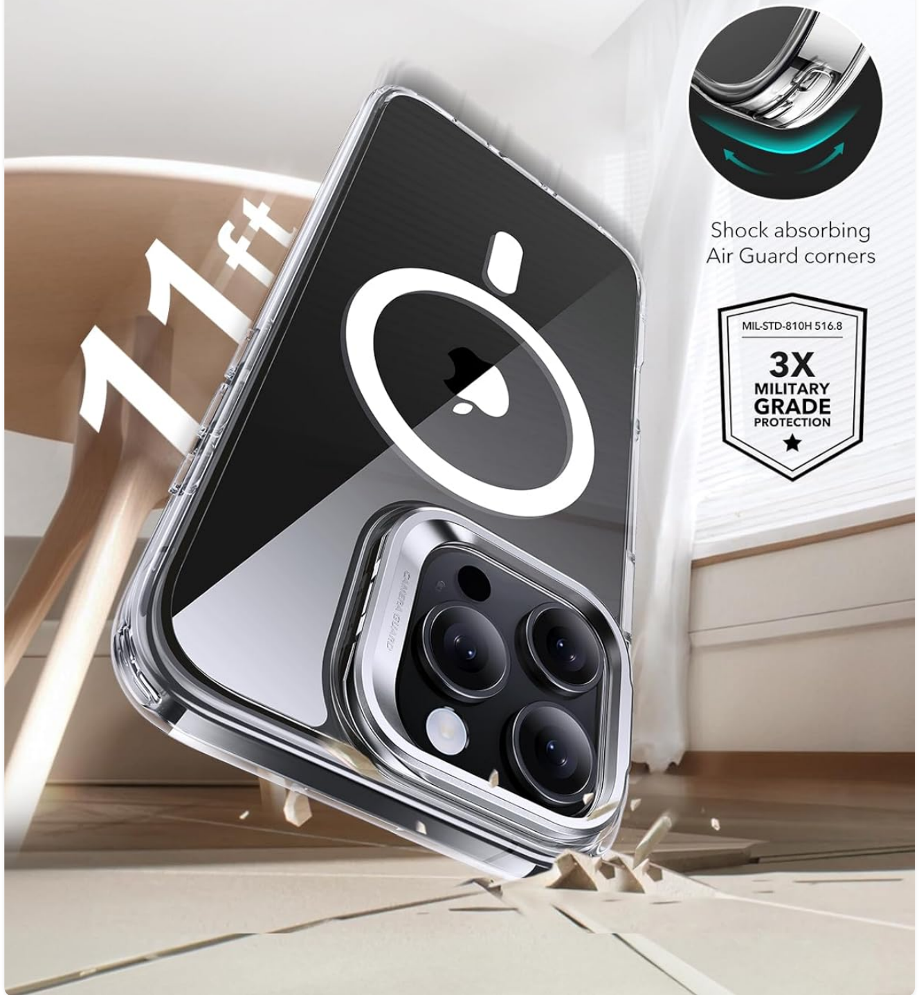
Figure 2: Illustration of the case's military-grade protection, highlighting the reinforced Air Guard corners designed to absorb shock from impacts.