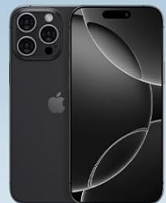
Figure 5: Confirming compatibility: This case is exclusively designed for the iPhone 16 Pro Max.