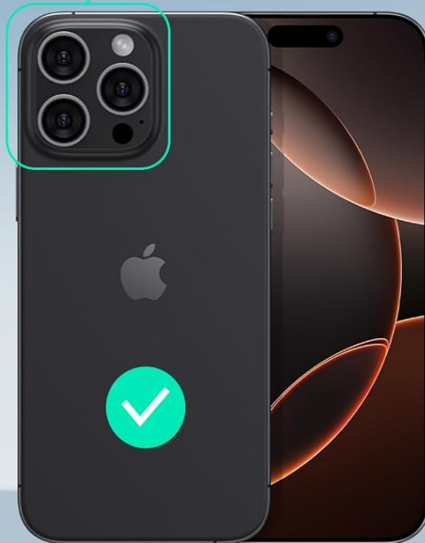
iPhone 16 Pro Max