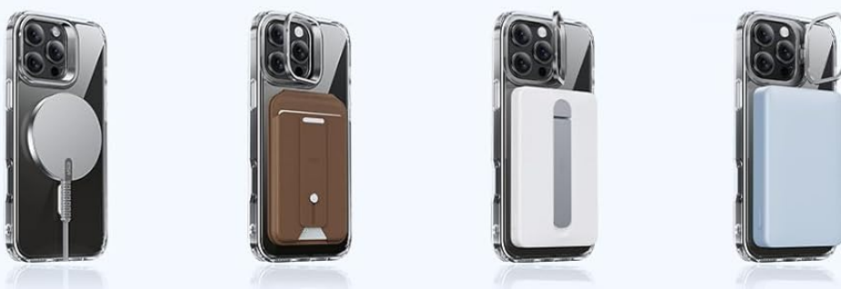
Figure 6: Wireless charging via MagSafe, demonstrating the case's compatibility with MagSafe chargers.