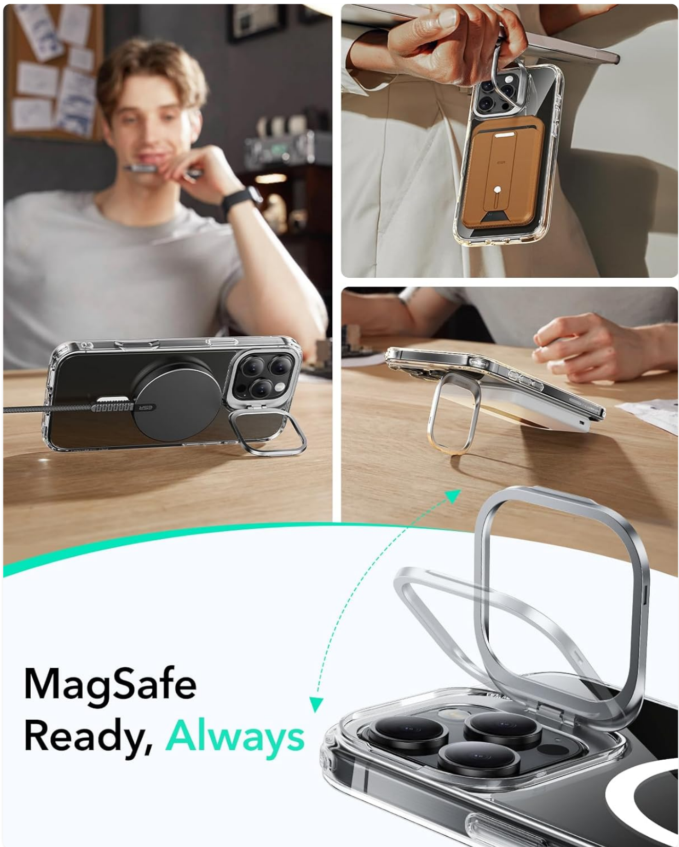
Figure 4: Examples of the versatile stash stand, illustrating its use for hands-free viewing and MagSafe accessory compatibility.