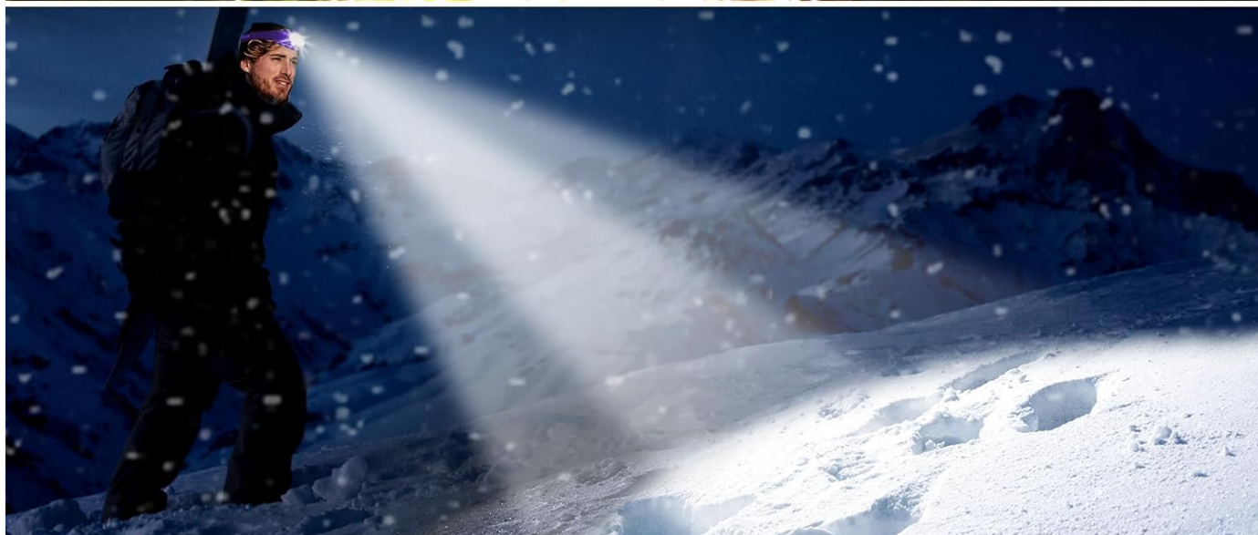
Image: Visual representation of the headlamp's lightweight design (86g), adjustable headband, and 45-degree tilt angle feature.