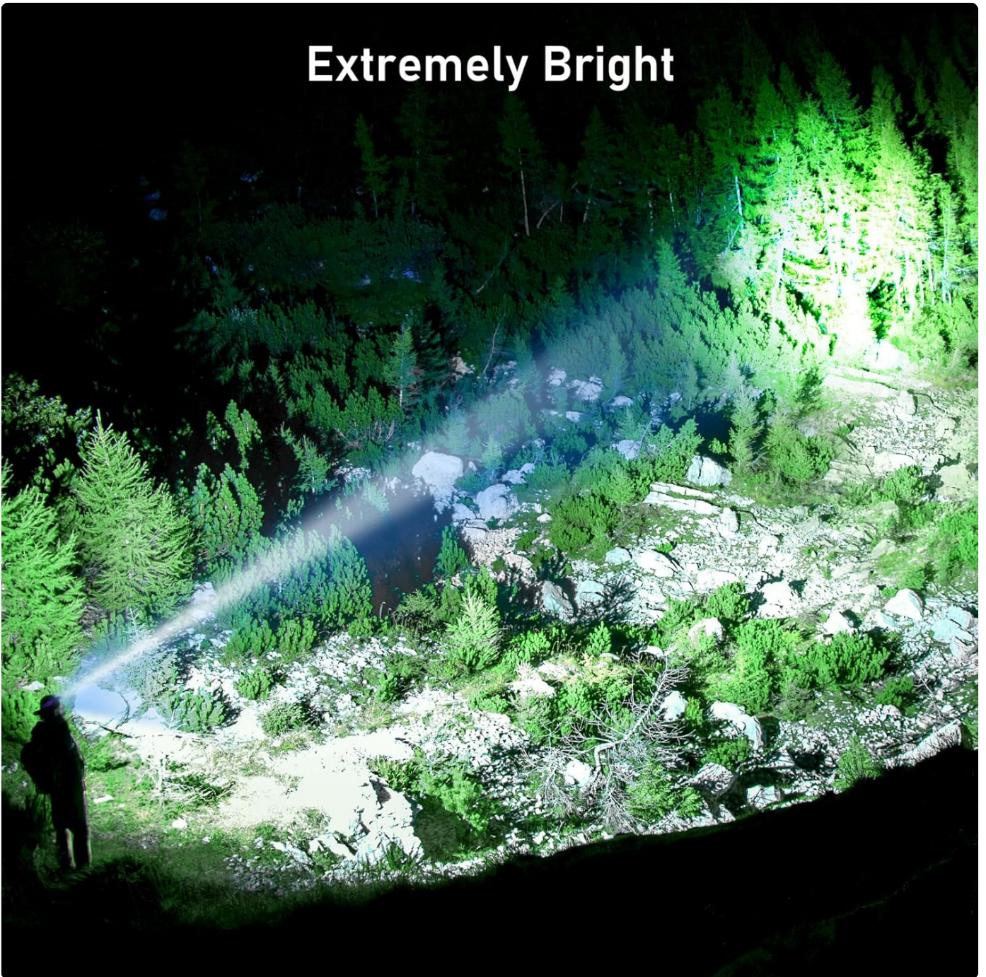
Image: A powerful beam from the Blukar Headlamp illuminating a vast outdoor area at night, highlighting its super bright capability.