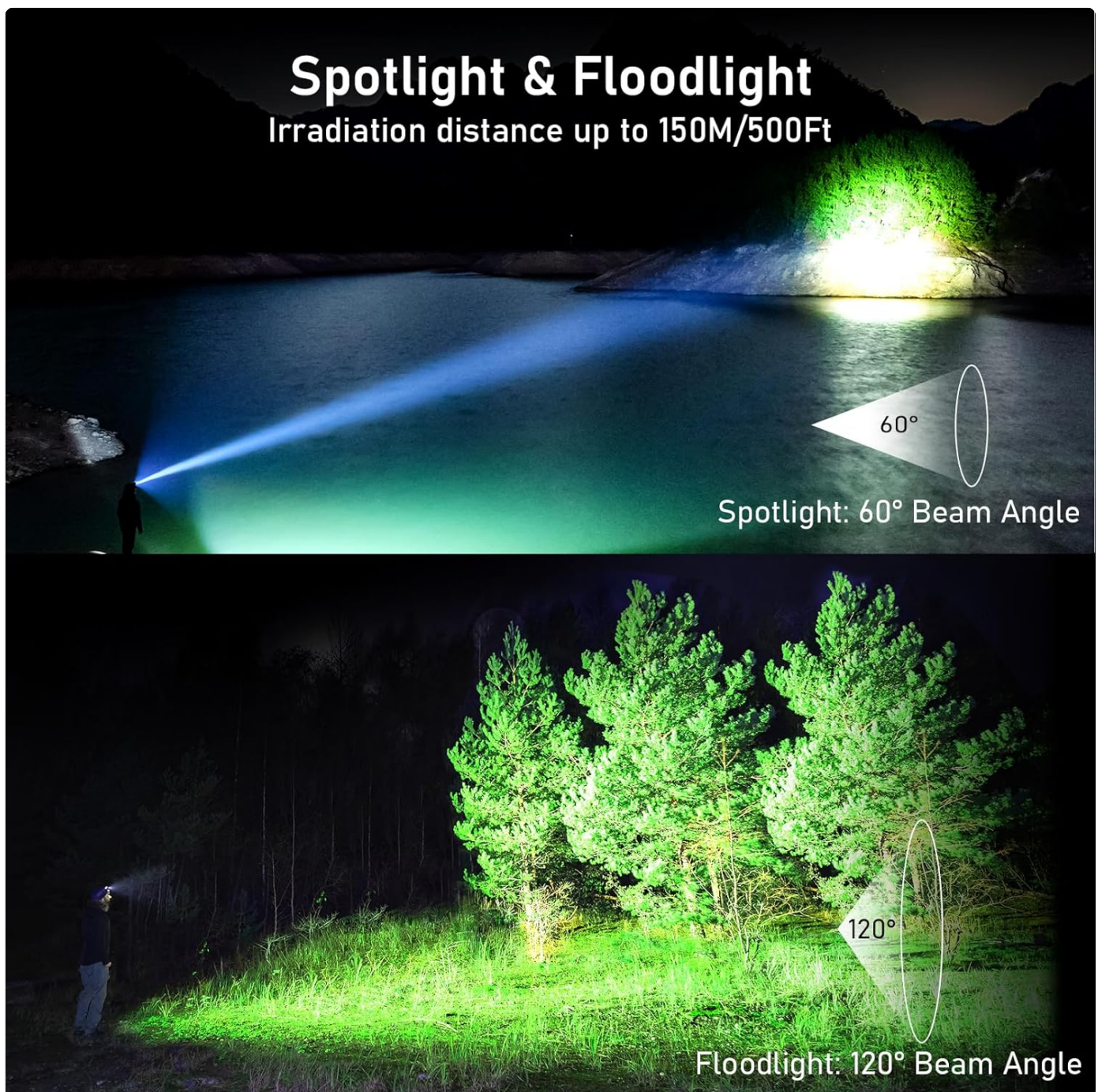
Image: A diagram illustrating the distinct beam angles for spotlight (60 degrees) and floodlight (120 degrees) modes, demonstrating the headlamp's versatility in illumination.