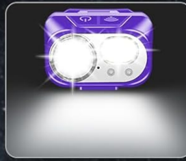
Spotlight + Floodlight