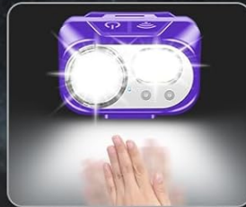
3 Sensor White Light