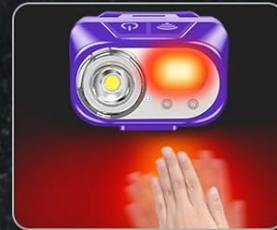
2 Sensor Red Light