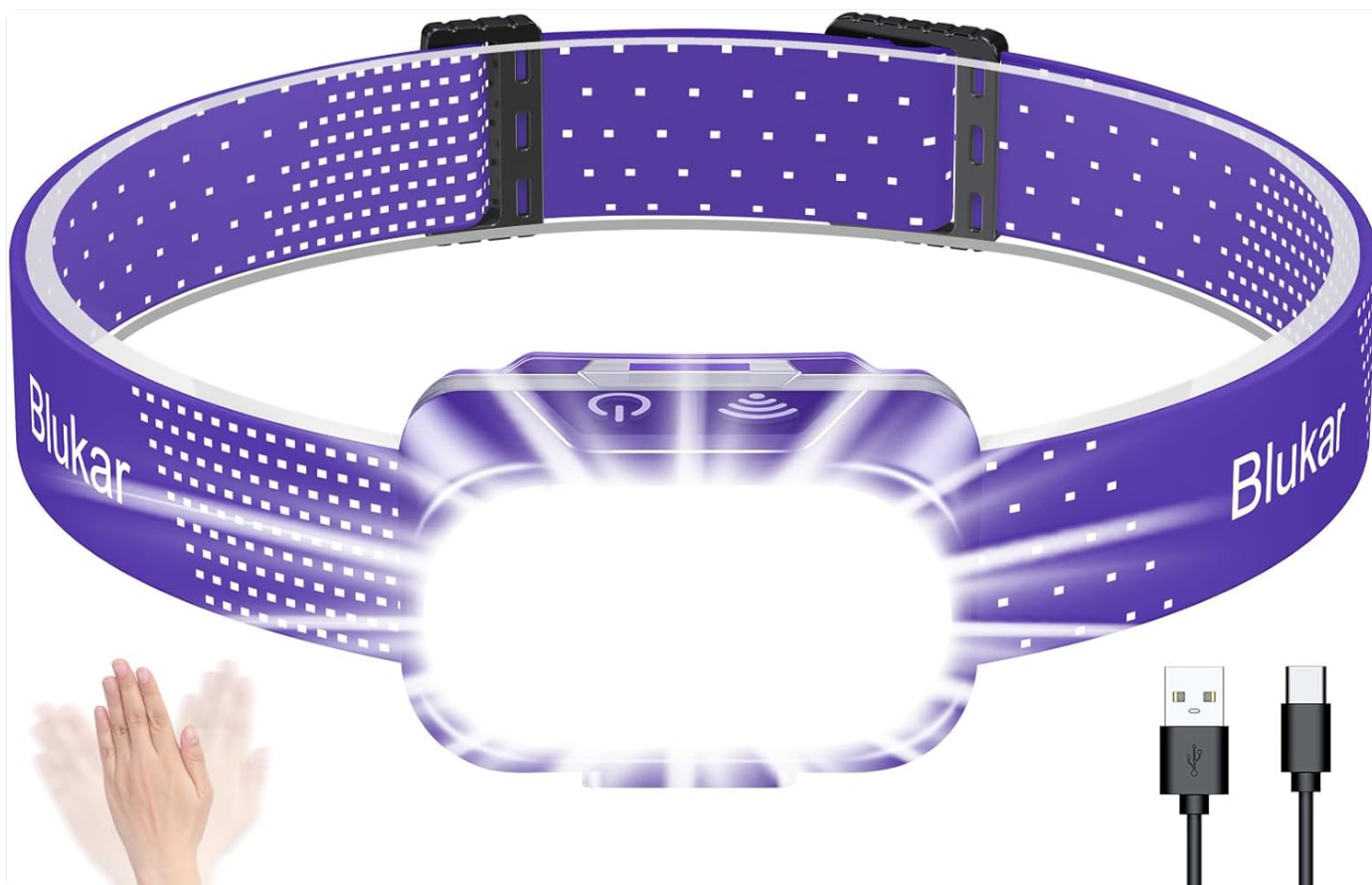
Image: The Blukar Headlamp LED Rechargeable in Eustoma Purple, showcasing its sleek design and adjustable headband. A USB-C charging cable is also visible.

Thank you for choosing the Blukar Headlamp LED Rechargeable. This super bright head torch is designed for various outdoor activities, offering versatile lighting modes, continuous dimming, and motion sensor capabilities. Its durable, waterproof design ensures reliable performance in diverse environments. Please read this manual carefully before use to ensure proper operation and maintenance.