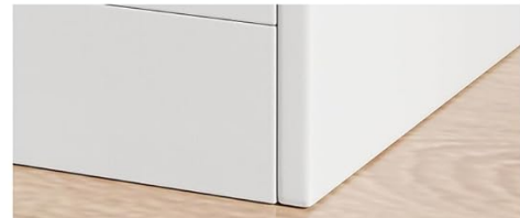
High Wooden Base