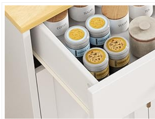
Figure 4: Detail of the smooth metal slides for easy drawer operation.