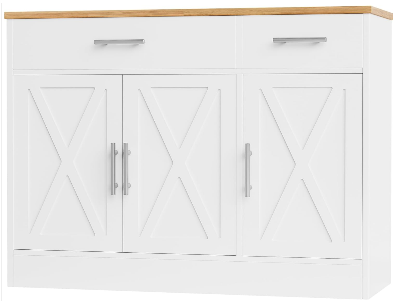
Figure 1: Front view of the Shintenchi Modern Farmhouse Sideboard Buffet Cabinet.