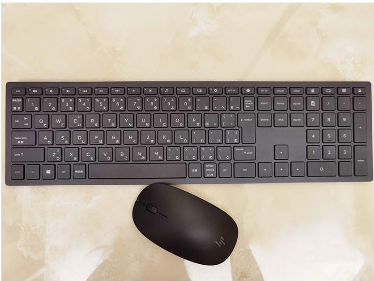
Image 1.1: The complete Ultra-thin Silent Wireless Keyboard and Mouse Set.

This manual provides detailed instructions for the setup, operation, maintenance, and troubleshooting of your Generic Ultra-thin Silent Wireless Keyboard and Mouse Set. This set is designed for use with laptops and desktop computers, offering a quiet and efficient input experience.