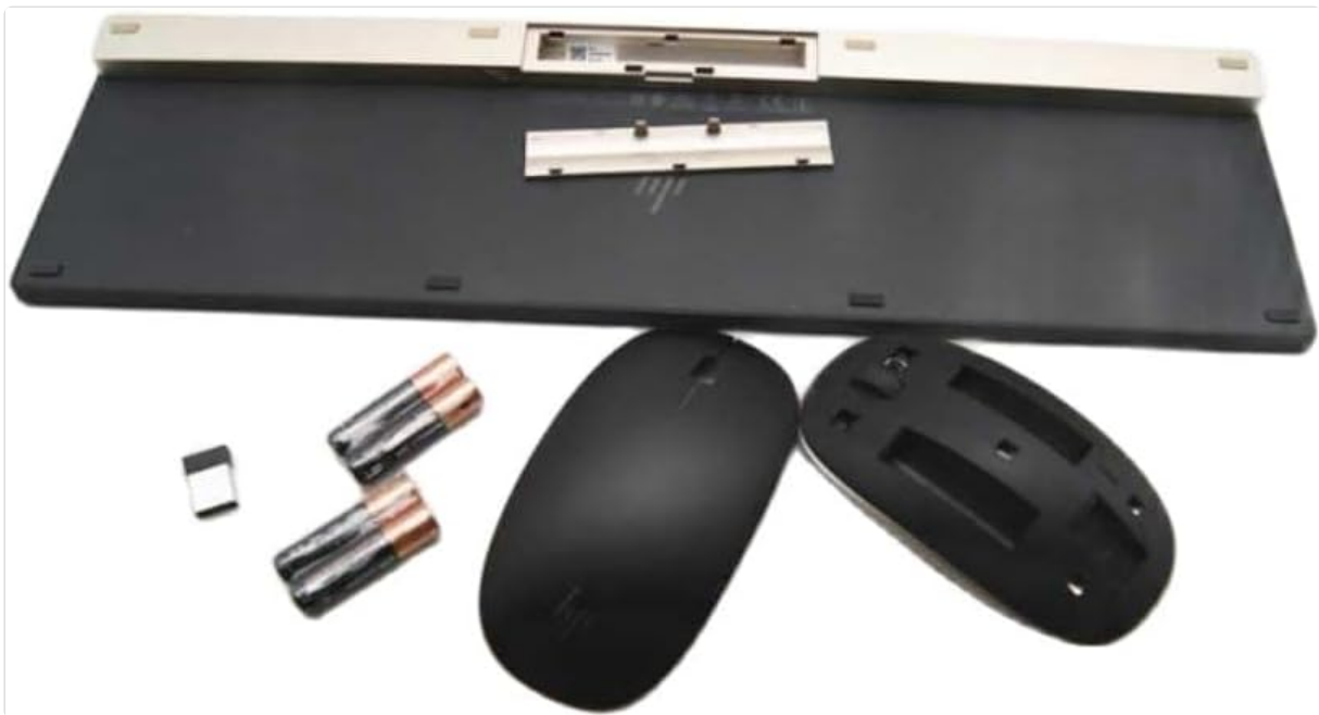
Image 2.1: View of the keyboard underside, mouse, batteries, and the USB wireless receiver.