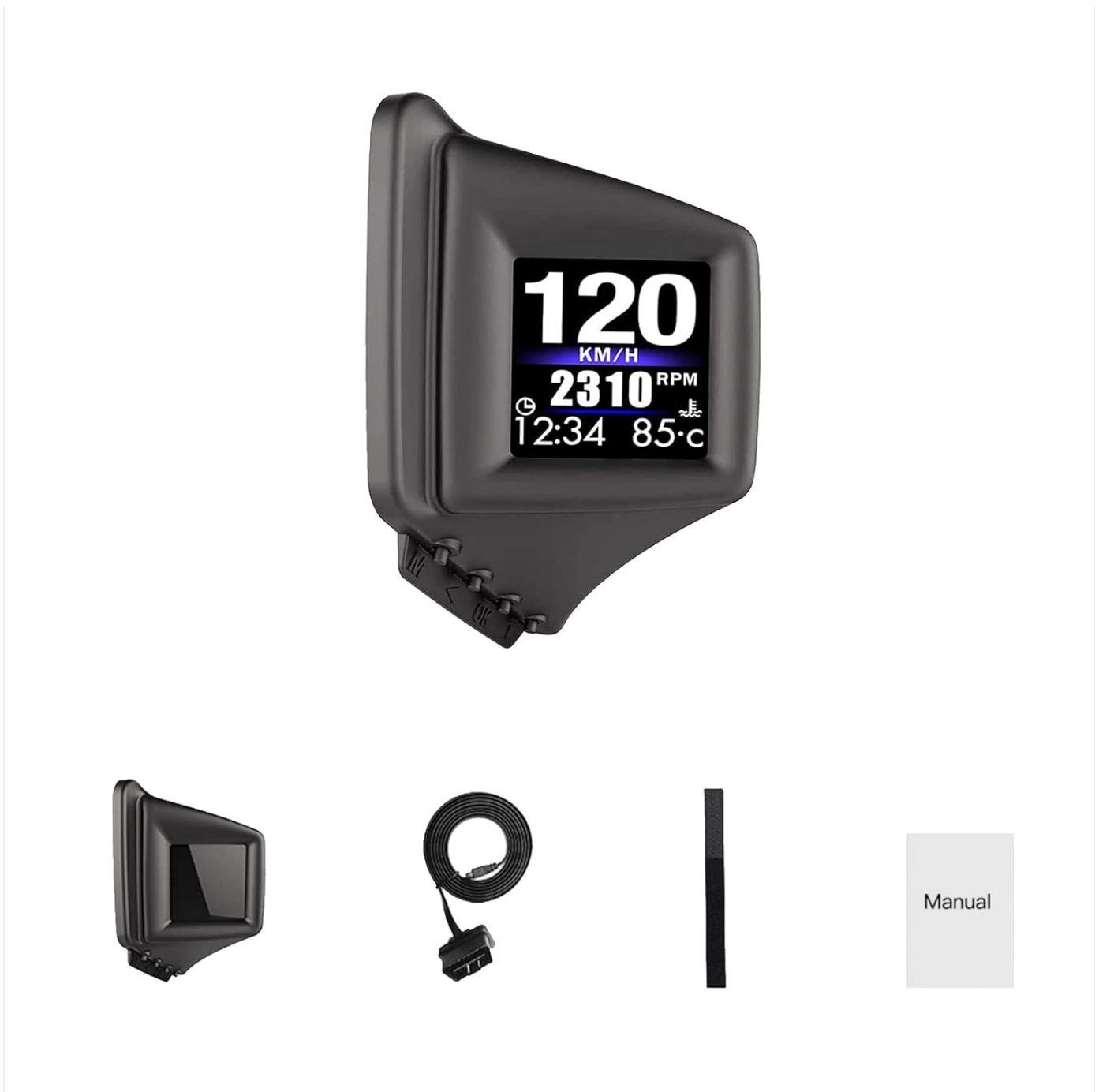
Image: Contents of the BY-J Heads Up Display package. It shows the main display unit, an OBD cable, a USB cable, a 3M adhesive pad, and the user manual.