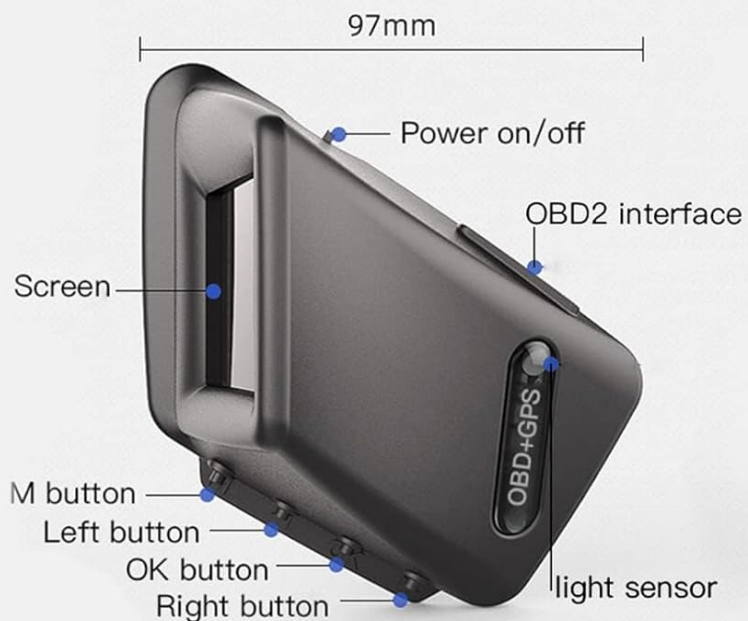
Image: Detailed product dimensions and views. The image illustrates the side view with a height of 61mm and depth of 49mm, and a front view with a width of 97mm. Key components like the screen, power on/off button, OBD2 interface, M button, Left button, OK button, Right button, and light sensor are labeled.