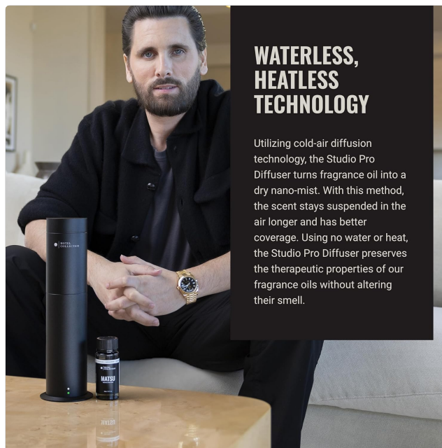
Figure 5: Explanation of waterless, heatless diffusion technology.