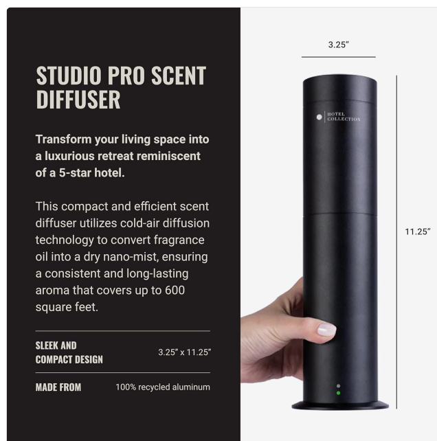
Figure 3: Diffuser dimensions and material.

Place the diffuser on a flat, stable surface in an area where the scent can circulate freely. The compact and portable design (3.25" x 11.25") allows it to seamlessly fit into various decors.