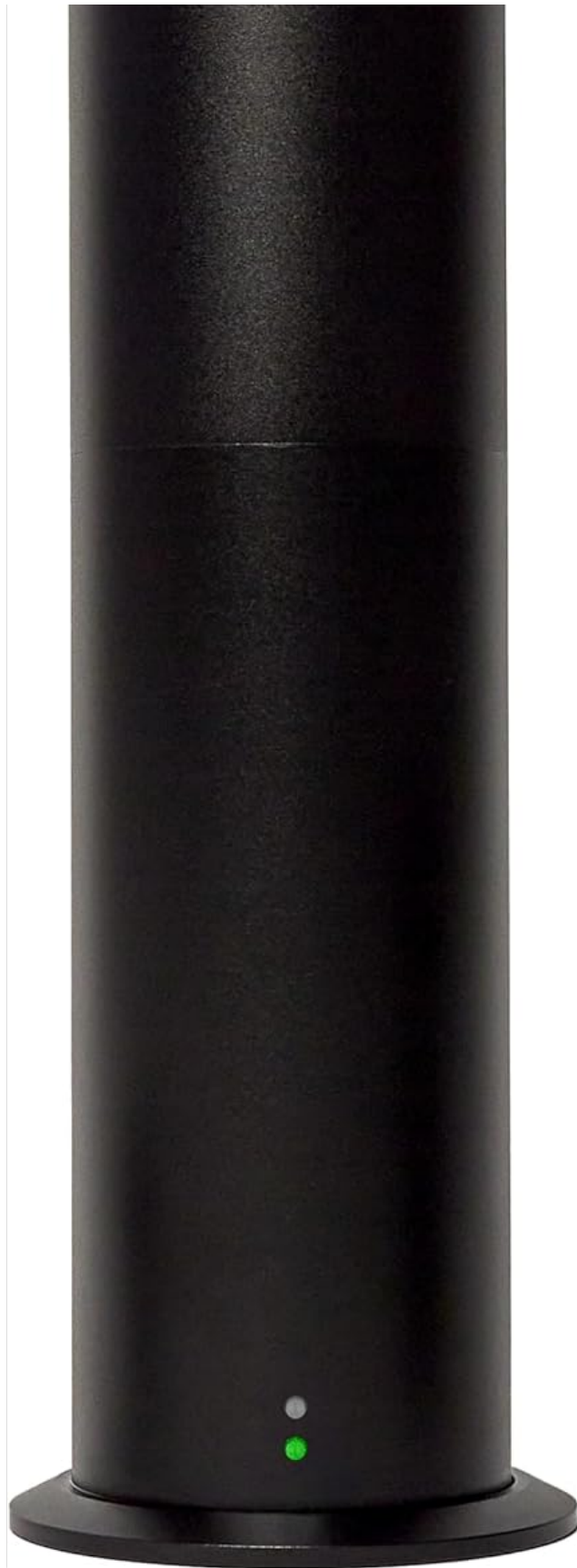
Figure 1: Hotel Collection Studio Pro Essential Oil Diffuser.