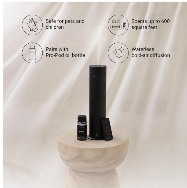
Figure 2: Diffuser with Pro-Pod oil bottle and remote control.