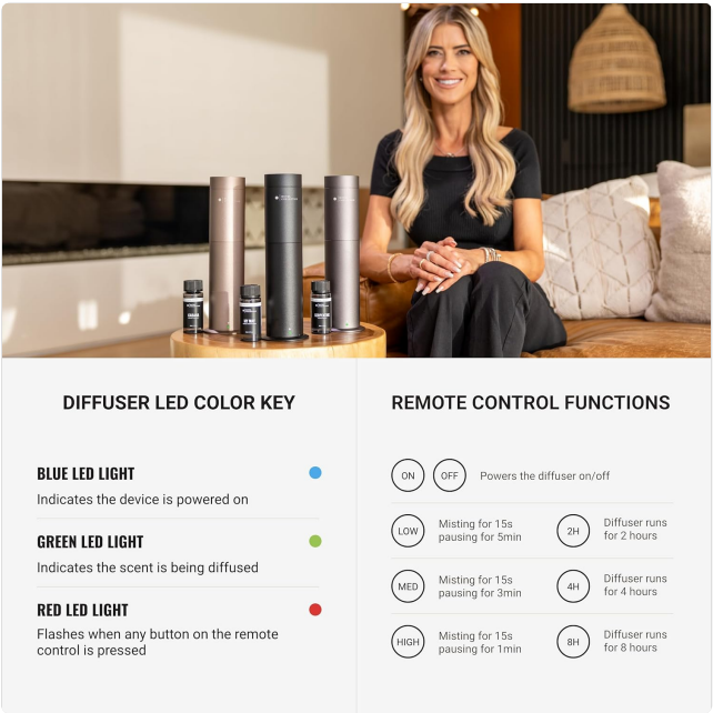
Figure 4: Diffuser LED indicators and remote control functions.