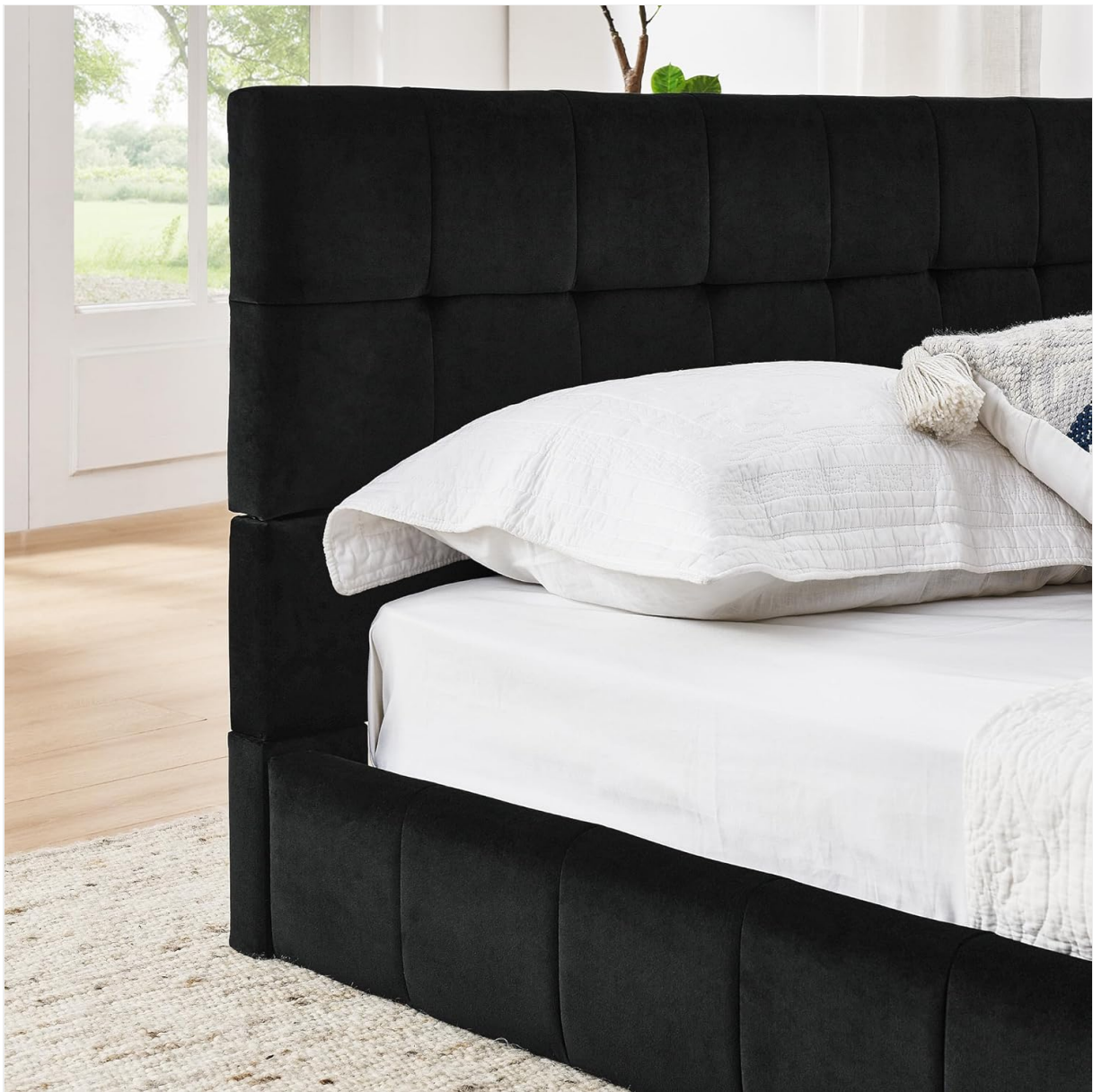
Image: A detailed view of the velvet upholstered headboard, highlighting the texture and tufted design.