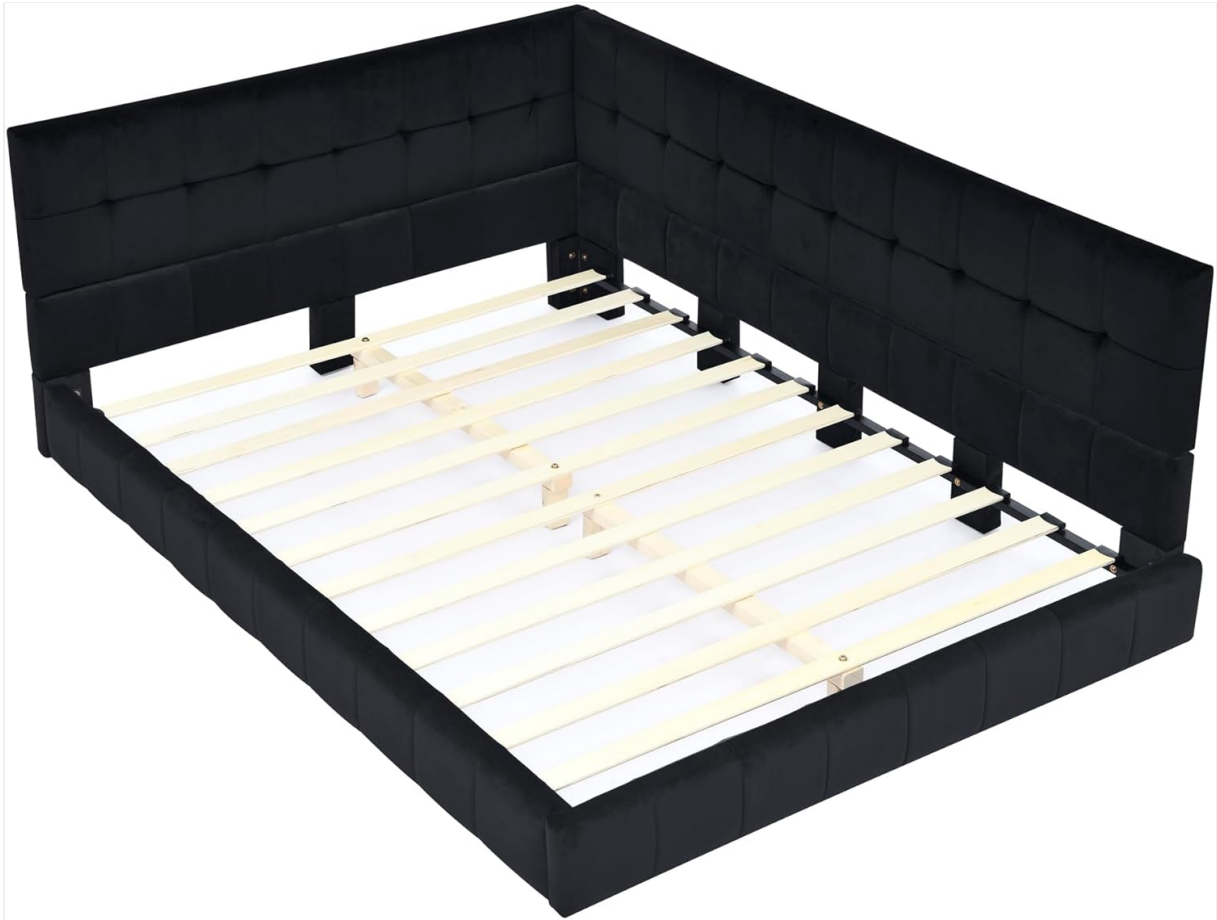
Image: Overview of the bed frame components, including the upholstered frame and wooden slats, ready for assembly.