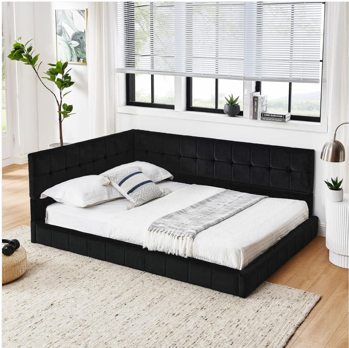
Image: The VilroCaz Full Size Upholstered Platform Bed assembled and styled as a daybed in a room, showcasing its L-shape headboard and fabric upholstery.