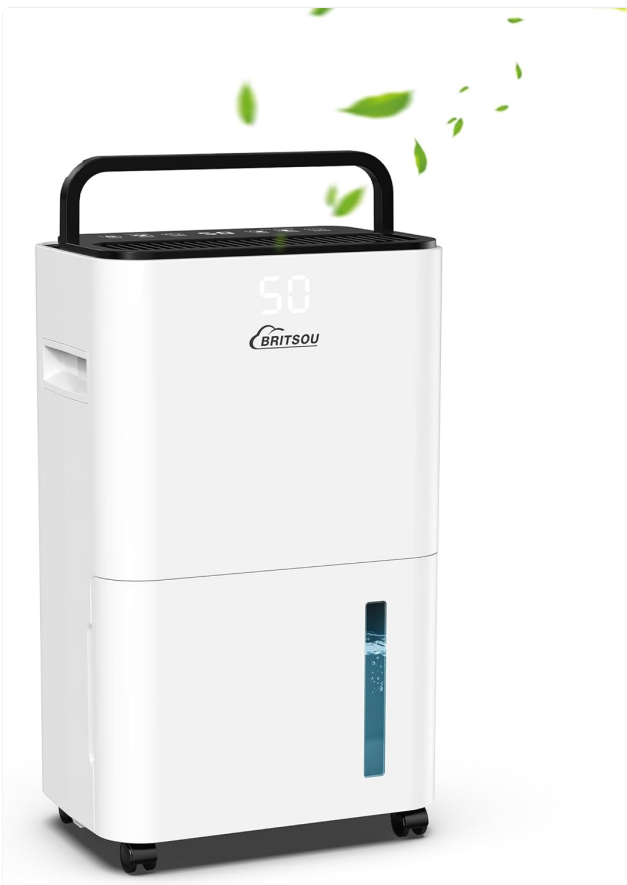
Figure 3.1: Front view of the BRITSOU Dehumidifier, showing the digital display and water tank.