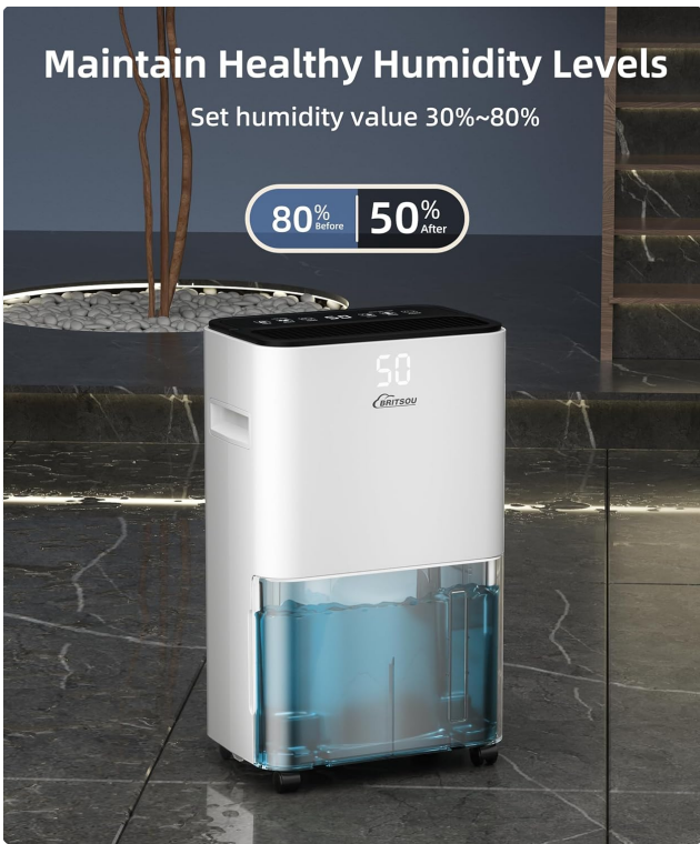
Figure 3.2: Close-up of the Smart Control Panel, displaying various function buttons and the humidity value.