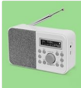
Image 8: The MangoKit SR20 functioning as an alarm clock on a bedside table.