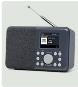
Image 7: The MangoKit SR20 connected via Bluetooth to a smartphone, streaming music wirelessly.