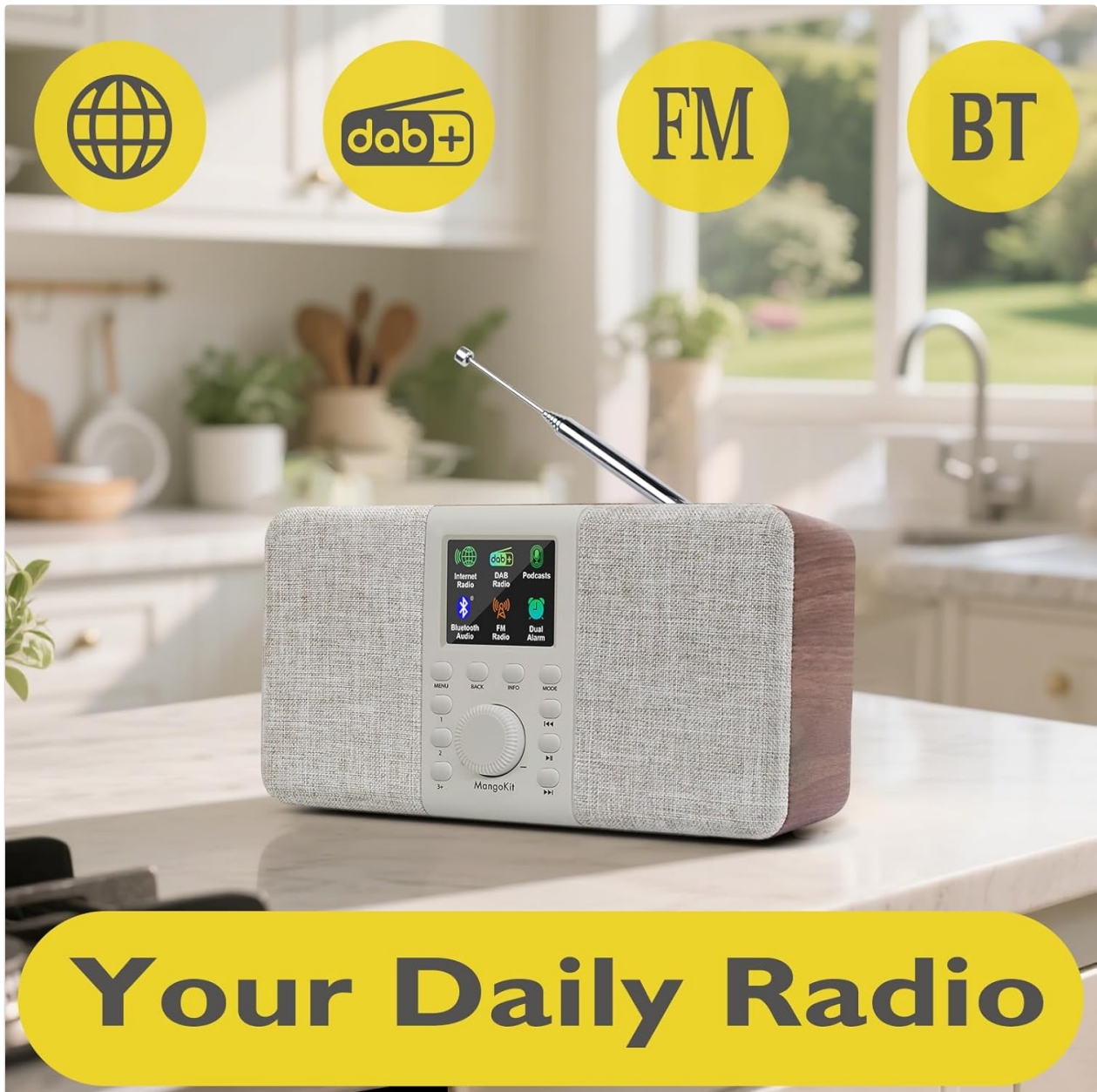
Image 1: Front view of the MangoKit SR20 Internet Radio, highlighting the color display, central control knob, and surrounding function buttons.