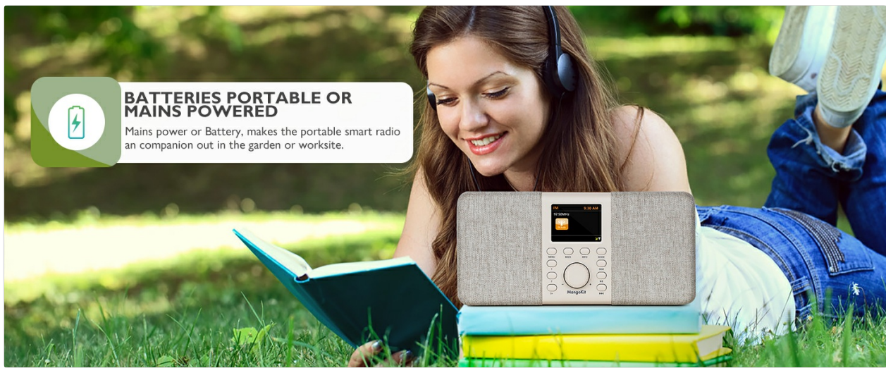
Image 5: The MangoKit SR20 in Internet Radio mode, showing station details on its display.