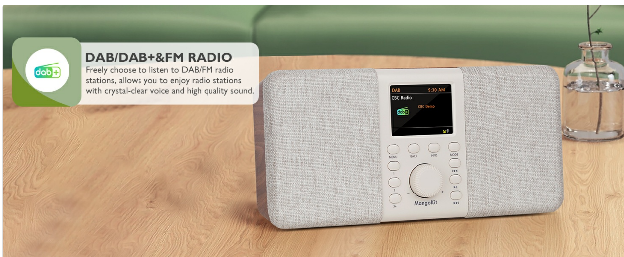
Image 4: The MangoKit SR20 radio can be controlled wirelessly via the Oktivie App on your smartphone after Wi-Fi setup.