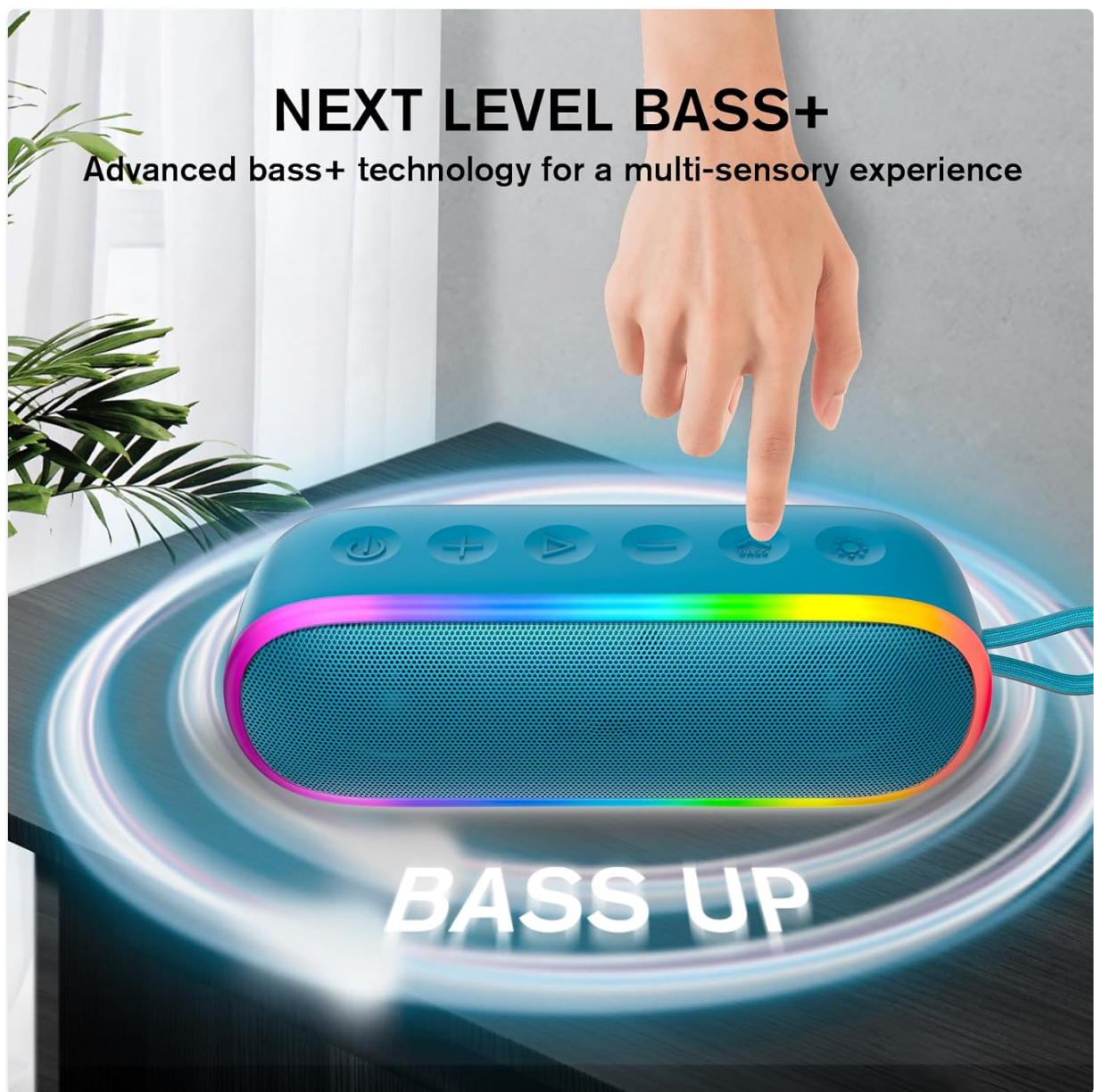
Figure 6: Bass+ Button Function

This image shows a finger pressing the 'Bass+' button on the speaker's control panel, illustrating the direct interaction point for activating the advanced bass enhancement technology.