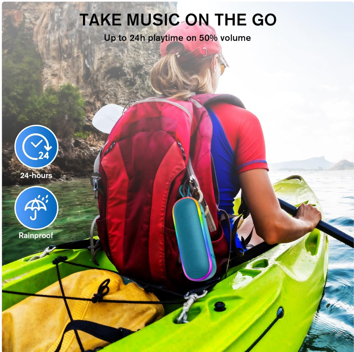
Figure 7: IPX7 Waterproof Capability

highly resistant to splashes, rain, and temporary submersion, ideal for use in environments like pools, beaches, or during camping and hiking.