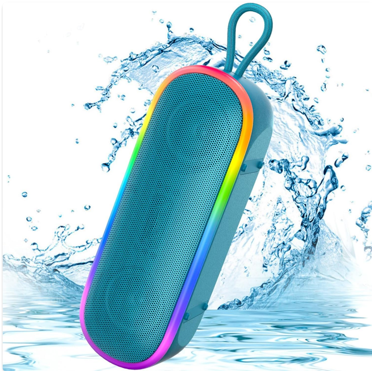
Figure 1: MEGUO A15PRO Bluetooth Speaker

This image showcases the MEGUO A15PRO portable Bluetooth speaker in green, highlighting its vibrant LED light ring and its waterproof design with water splashing around it.