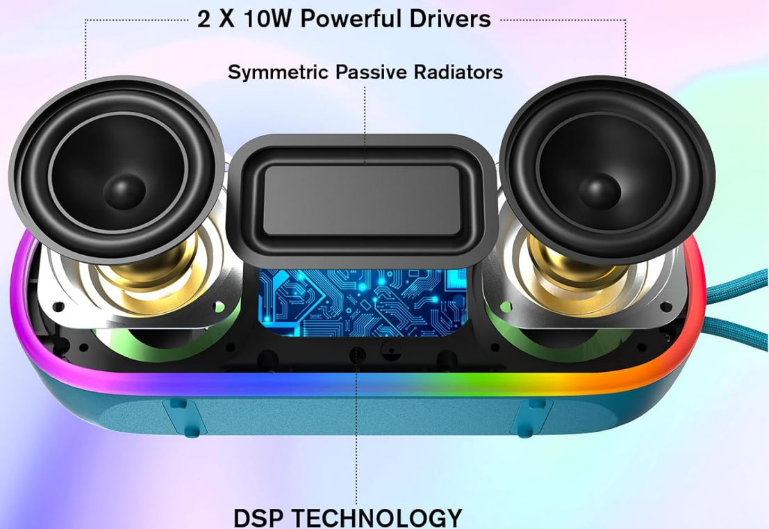
Figure 4: Acoustic Design

This diagram illustrates the internal acoustic components of the MEGUO A15PRO speaker, highlighting its dual 10W powerful drivers and a symmetric passive radiator, which work together with DSP technology to produce high-quality, loud sound.