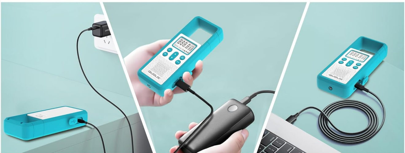
Image: A series of images illustrating the USB-C charging process for the walkie talkie, showing connections to a wall adapter, a power bank, and a laptop, highlighting the convenience of Type-C charging.