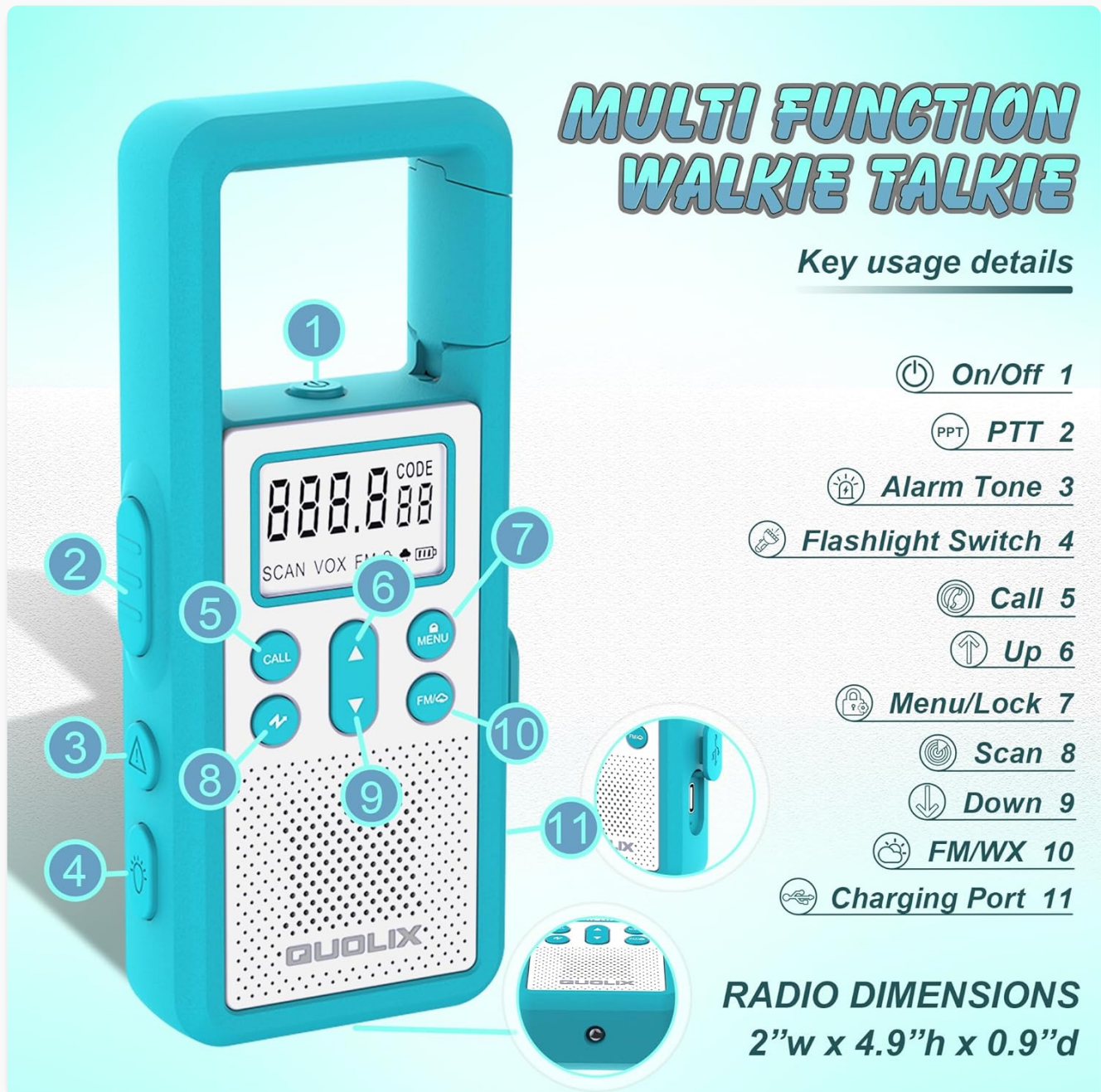
Image: Detailed diagram of the QUOLIX Q368 Walkie Talkie, highlighting its various buttons and features. The image shows the front face of the walkie talkie with a screen displaying channel and code information, along with buttons for Call, Menu, Up, Down, FM/WX, and a power button on the top. A side view indicates the PTT button, alarm tone button, flashlight switch, and charging port.

Familiarize yourself with the components and controls of your QUOLIX Q368 Walkie Talkie.