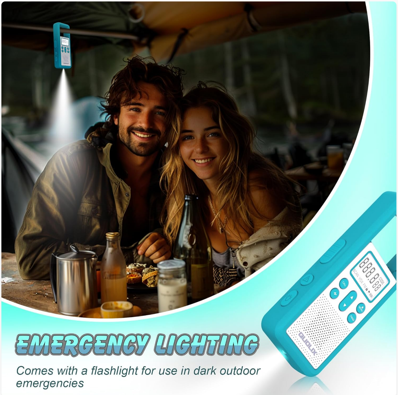
Image: A walkie talkie with its LED flashlight activated, providing illumination in a dark outdoor camping setting, demonstrating its utility for emergency lighting.