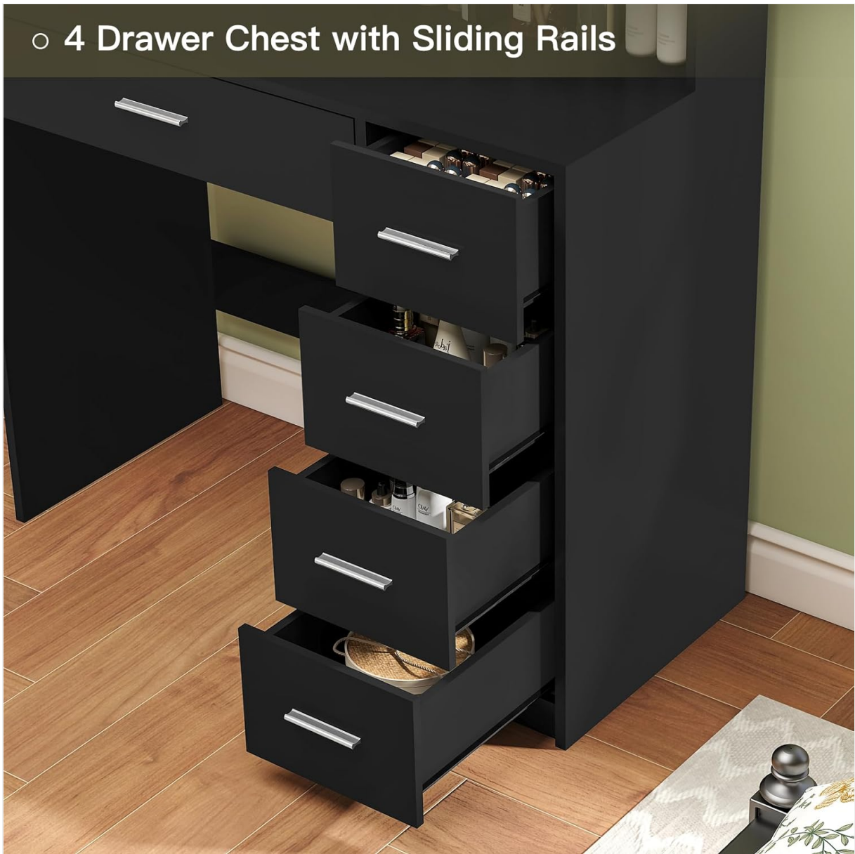
Figure 5.3: Four-drawer chest with sliding rails. This close-up image illustrates the smooth operation of the side drawers, highlighting the sliding rail mechanism for easy access to stored items.