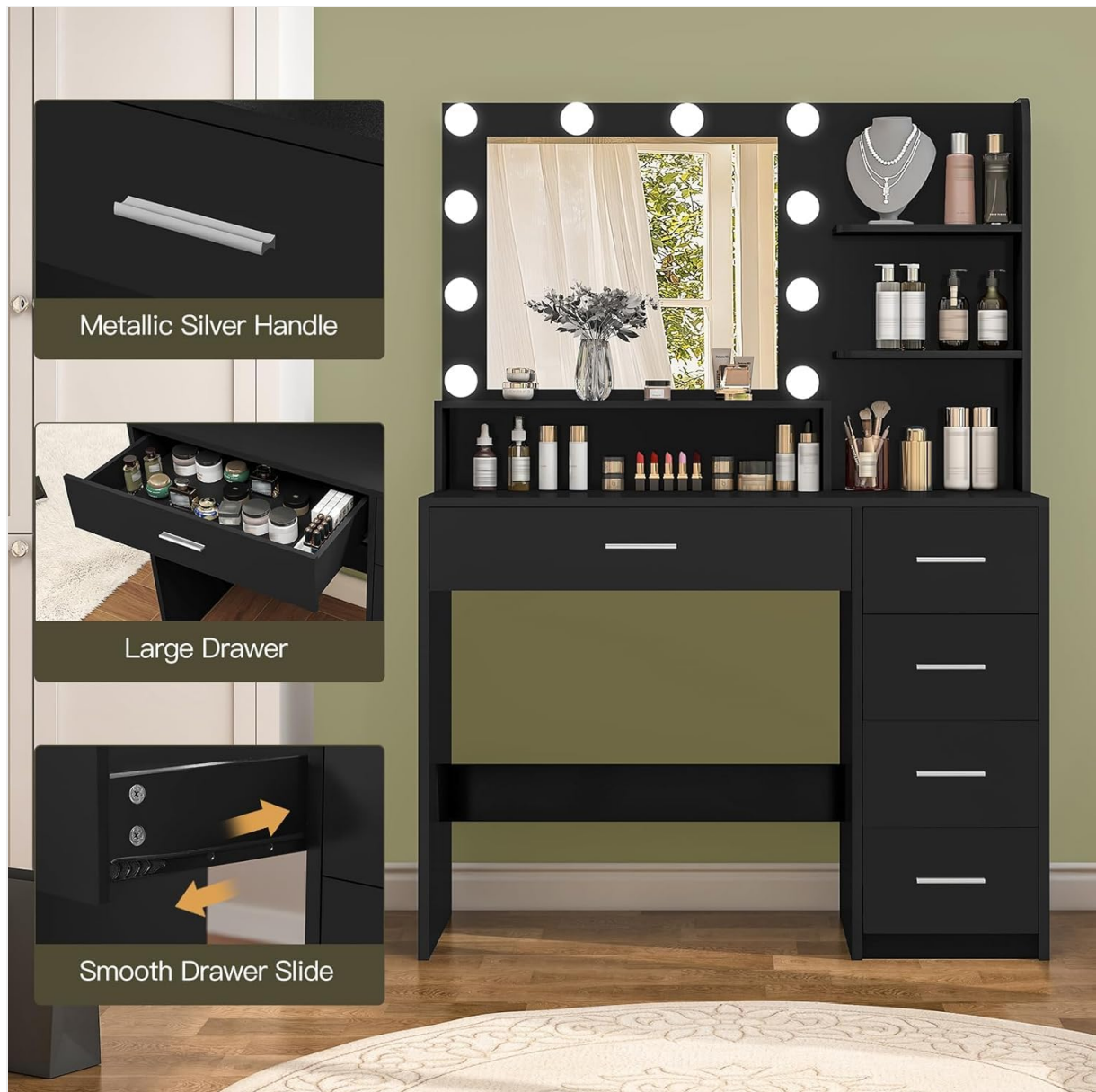
Figure 4.2: Key features of the vanity desk. This image highlights the metallic silver handles, the spacious large drawer, and the smooth drawer slides, providing a closer look at these components.