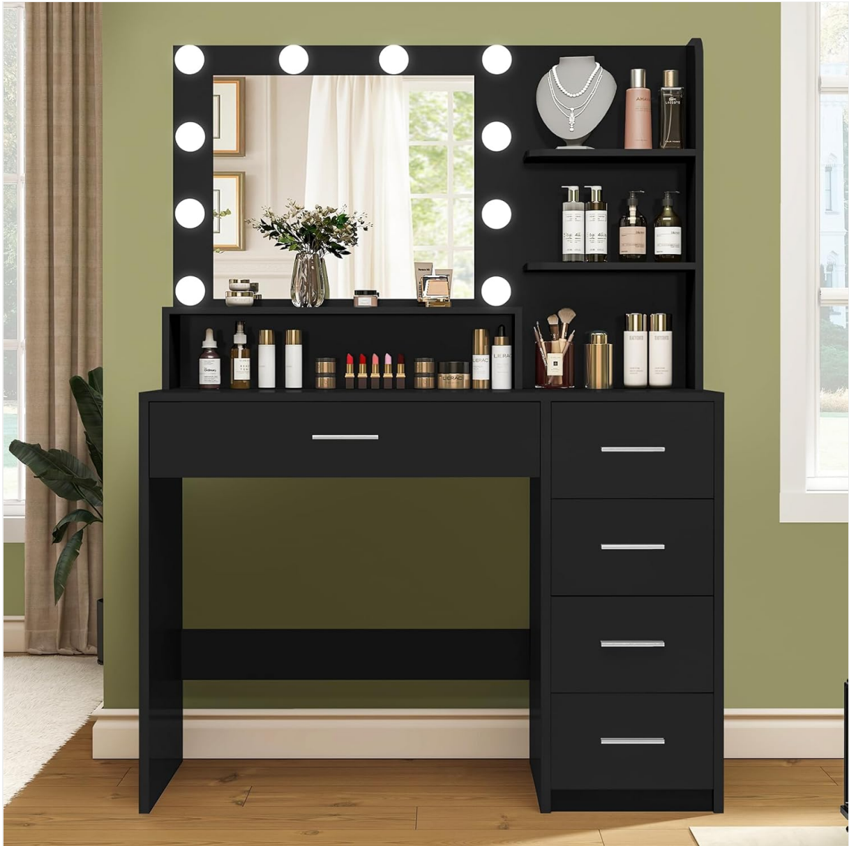
Figure 3.1: Overview of the Quimoo Makeup Vanity Desk. This image displays the complete vanity desk in black, featuring the illuminated mirror, a central drawer, and a stack of four drawers on the right, along with open shelves for storage.