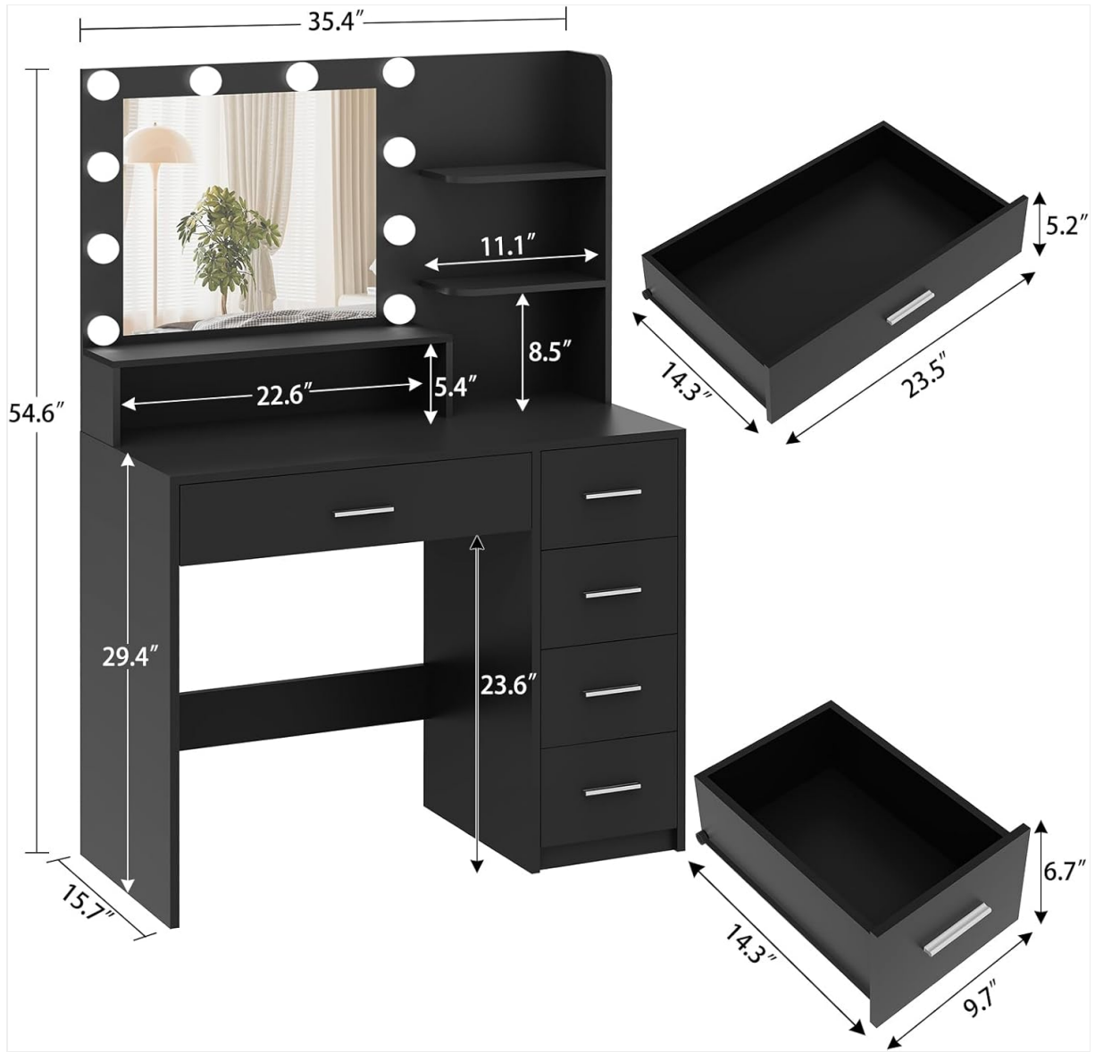
Figure 4.1: Product dimensions. This diagram illustrates the overall dimensions of the vanity desk, including height, width, depth, and specific measurements for the mirror, desktop, and drawers.