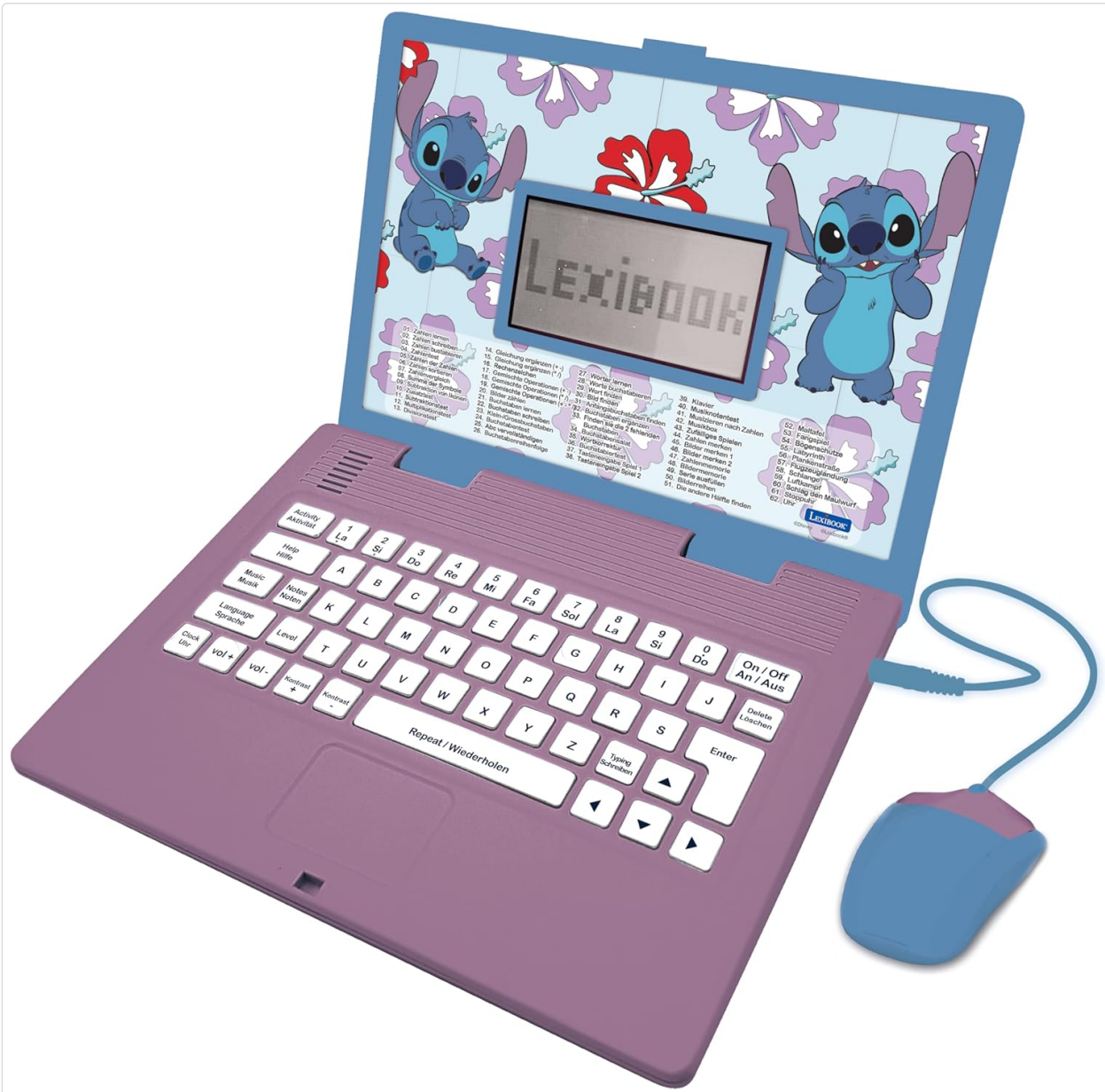
Image 1.1: The Lexibook Disney Stitch JC598Di3 Bilingual Educational Laptop.