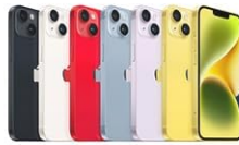
iPhone 14 Series