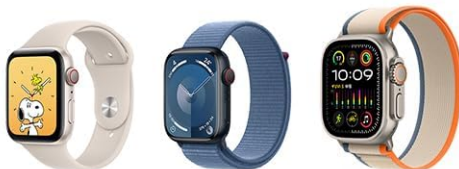
Apple Watch Ultra/SE/9/8/7/6/5/4/3