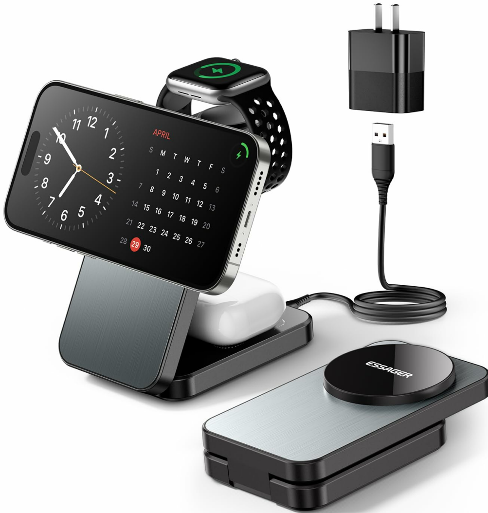
Figure 1: The ESSAGER 3-in-1 Foldable Travel Wireless Charger in its compact, folded state.