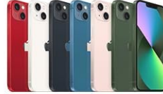
iPhone 13 Series