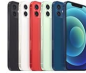
iPhone 12 Series