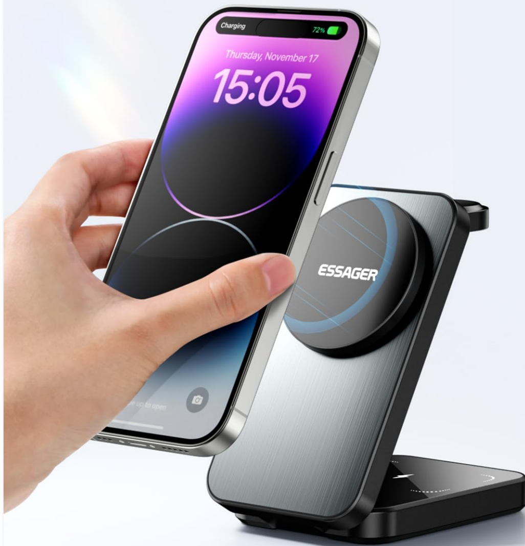
Figure 2: The charger unfolded, ready to receive an iPhone for magnetic charging.