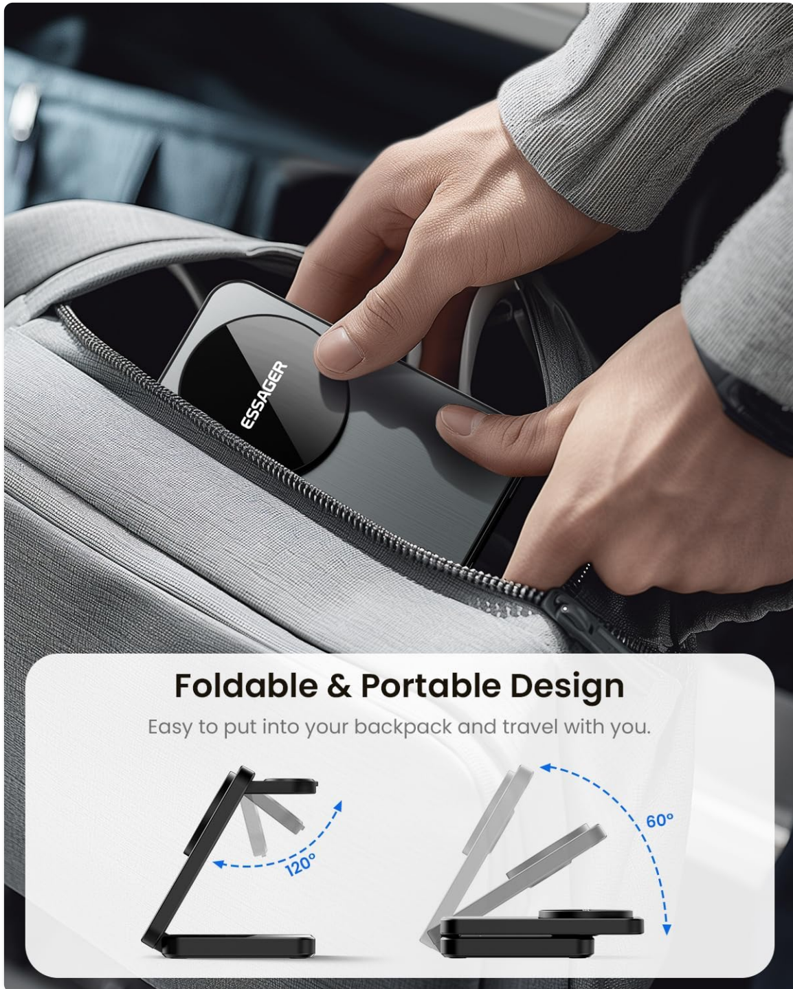
Figure 7: The foldable design allows for easy storage and portability in a backpack.