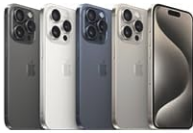
iPhone 15 Series