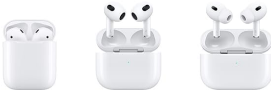
AirPods 2/3/Pro/Pro 2