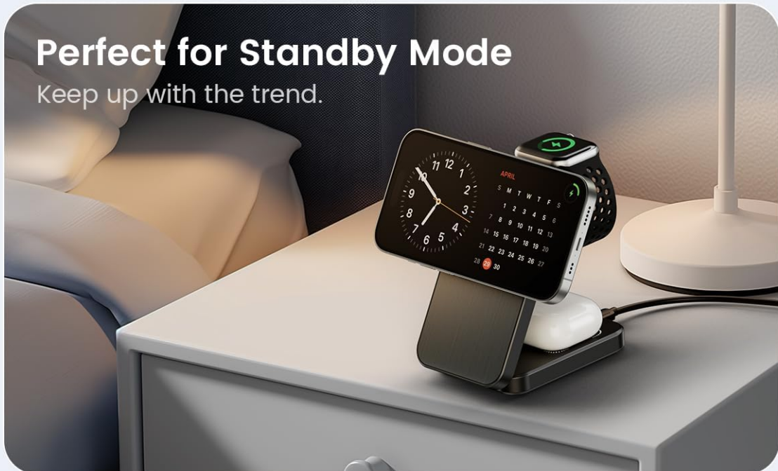
Figure 4: The charger can be used as a phone stand for video calls or in Standby Mode on a bedside table.