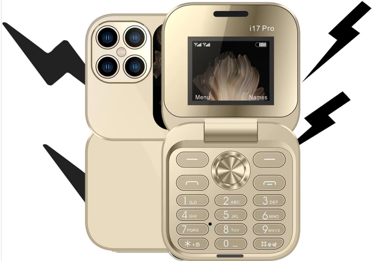
Image 5.4: The MJ DHS I17pro flip phone indicating its vibration function, useful for discreet notifications.

Vibration reminders can be activated during meetings. Can receive notifications without disturbing others