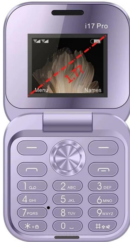
Image 5.1: The 1.77-inch screen of the MJ DHS I17pro flip phone, showing menu options and contact names.

Easy for users to operate with one hand and carry around