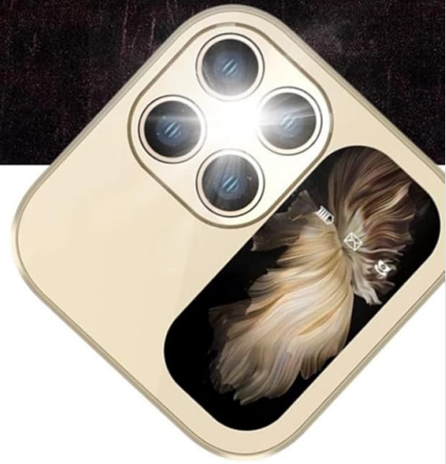
Image 5.3: The MJDHS I17pro flip phone highlighting its integrated LED flashlight feature, useful in low-light conditions.

The phone includes an integrated LED flashlight. To activate or deactivate it, refer to the phone's menu or check for a dedicated shortcut key, often a long press on a specific number key (e.g., '0' or '*').