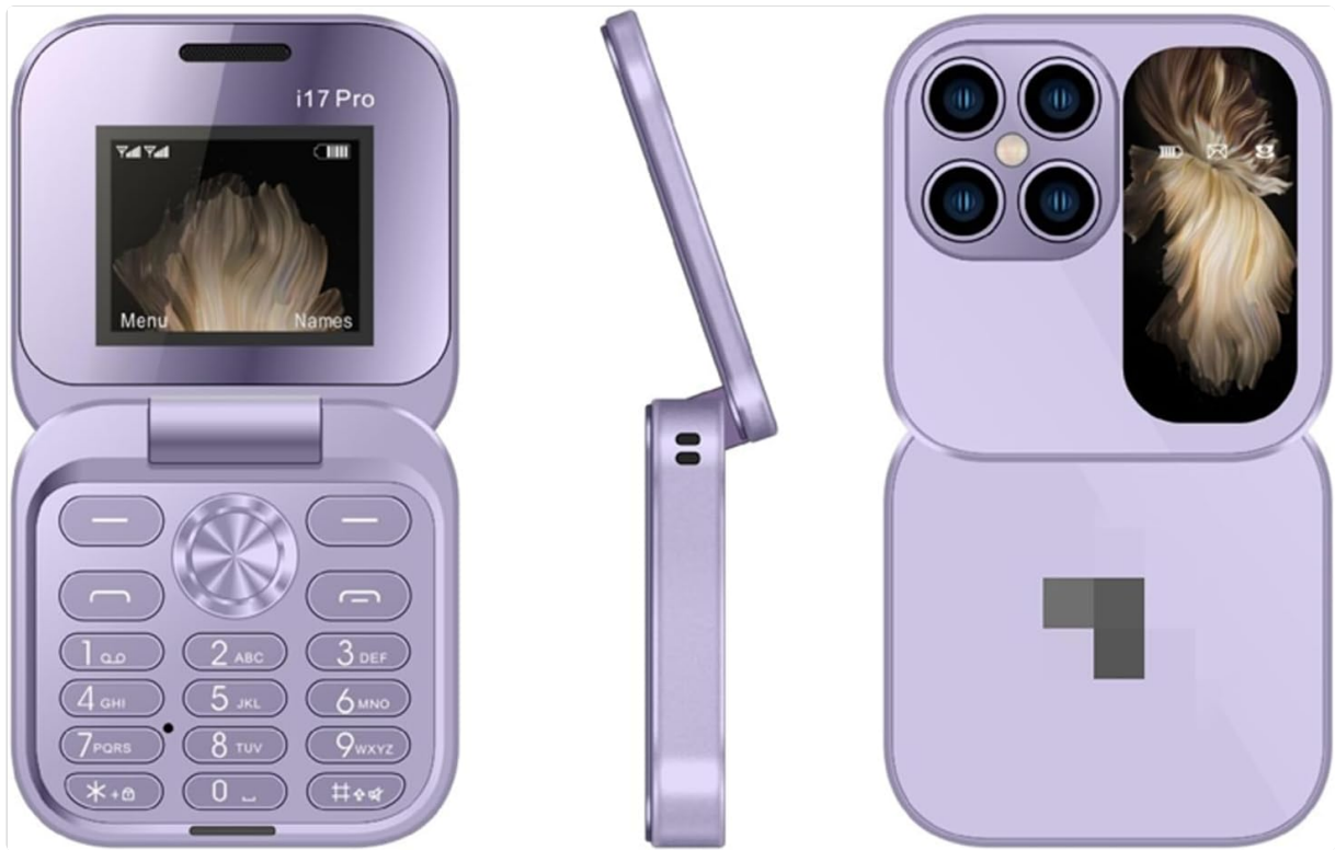
Image 3.1: Front view of the MJ DHS i17pro flip phone in the open position, showing the screen and keypad. Also shown are the side profile and the closed view with the external camera module.