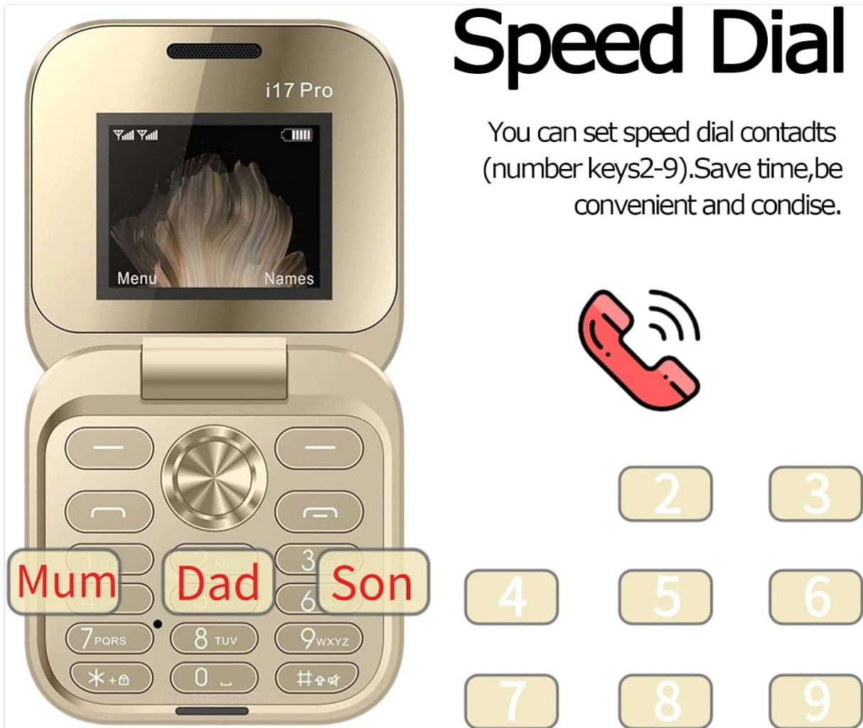
Image 5.2: The MJ DHS I17pro flip phone illustrating the assignment of speed dial contacts (e.g., Mum, Dad, Son) to number keys 2-9.