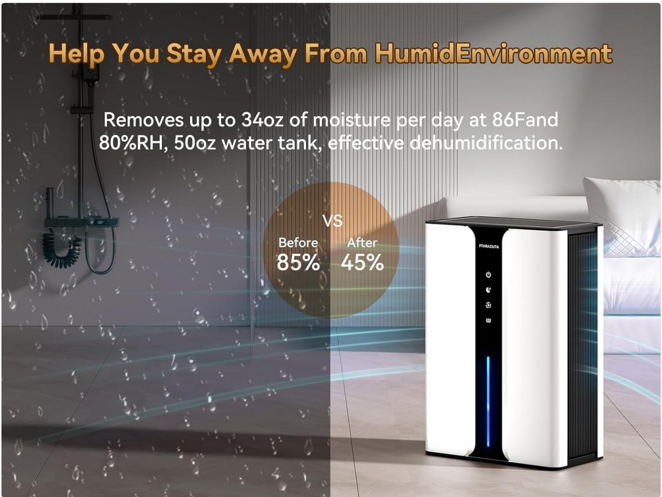
Image Description: Visual comparison showing a reduction in humidity from 85% to 45% after using the dehumidifier, demonstrating its effectiveness in creating a less humid environment.