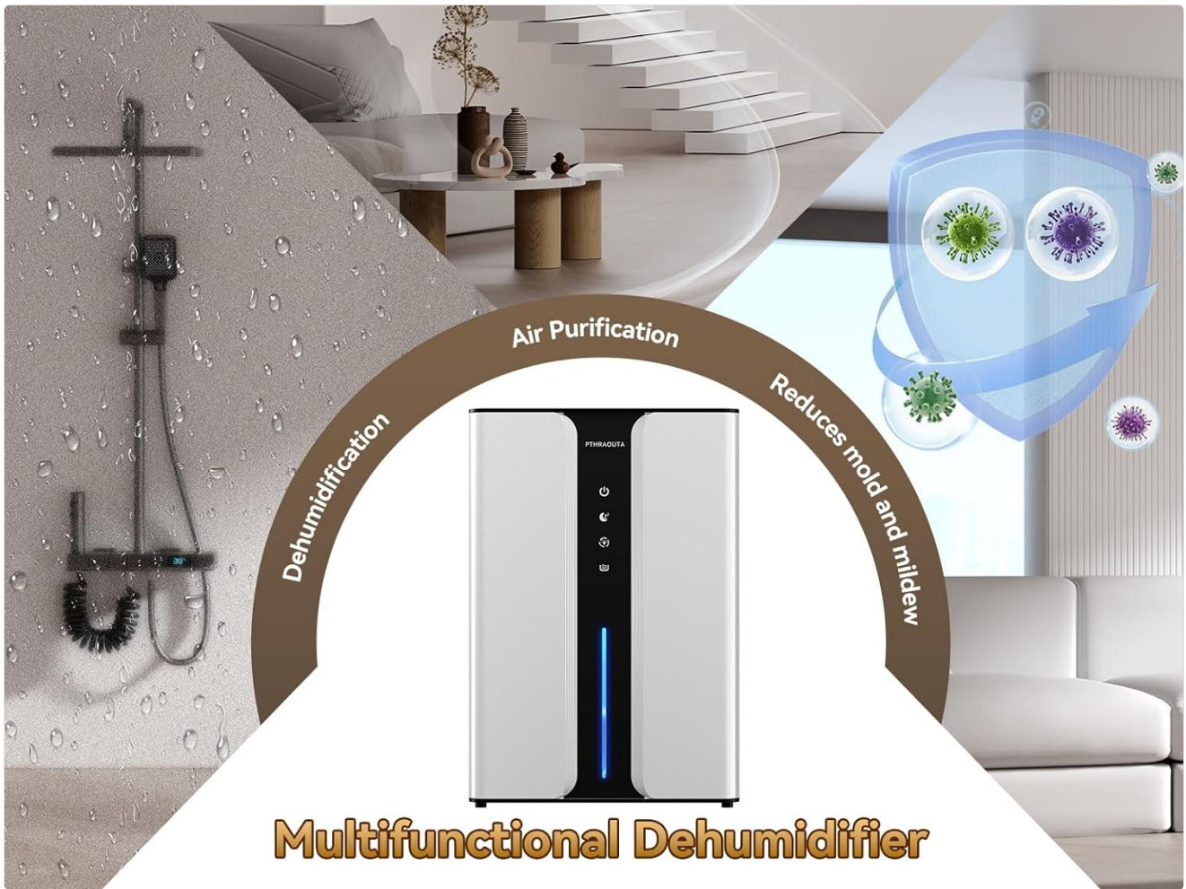
Image Description: Diagram highlighting the dehumidifier's multifunctional capabilities, including dehumidification, air purification, and reduction of mold and mildew.