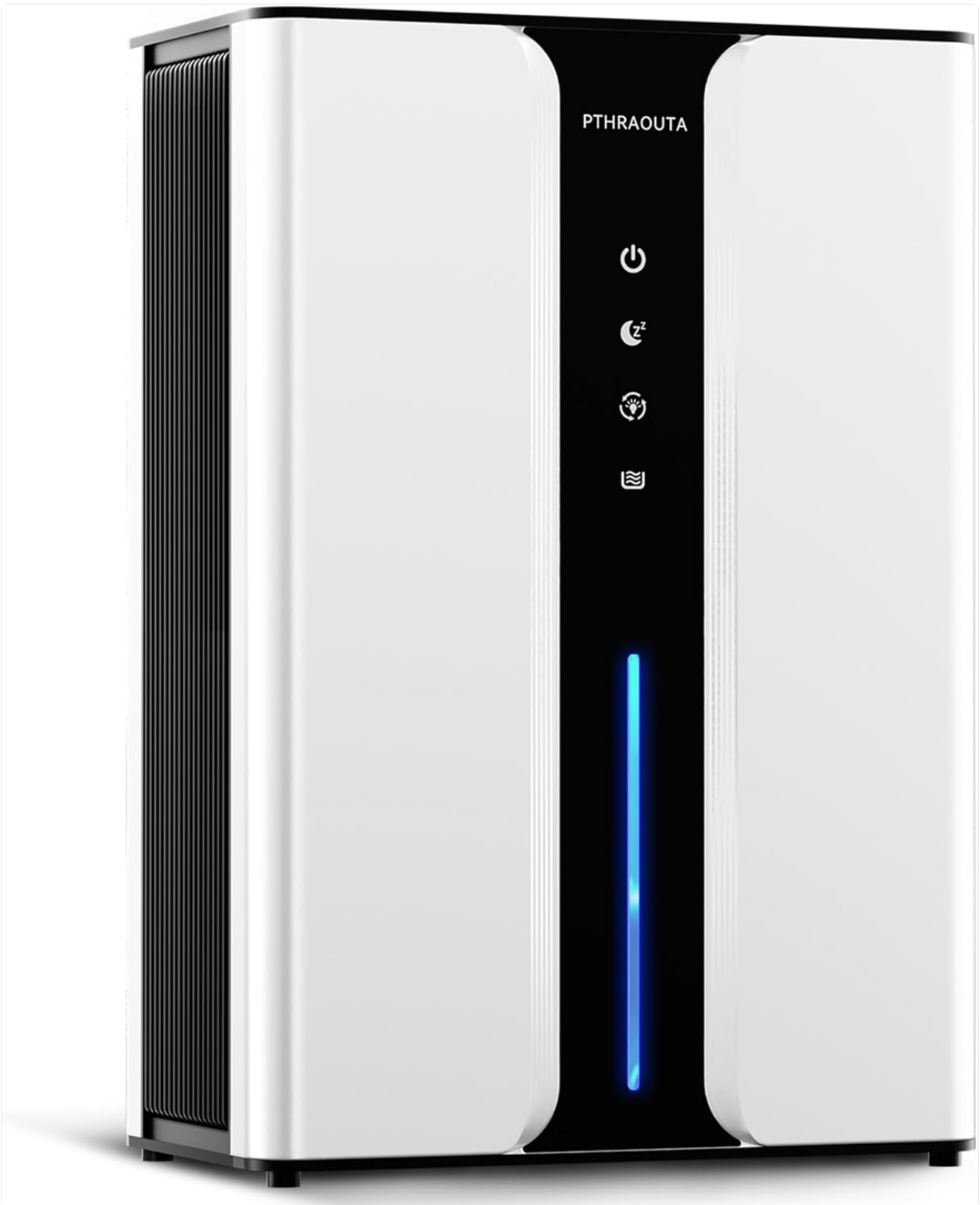
Image Description: Front view of the PTHRAOUTA H10-1 Dehumidifier, showing its white casing, black control panel with indicator lights, and a blue light strip at the bottom.