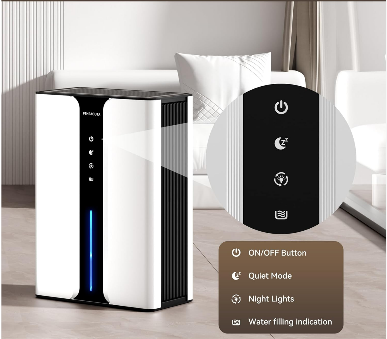
Image Description: Close-up of the dehumidifier's control panel, illustrating the ON/OFF button, Quiet Mode indicator, Night Lights button, and Water Filling Indication light.