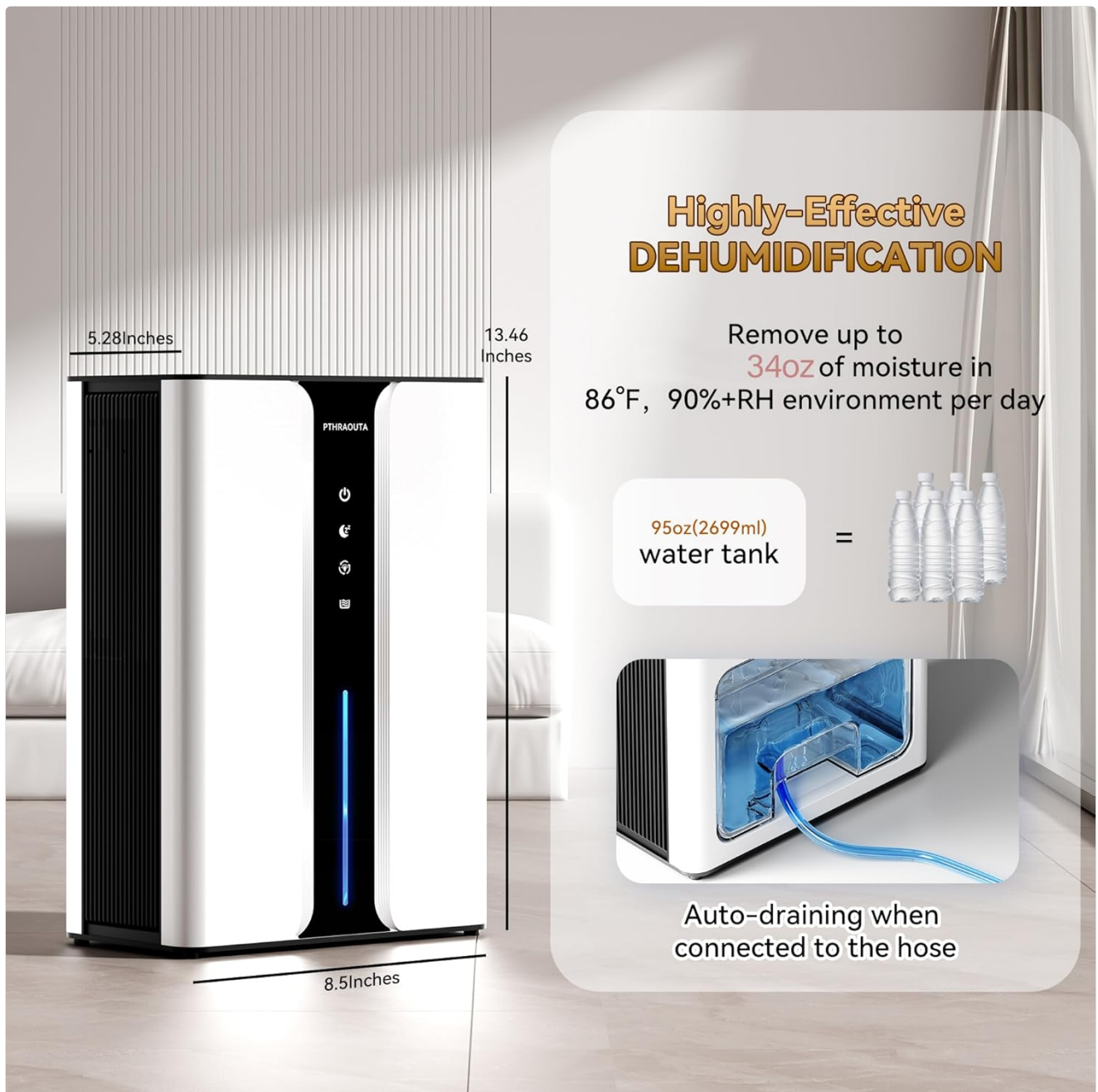
Image Description: Diagram showing the dimensions of the dehumidifier (8.5 inches wide, 5.29 inches deep, 13.46 inches high) and illustrating its 95oz water tank capacity and continuous drainage feature.