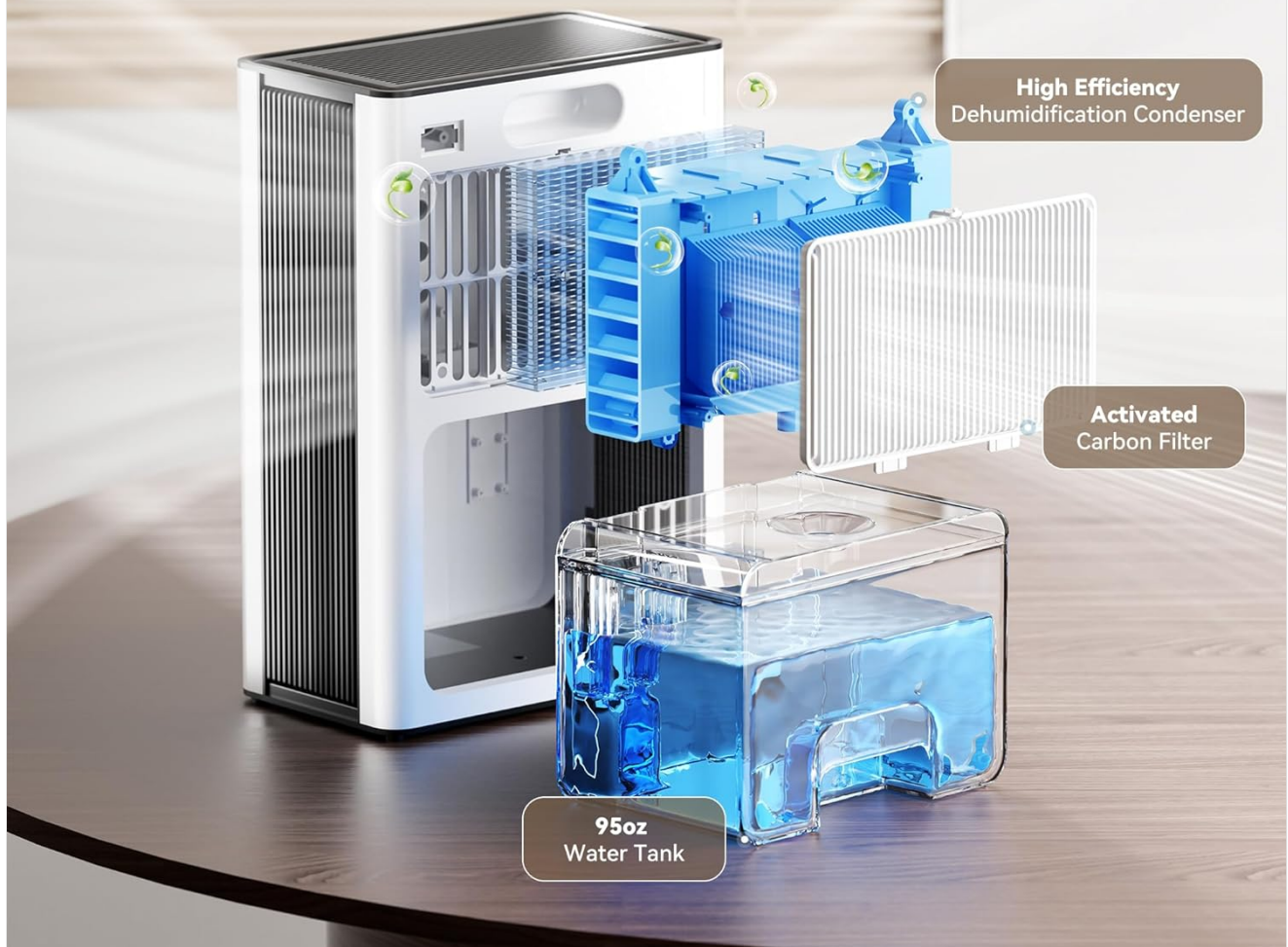
Image Description: Exploded view of the dehumidifier showing the High Efficiency Dehumidification Condenser, Activated Carbon Filter, and the 95oz Water Tank, highlighting the air purification components.

Dehumidifies and purifies the air at the same time