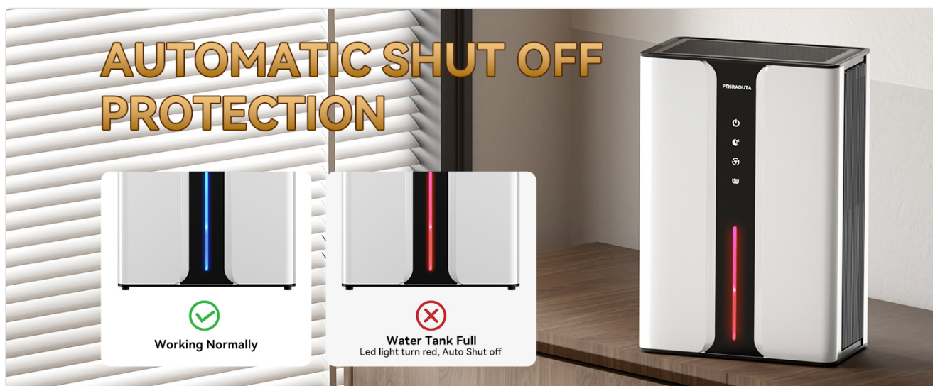
Image Description: Illustration of the automatic shut-off protection, showing the dehumidifier operating normally with a blue light and then stopping with a red light when the water tank is full.

The dehumidifier is equipped with an automatic shut-off feature for safety and convenience. When the water tank is full or incorrectly positioned, the unit will automatically stop operation, and the Water Full Indicator will illuminate. Empty and correctly reinsert the water tank to resume operation.