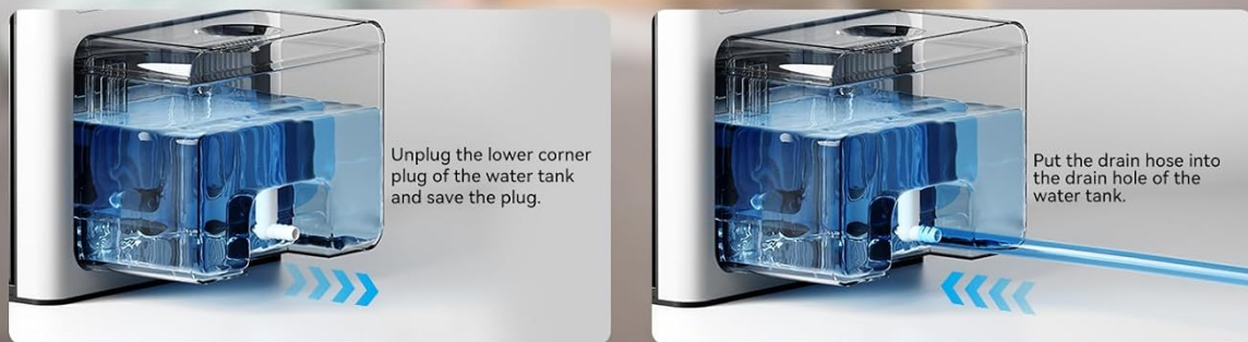
Image Description: Diagram illustrating the two steps for setting up continuous drainage: unplugging the corner plug of the water tank and inserting the drain hose into the designated hole.