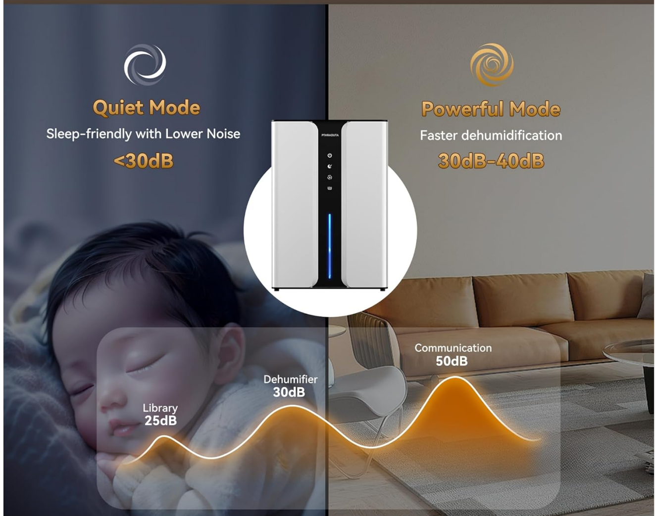
Image Description: Infographic comparing the noise levels of Quiet Mode (below 30dB, suitable for sleeping) and Powerful Mode (30dB-40dB), illustrating the dehumidifier's quiet operation.

High power mode meets your daily needs, and sleep mode allows you to fall asleep peacefully